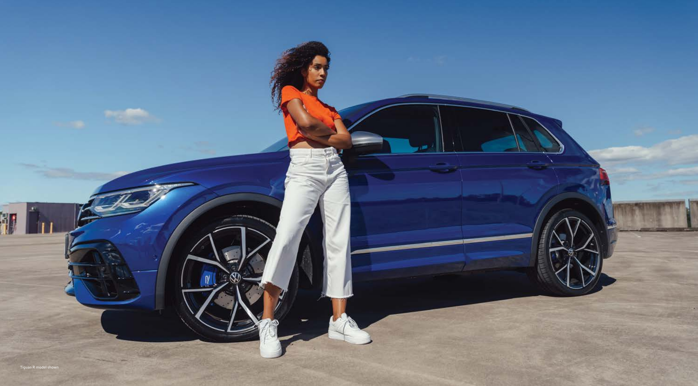
Tiguan R model shown