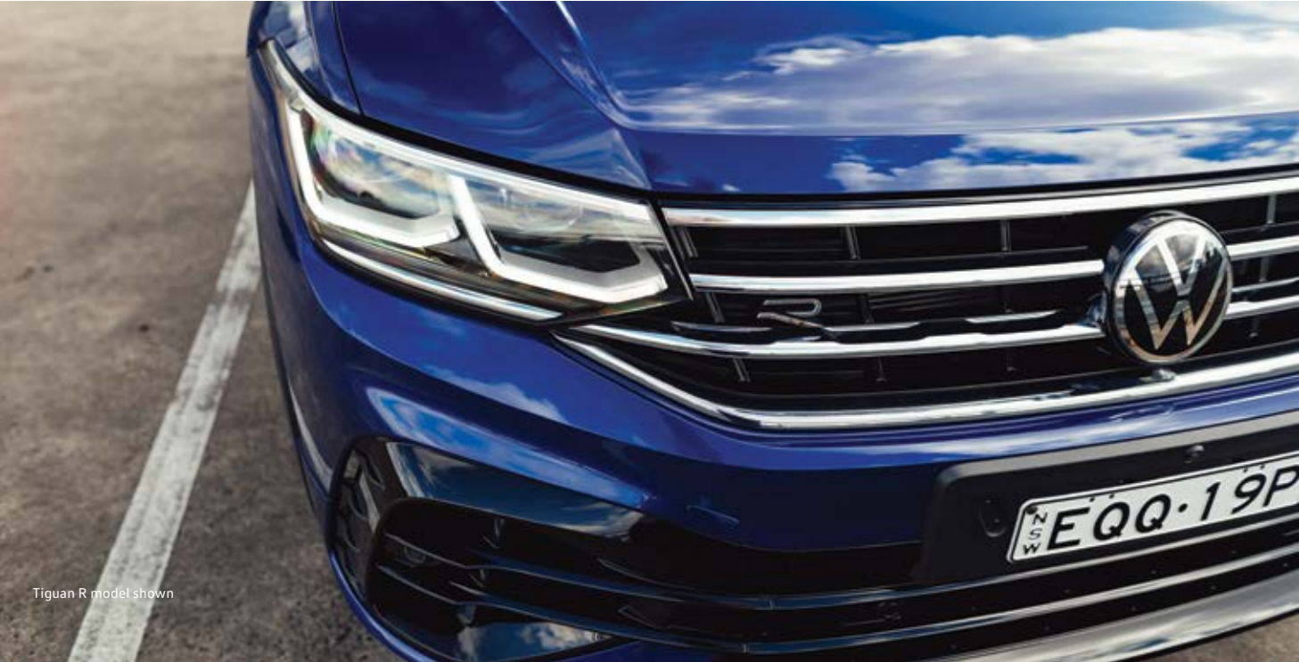
Tiguan R model shown

It’s when the Tiguan R is viewed in profile that it really asserts its identity. Power folding mirrors in matte silver and with memory are a distinctive R feature, as are signature blue brake calipers with R logo, which are as impressive in performance as they are in appearance. Striking 21-inch ‘Estoril’ alloy wheels are a perfect complement to the Tiguan R’s blue brake calipers and are another reminder of the vehicle’s brimming performance potential.