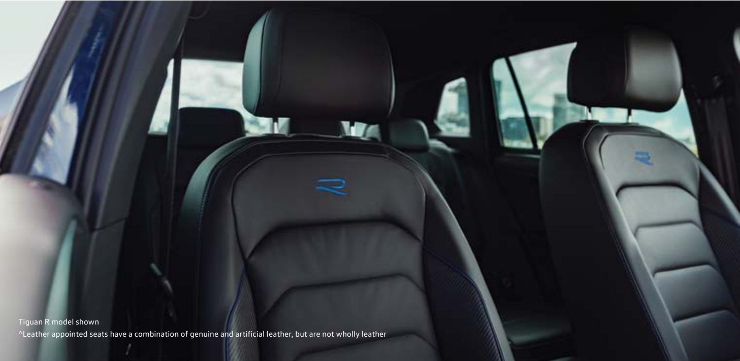
Tiguan R model shown ^Leather appointed seats have a combination of genuine and artificial leather, but are not wholly leather

The Tiguan R makes a bold statement by projecting an illuminated R logo onto the ground when the front doors are opened. For the ultimate mood-setter, the Tiguan R even offers a choice of ambient interior lighting colours. Create your own virtual colour landscape by choosing from among 30 appealing hues.