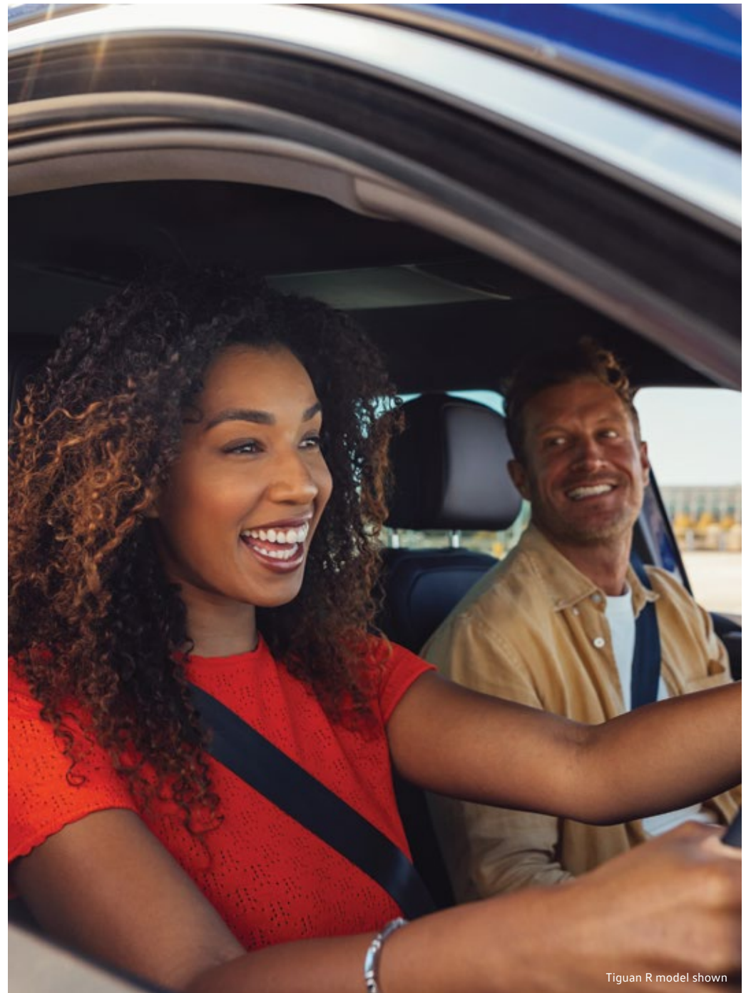
Tiguan R model shown