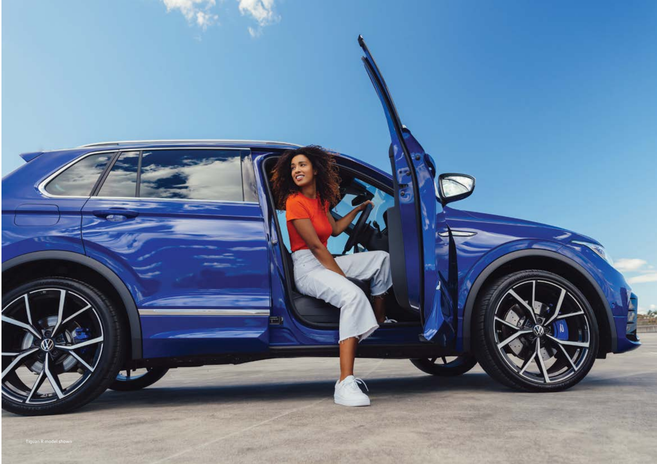
Tiguan R model shown