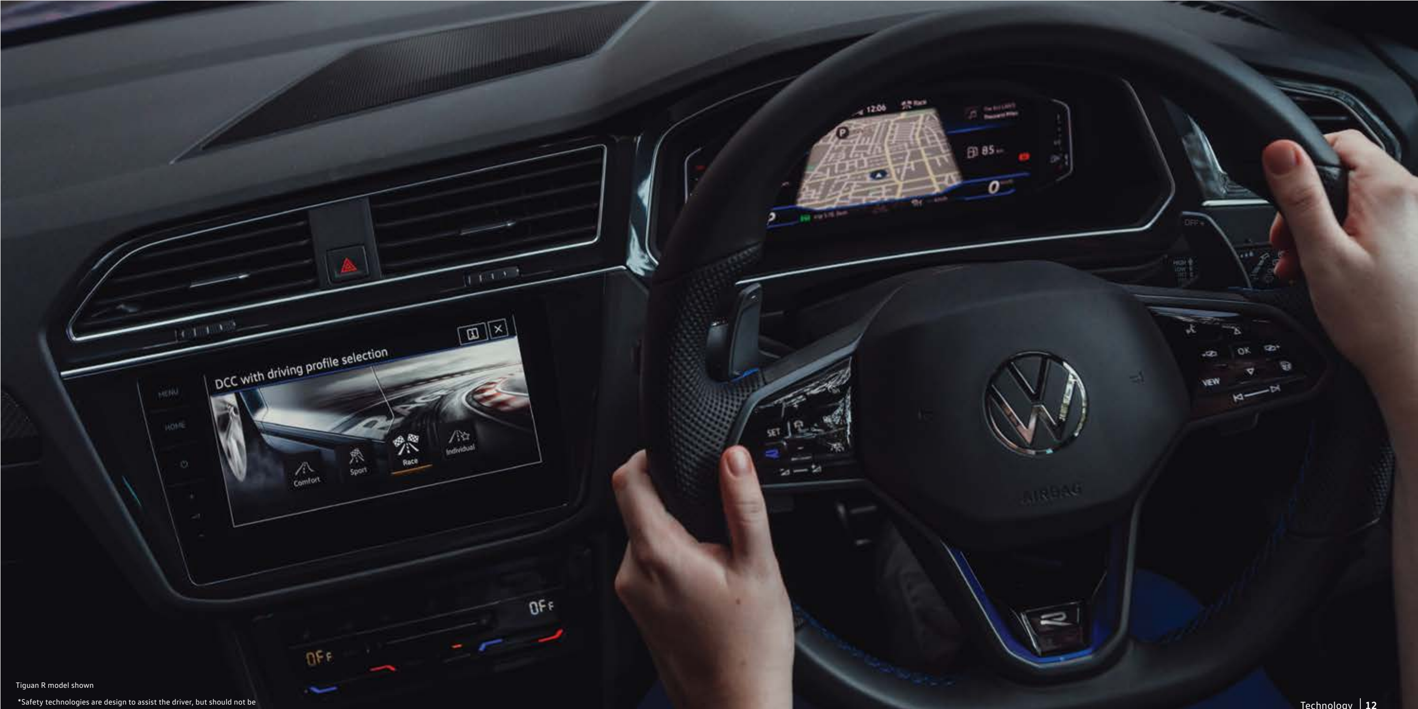
Tiguan R model shown

*Safety technologies are design to assist the driver, but should not be used as a substitute for safe driving practices.