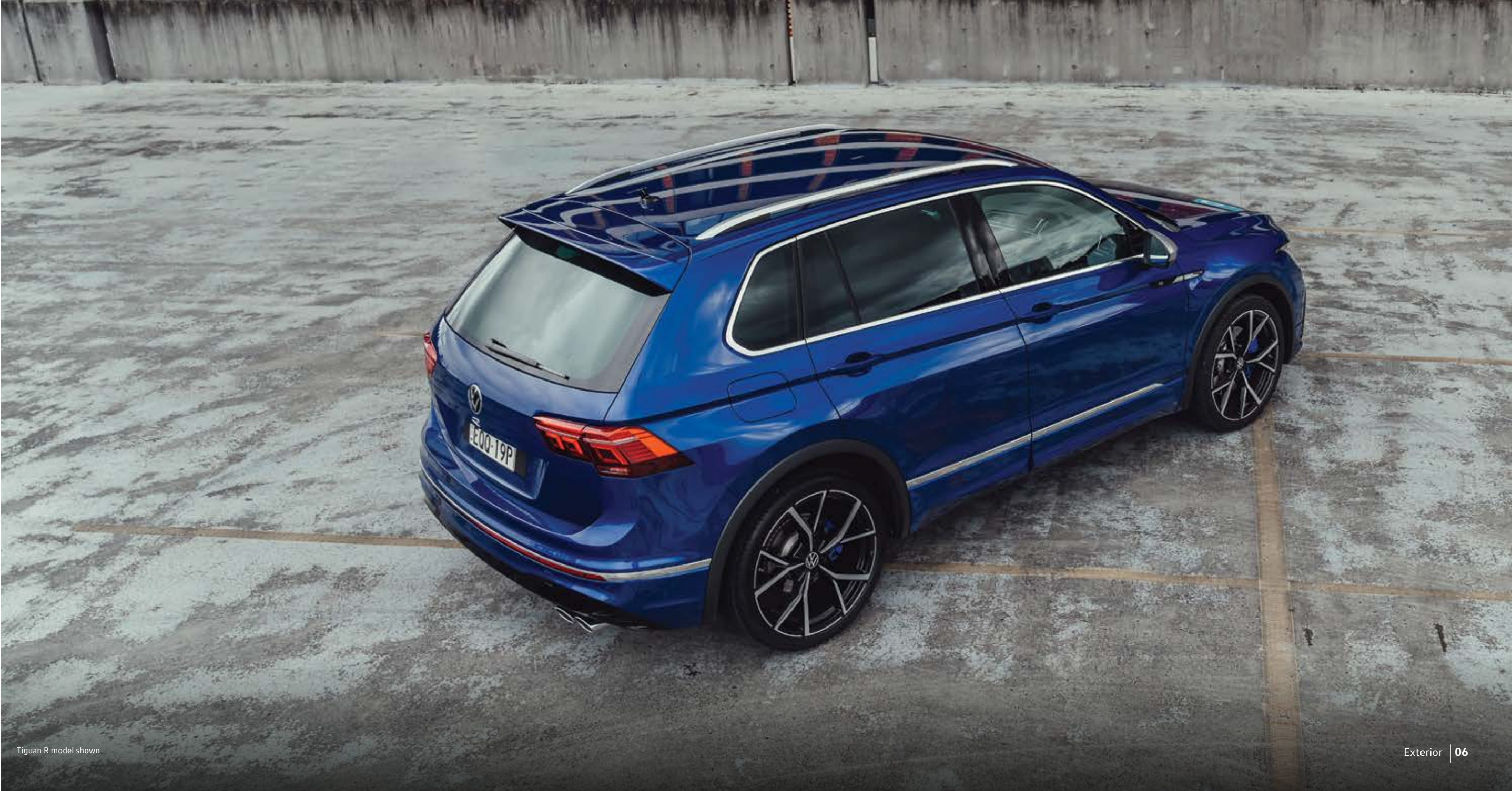
Tiguan R model shown