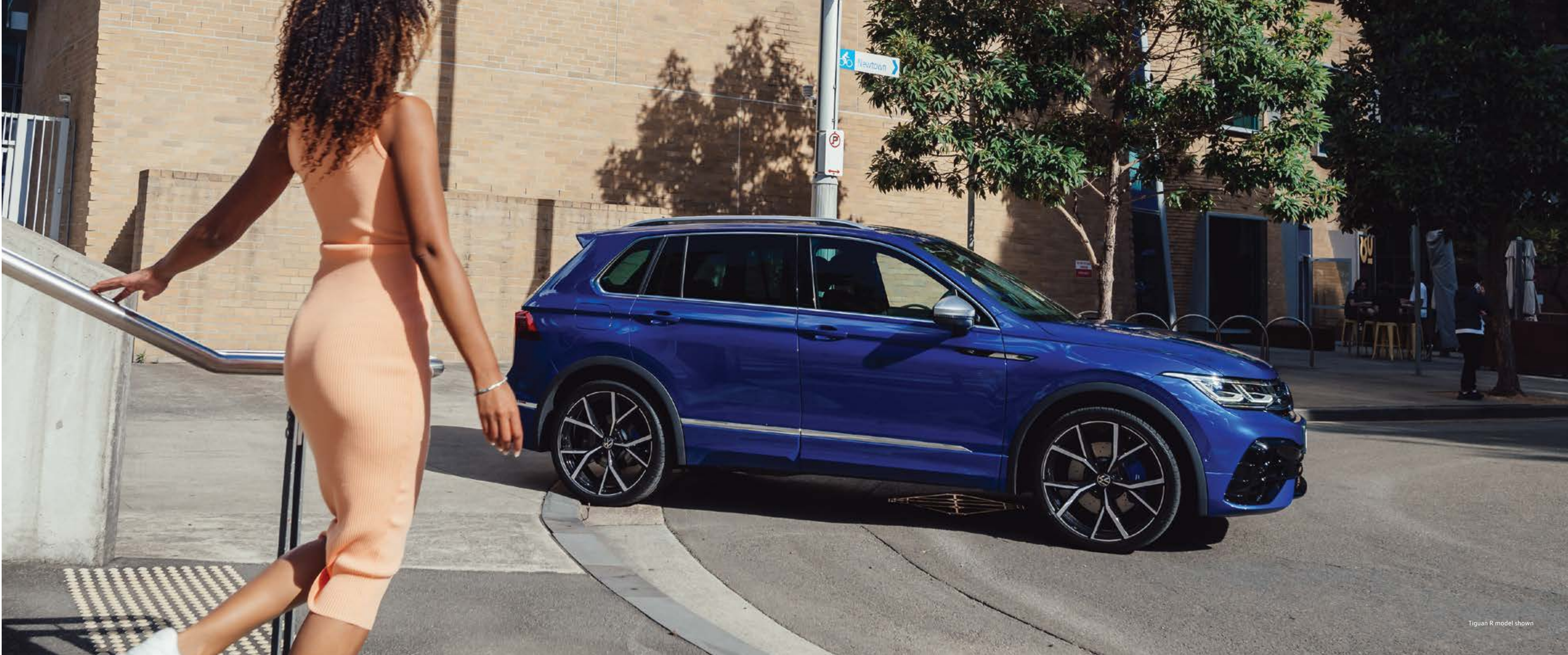
Tiguan R model shown