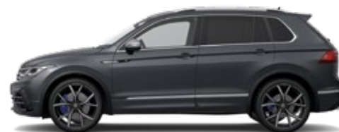
Dolphin Grey Metallic