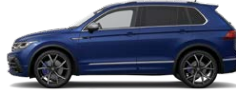
Lapis Blue Premium Metallic