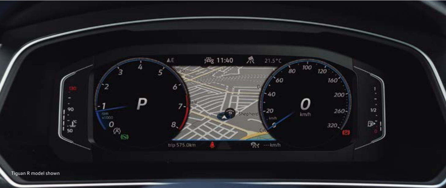
Tiguan R model shown

Taking inspiration from the cockpit of fighter planes is the Tiguan R's ingenious Head Up Display*. Important driver information such as vehicle speed, navigation instructions and driver assistance system messages are projected onto a glass panel at the centre of the driver's field of vision. It's yet another example of the Tiguan R's forward-thinking approach to driver and passenger safety.