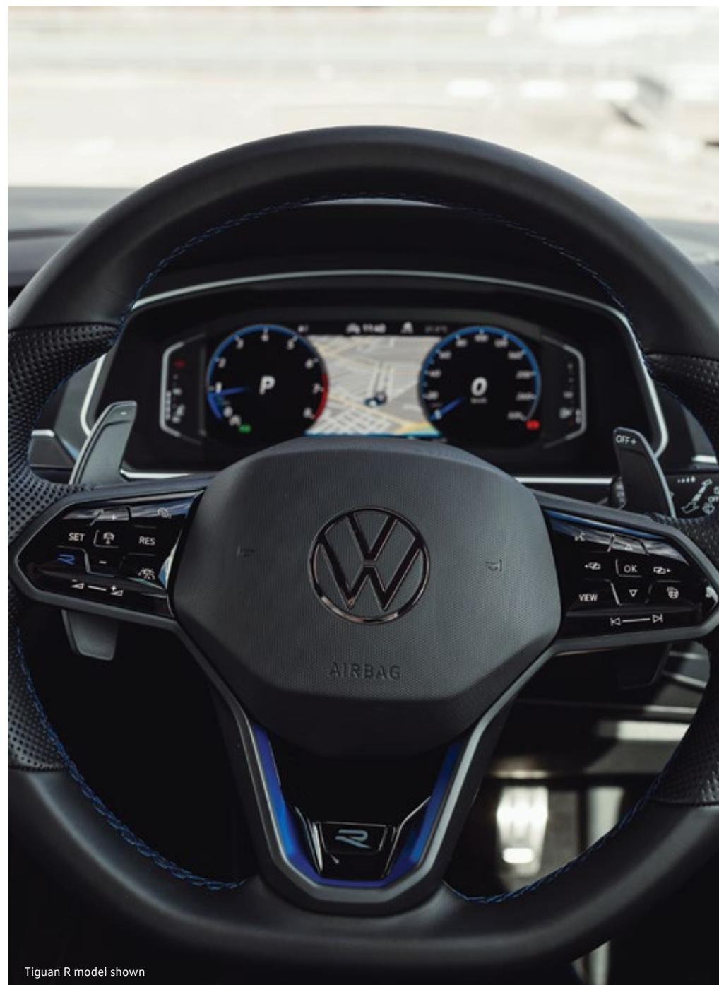
Tiguan R model shown