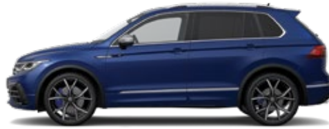
Lapiz Blue Premium Metallic