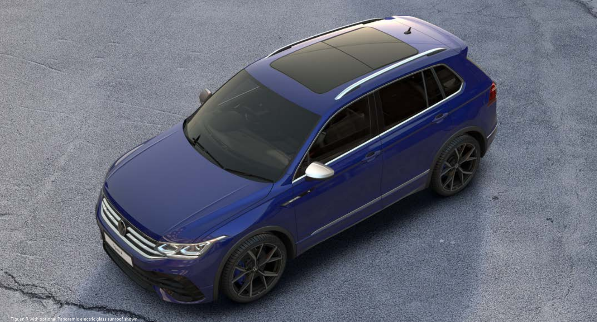
Tiguan R with optional Panoramic electric glass sunroof shown

Slide and tilt adjustable, and incorporating an automatic wind deflector, the sunroof lets sunlight stream into the cabin while reducing buffeting wind. With the UV resistant electronic blind closed, you can be sure you’re protected from the sun’s harmful rays.