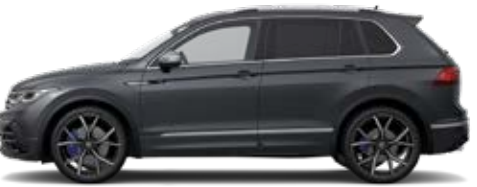
Dolphin Grey Metallic