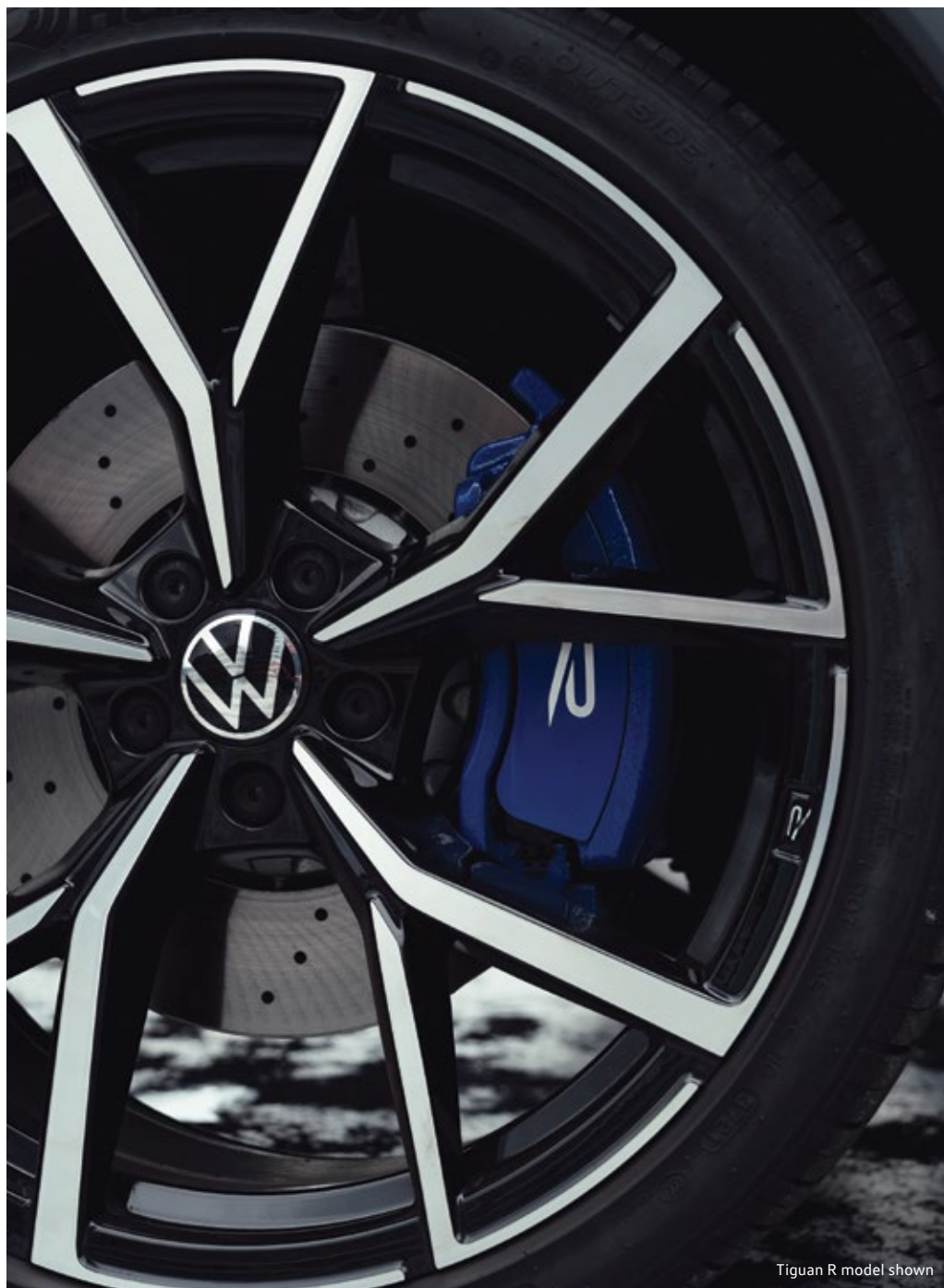
Tiguan R model shown