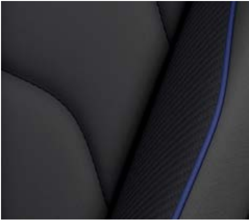
Black R Nappa Leather appointed seat upholstery^