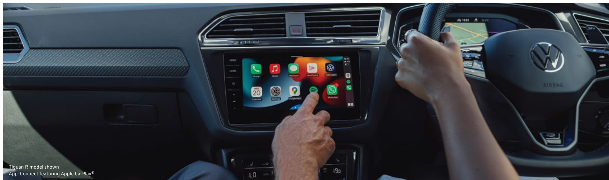
Tiguan R model shown App-Connect featuring Apple CarPlay®

+ With rear seat in the forward position