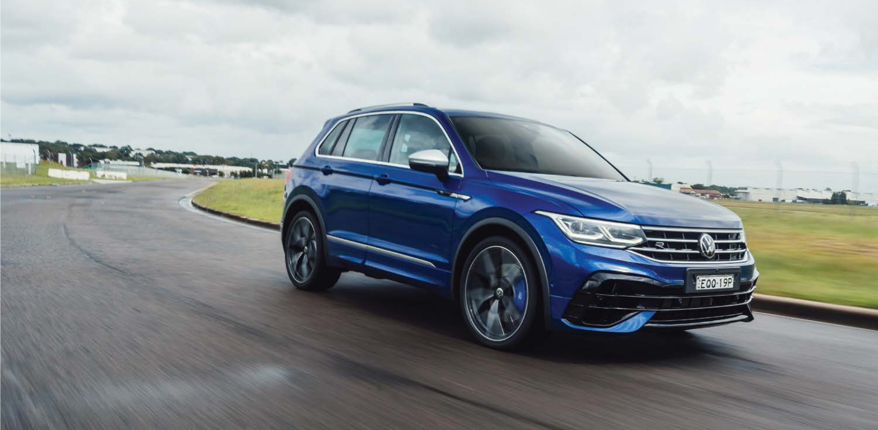
Tiguan R model shown