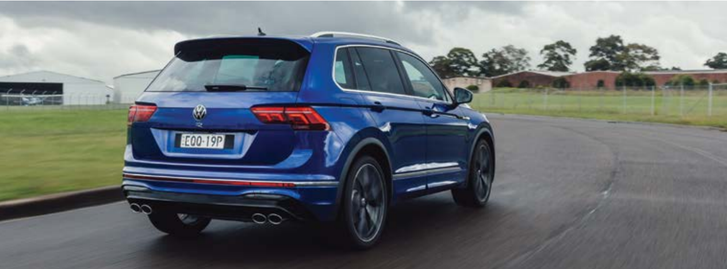
Tiguan R model shown **Please note figures are sourced from overseas data where equipment levels by model variant may vary.

Every drive in the Tiguan R is an emotive experience, but it's possible to accentuate the immersive growl of Tiguan R's quad exhaust by choosing from among four distinct engine sounds. Select 'Comfort', 'Sport', 'Race' or 'Pure' from the driving profile options available to customise the engine sound exactly as you like it. Selecting 'Pure' means no sound amplification is used, perfect for that original, pure engine sound.