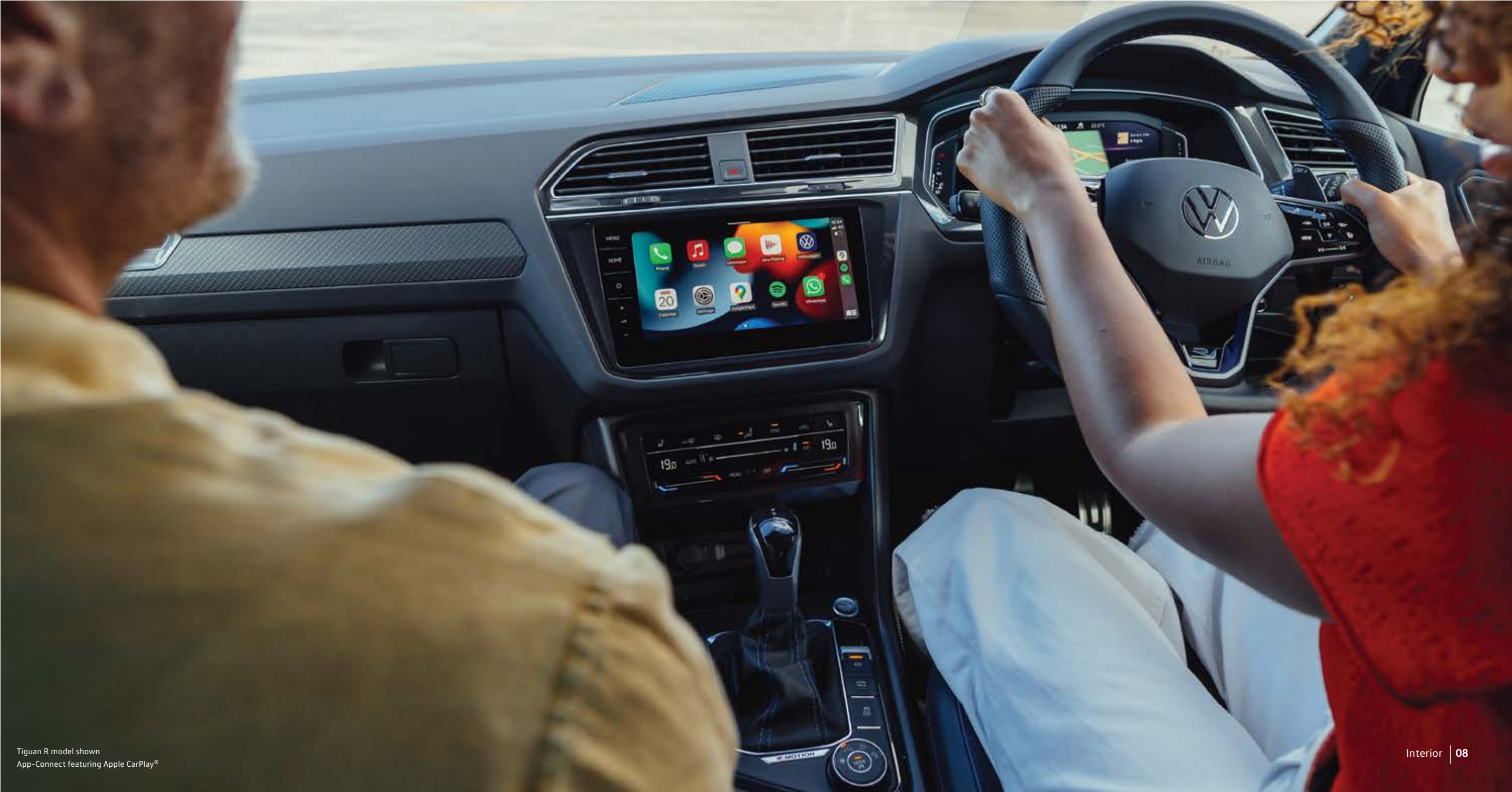
Tiguan R model shown App-Connect featuring Apple CarPlay®