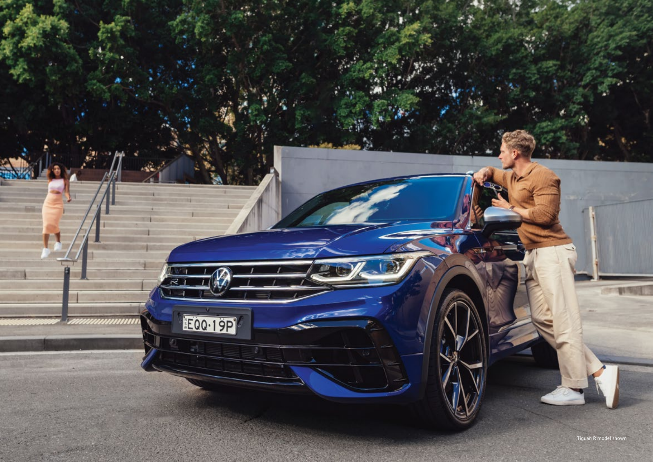
Tiguan R model shown