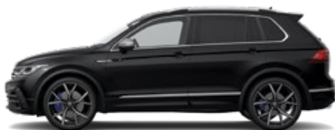
Deep Black Pearl Effect