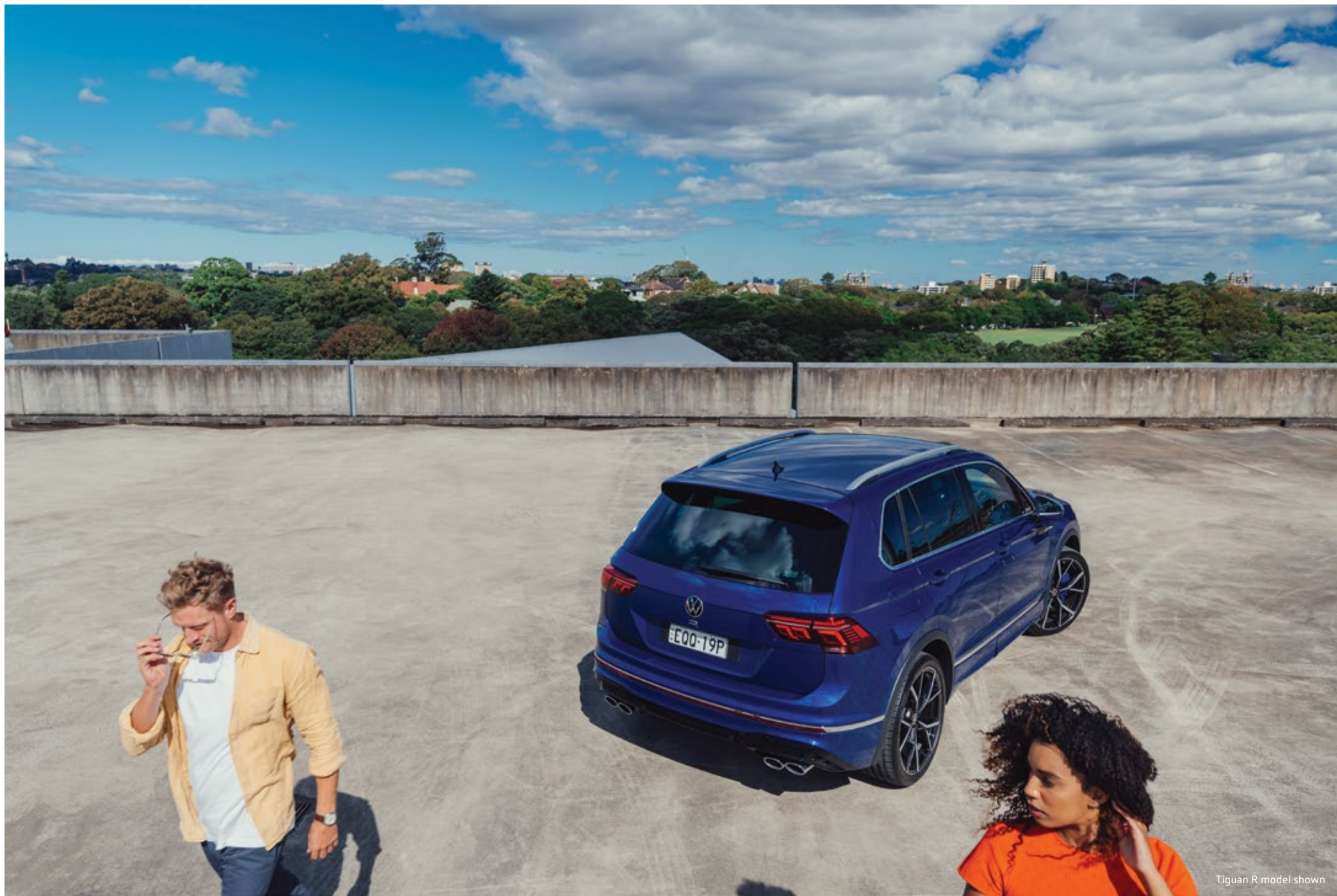
Tiguan R model shown