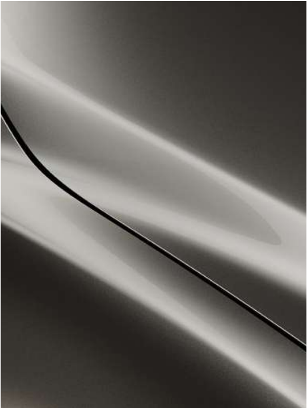
Titanium Flash Mica ■