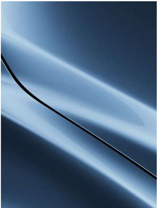
Eternal Blue Mica ■