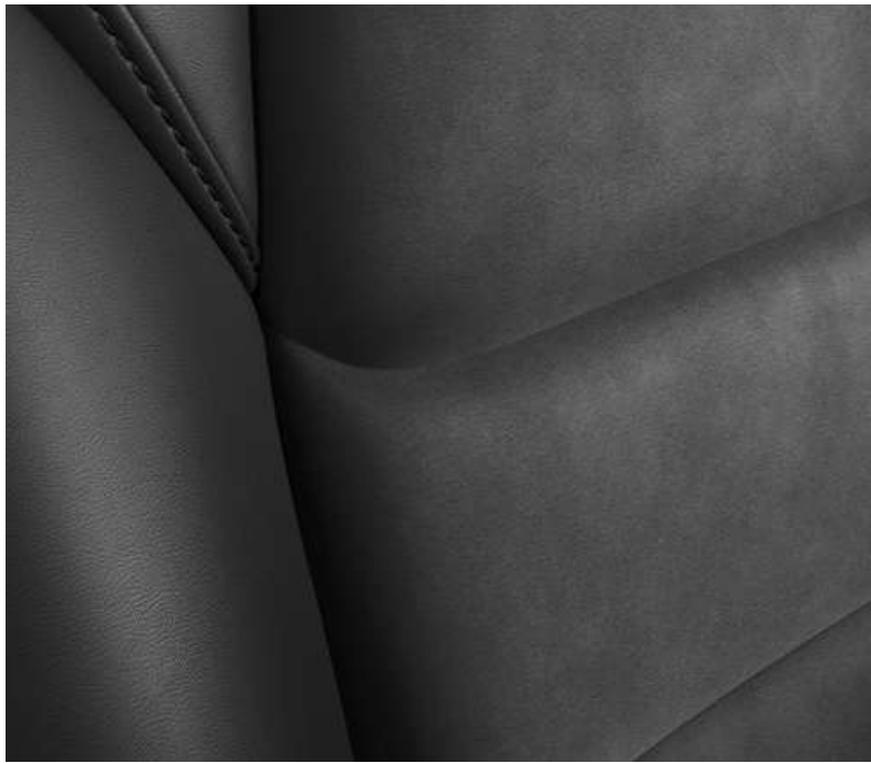
Black Maztex/black suede (Touring)