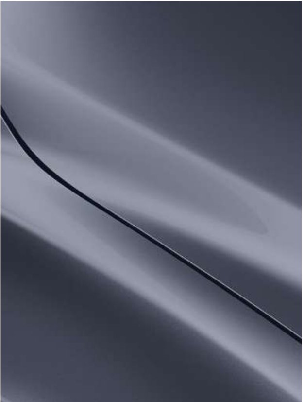
Polymetal Grey Metallic ^ ■