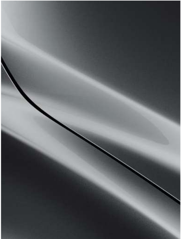
Machine Grey Metallic ^ ■