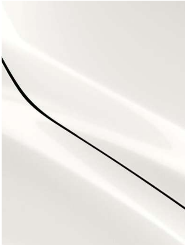
Snowflake White Pearl Mica