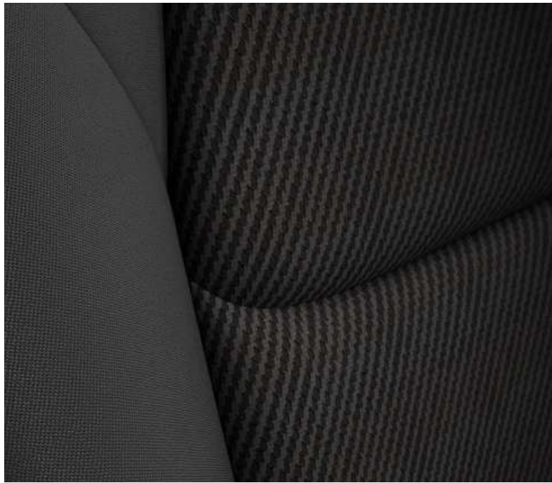
Black cloth (Maxx)