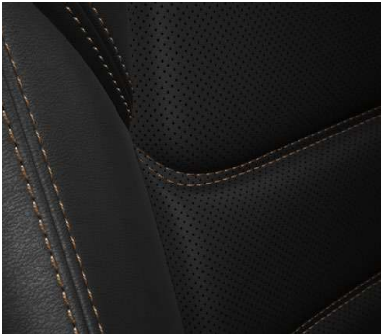
Black leather# (GT)