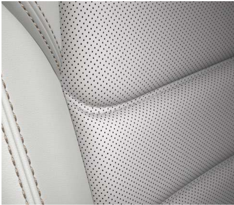
Pure white leather#● (GT)