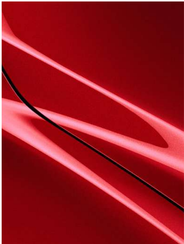
Soul Red Crystal Metallic ^ ■

Take your pick from the range of colours – all beautifully matched to the bold exterior lines of Mazda CX-5.