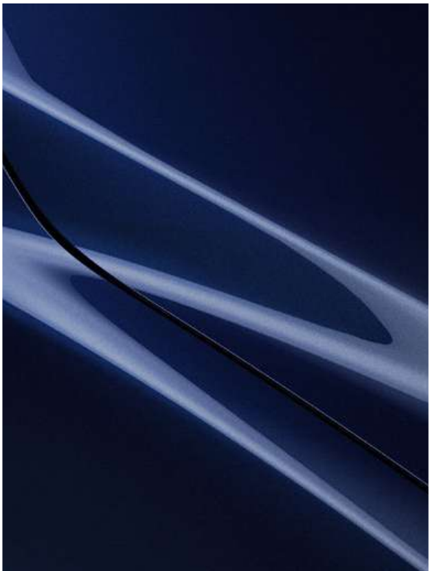
Deep Crystal Blue Mica ■