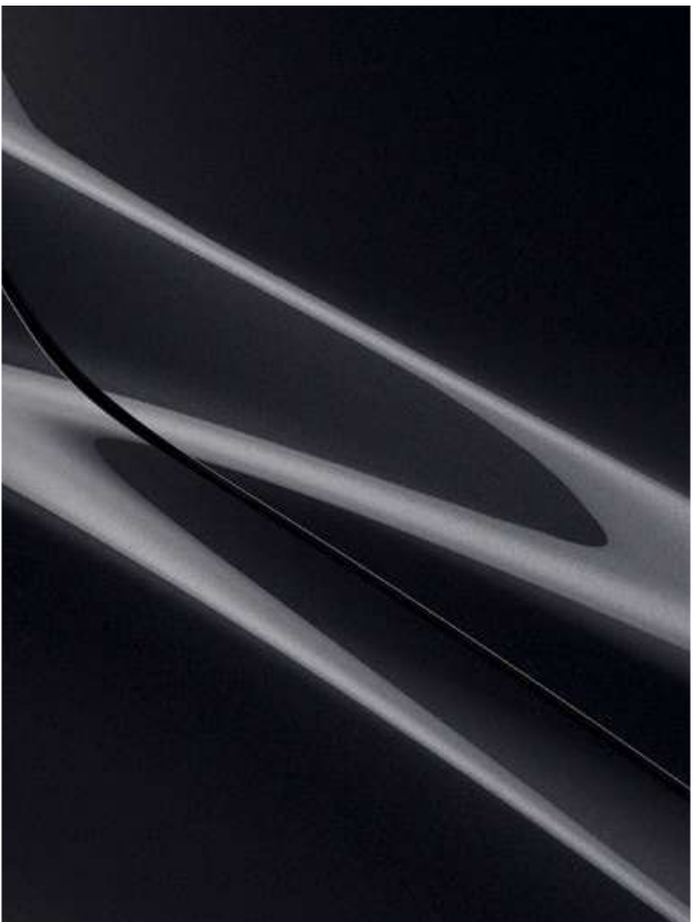
Jet Black Mica ■