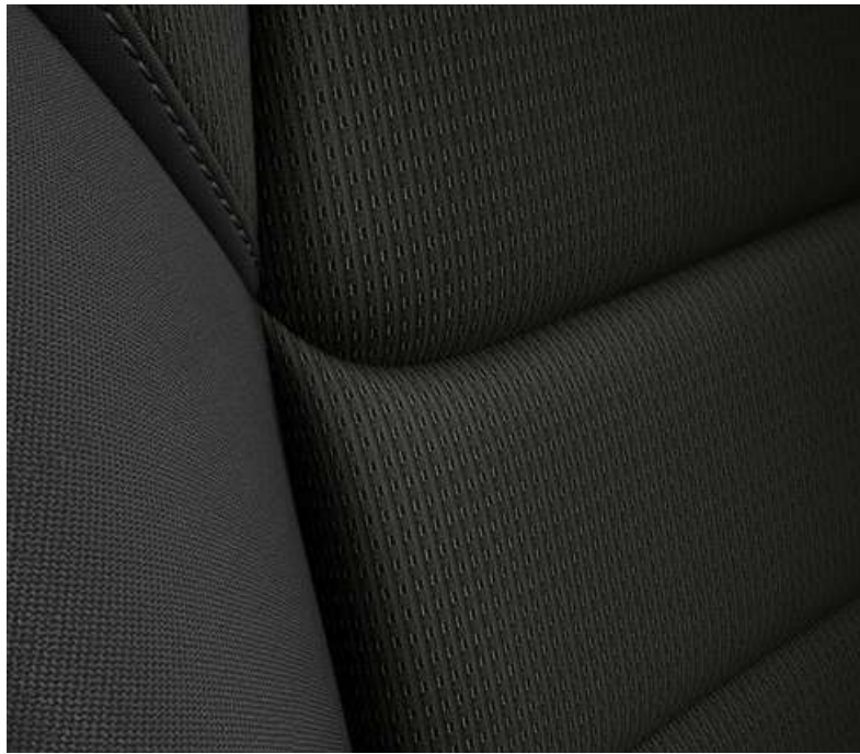
Black cloth (Maxx Sport)