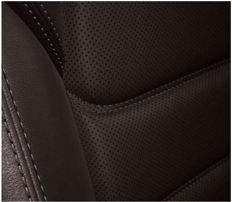
Dark russet nappa leather# (Akera)