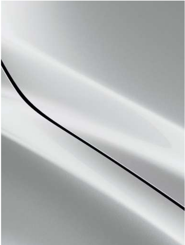
Sonic Silver Metallic