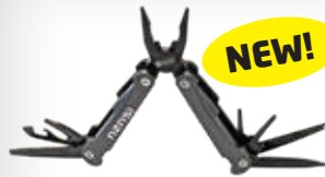
Isuzu Multi Tool