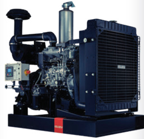
Model shown is 4BG1PWP10

Special pricing available upon request. Please contact your preferred Dealer for details.