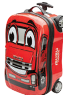
Kids Roller Luggage