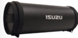
HiFi Bluetooth Speaker