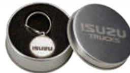
Iron Key Ring With Tin Holder