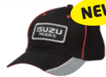
Isuzu Trucks Badge Cap