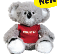
Isuzu Plush Koala