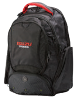
Premium Isuzu Trucks Backpack