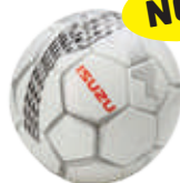
Mini Soccer Ball