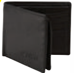
Premium Leather Wallet