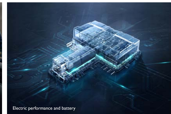
Electric performance and battery