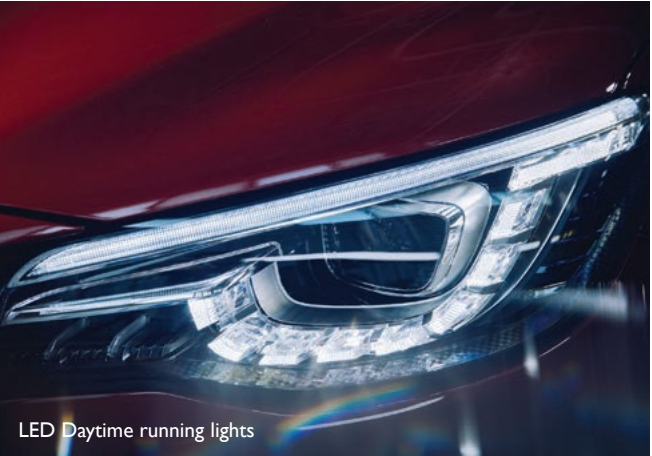
LED Daytime running lights