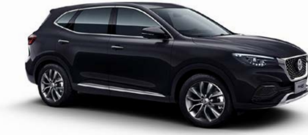
BLACK PEARL † METALLIC