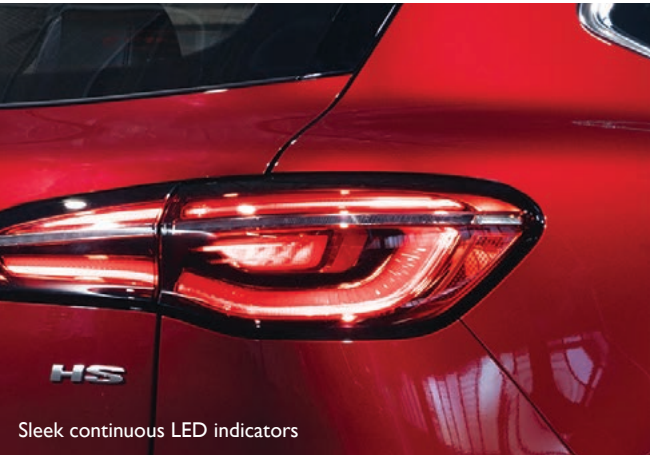
Sleek continuous LED indicators