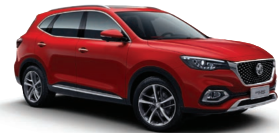
PHANTOM RED METALLIC