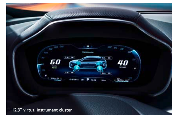
12.3" virtual instrument cluster