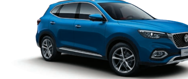
SURFING BLUE METALLIC