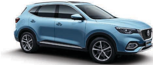
CLIPPER BLUE ‡ METALLIC