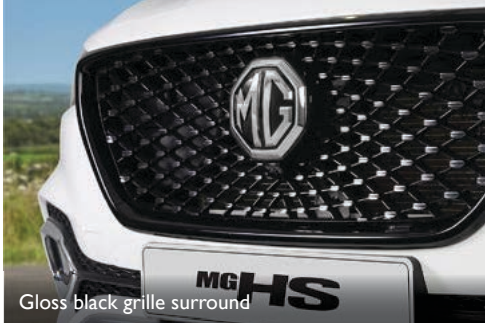
Gloss black grille surround