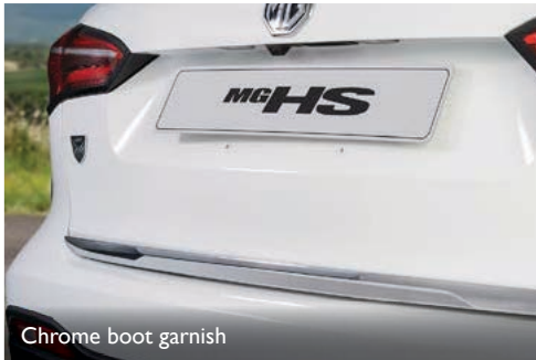
Chrome boot garnish