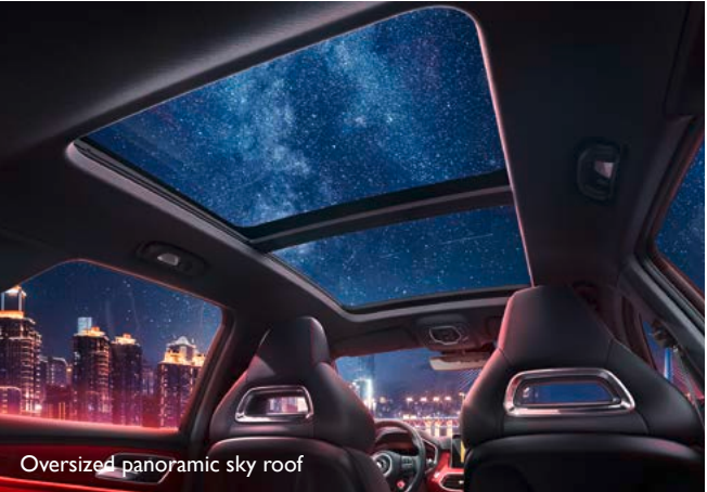
Oversized panoramic sky roof