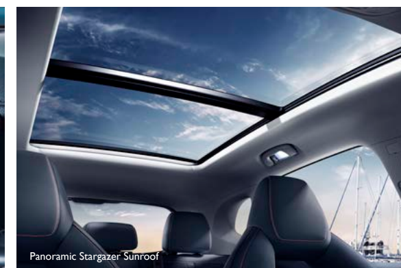
Panoramic Stargazer Sunroof