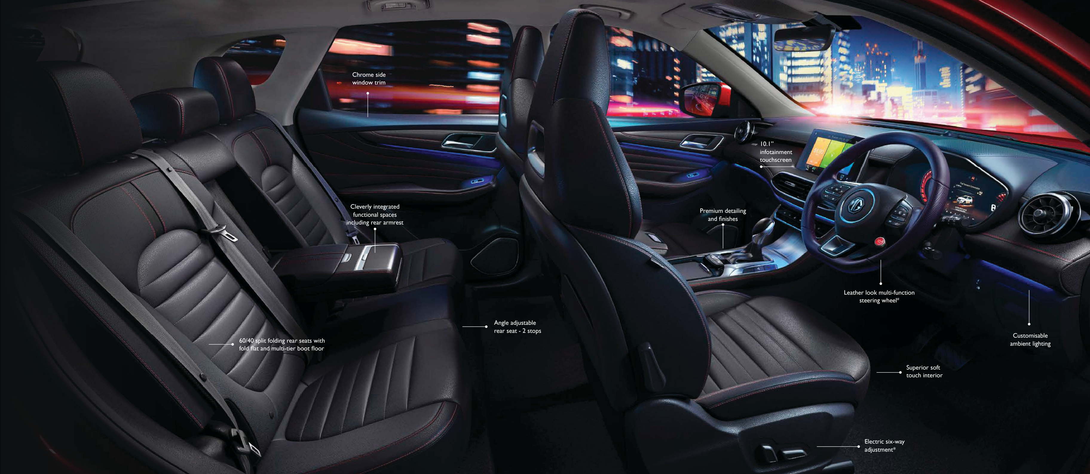
Chrome side window trim