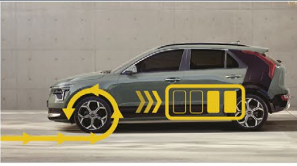
Smart Regenerative Braking