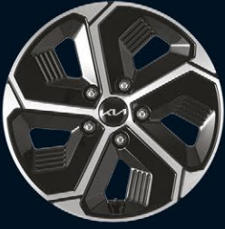
16" Alloy (HEV Base S)