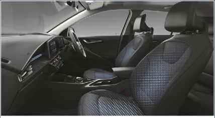
Heated & Ventilaled Seats (GT-Line)