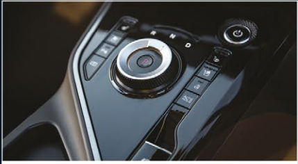
Shift-By-Wire Rotary Dial (HEV GT-Line & EV)