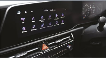
Dual 10.25" (Infotainment Touch + Driver Cluster) (HEV GT-Line, EV S & GT-Line)