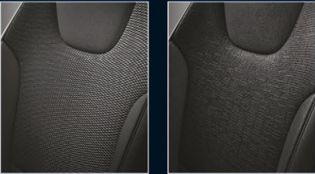
Charcoal - Partial Cloth & Artificial Leather (S)