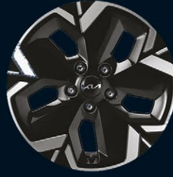
17" Alloy (EV Standard)