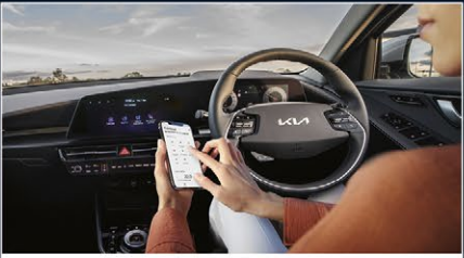
Kia Connect 17 (HEV GT-Line, EV S & GT-Line)