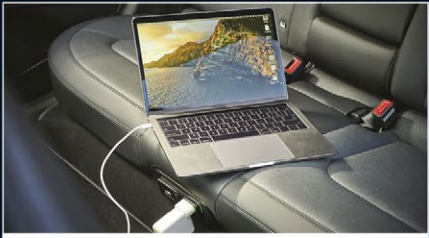
Vehicle to Load Interior Socket (EV Standard)