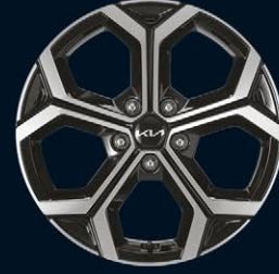
18" Alloy (HEV GT-Line)