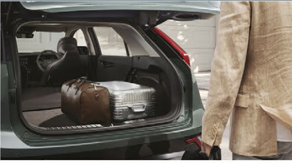
Hands-free Smart Power Tailgate (GT-Line)