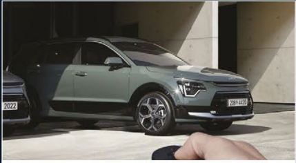
Remote Smart Park Assist (RSPA) WA (GT-Line)