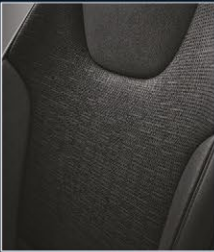
Charcoal - Artificial Leather (GT-Line)