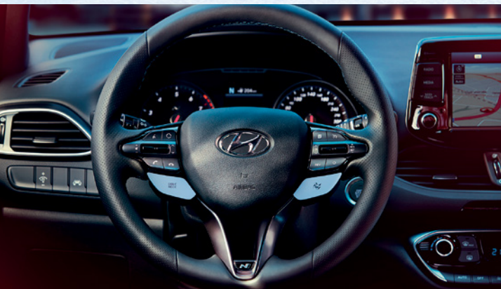
Steering wheel with dedicated N mode button