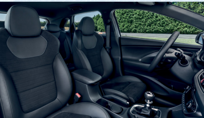
Sports front bucket seats (Luxury Pack shown)

• Active variable exhaust system: The twin-outlet active exhaust has three settings, allowing the driver to select the ideal level of exhaust sound for the conditions – keep it subdued around town, or allow the engine’s full vocal range to be enjoyed when the open road or track 1 beckons. In its most sporting setting, throttle lifts and downshifts bring a thrilling volley of rasping crackles and pops that have to be heard to be appreciated.