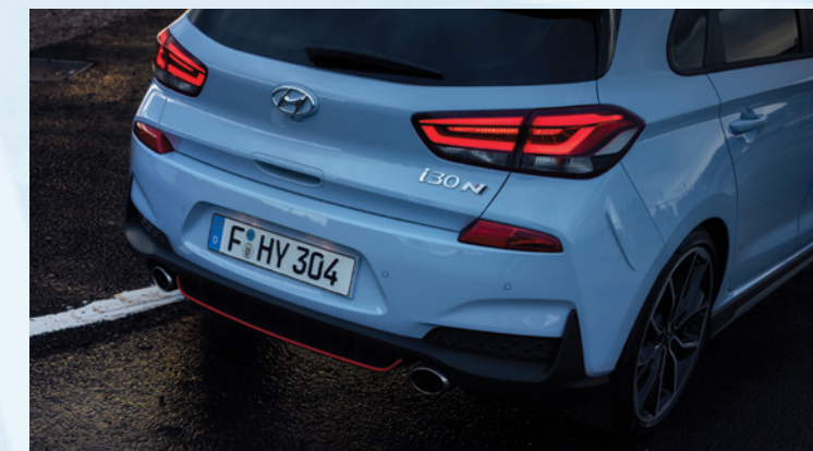
Active variable exhaust system & rear diffuser