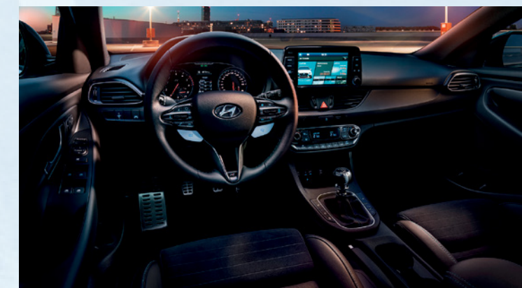
Exclusive ‘N’ interior