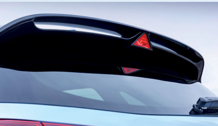
Dual-level rear spoiler