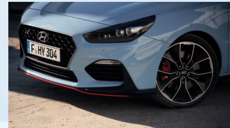
19" alloy wheels & high-performance brakes