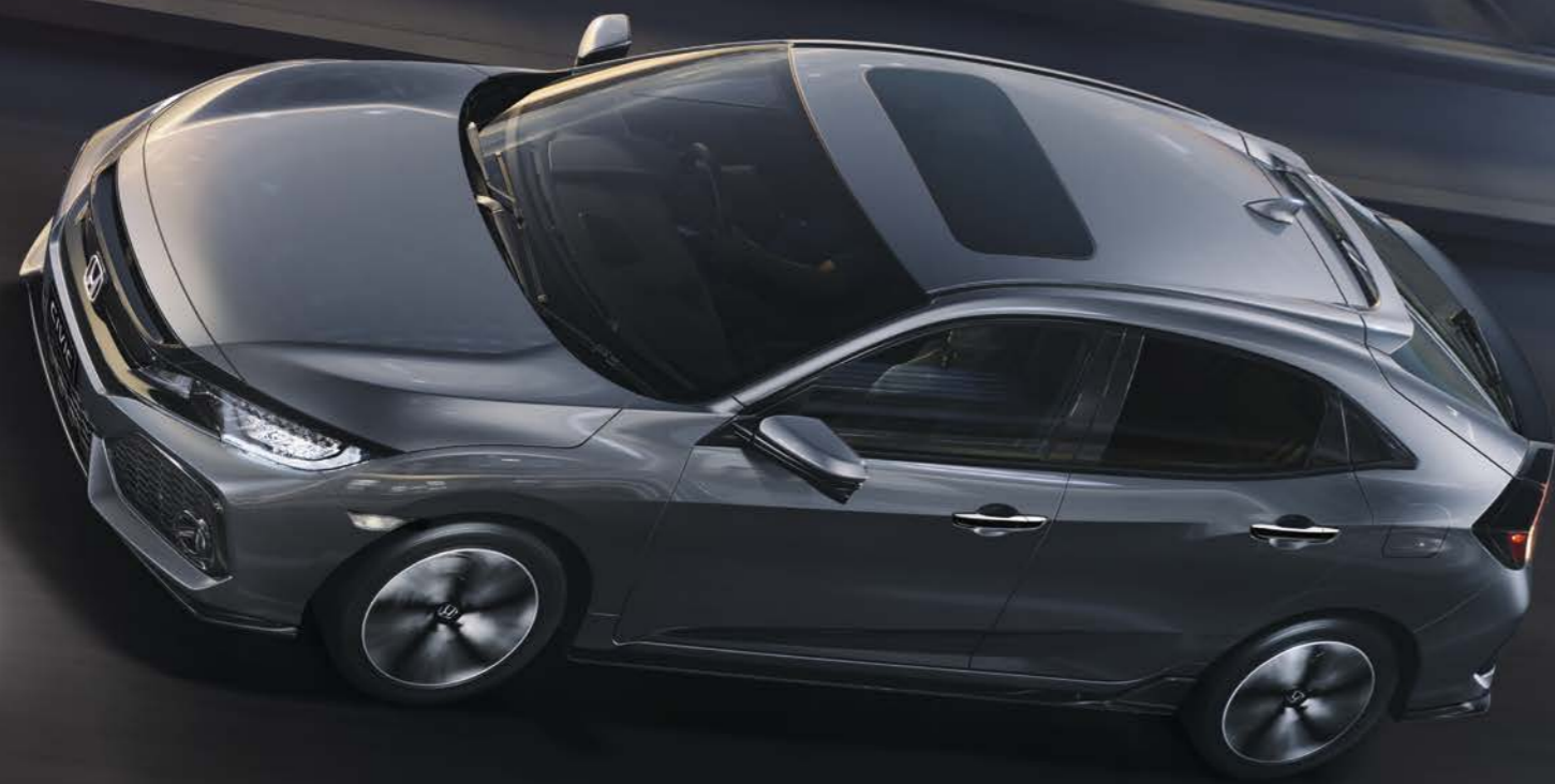
RS shown in Sonic Grey Pearlescent.