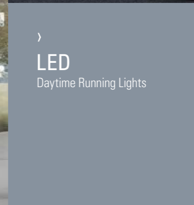
▶ LED Daytime Running Lights