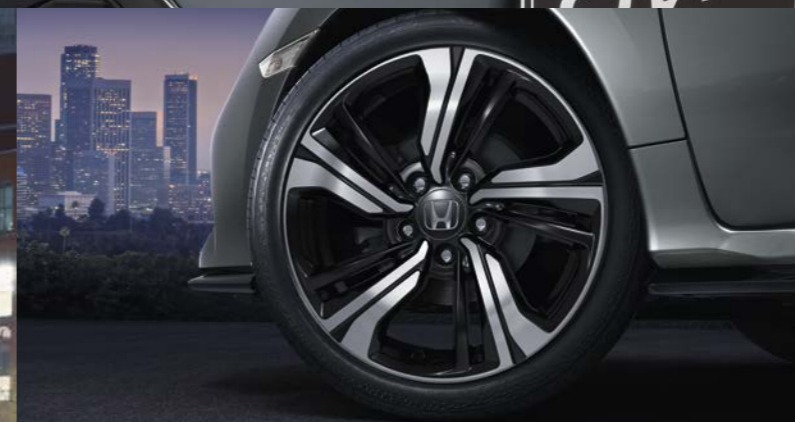
◀ 17" Alloy Wheels~