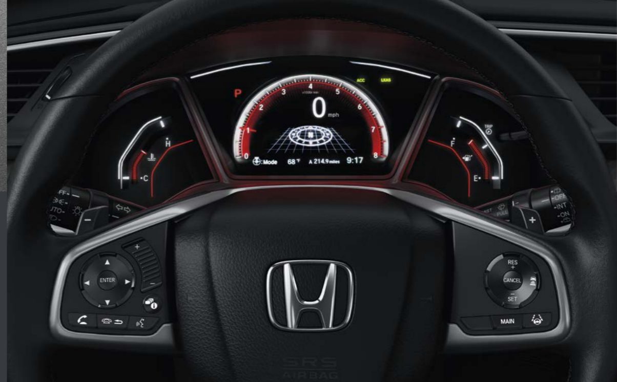
CVT Continuously Variable Transmission