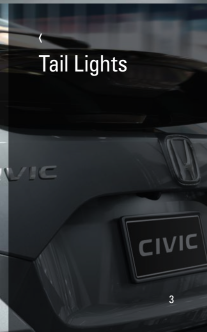
◀ Tail Lights