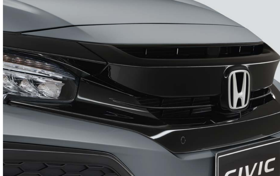
◀ Piano Black Grille

The Civic Hatch is designed to do just that. Up front, the sporty, angular piano black grille attracts the eye and makes a striking first impression. The 17-inch alloys* with gleaming flexed wheel arches cleverly create the illusion of motion whether moving or standing still. And then there are the stylish LED Daytime Running Lights. Hard to miss, they're a brilliant teaser of all the exciting features to come.