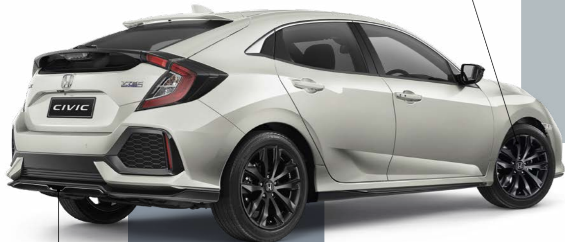
BLACK REAR UNDER SPOILER