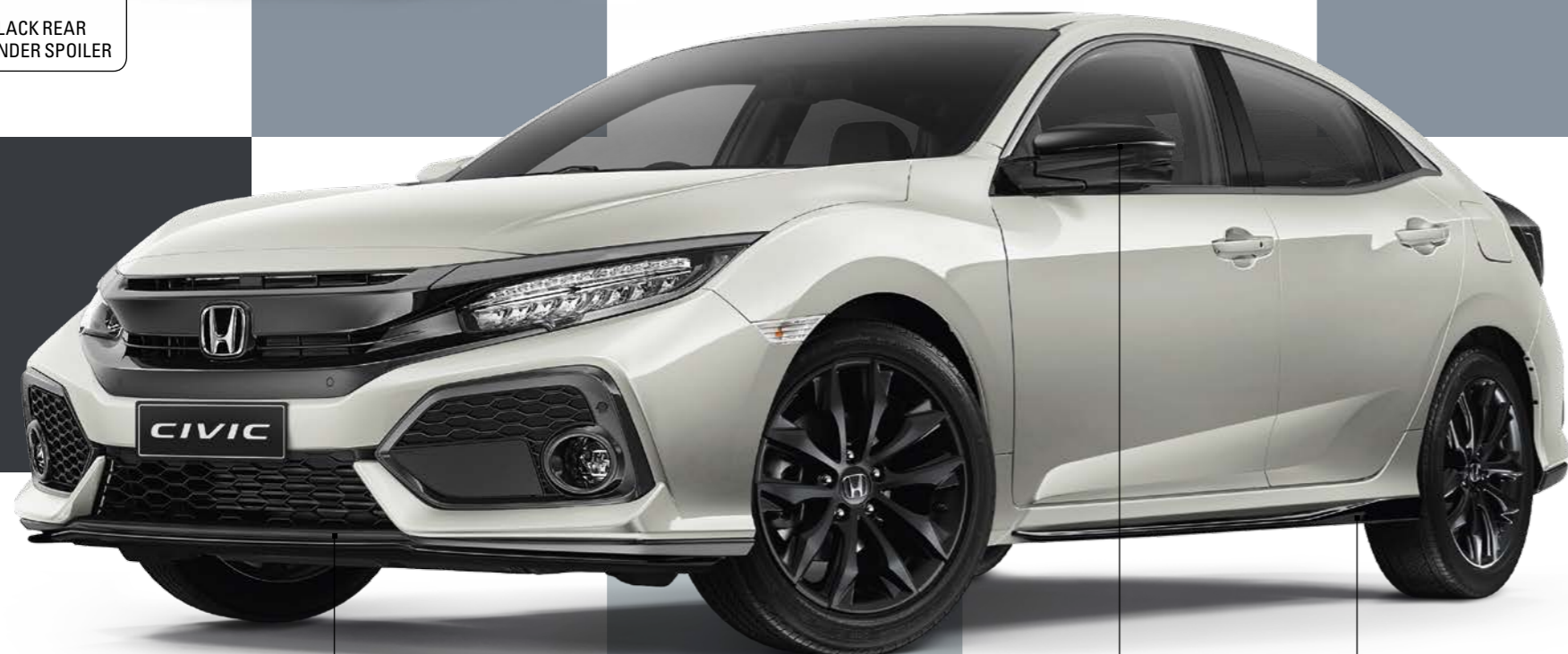
BLACK FRONT UNDER SPOILER