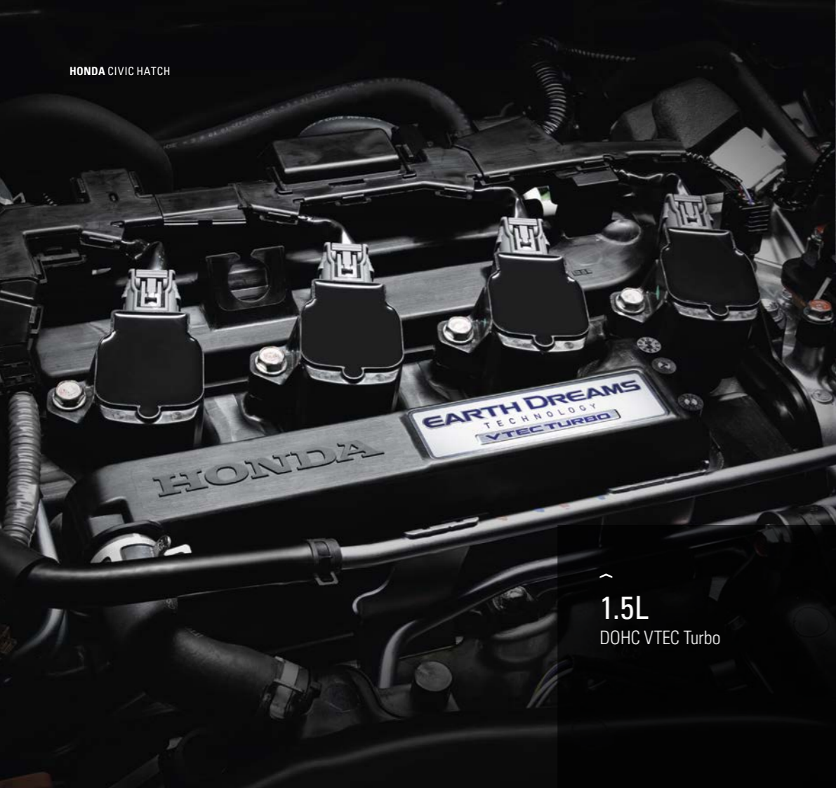
1.5L DOHC VTEC Turbo