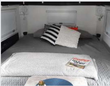
Queen sized main bed with no fold or slide out function required