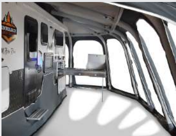
Add on an inflatable annex to create an extra living space

SOFT TOP HYBRID CARAVAN WITH QUEEN SIZED BED