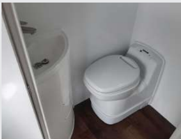
Freestanding Toilet & separate shower room in the ensuite