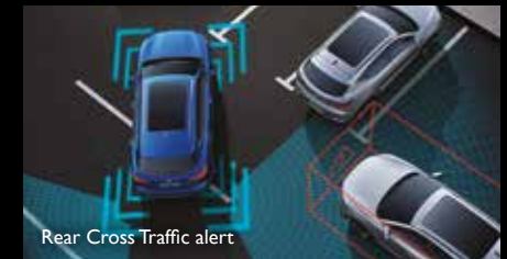
Rear Cross Traffic alert