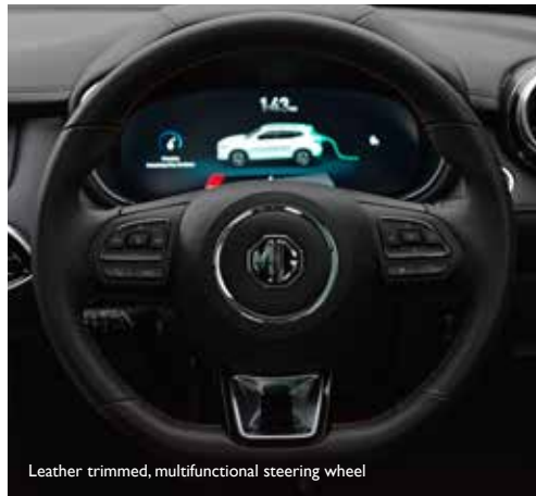
Leather trimmed, multifunctional steering wheel