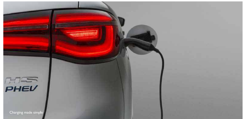
Charging made simple.