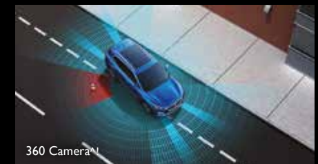
360 Camera ^1