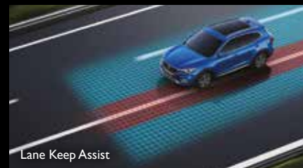
Lane Keep Assist