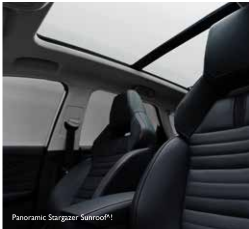
Panoramic Stargazer Sunroof ^!