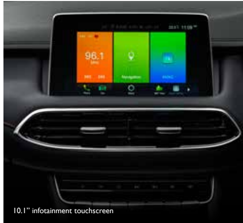
10.1" infotainment touchscreen