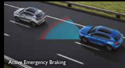
Active Emergency Braking

With its 10 Active Driver Safety features as standard, MG PILOT is constantly sensing your surroundings, on the lookout for unseen hazards. With the ability to react autonomously in situations where driver safety is at risk, take comfort that you and your family are backed by a new level in safety intelligence. With 6 SRS airbags, the MG HS Plug-in Hybrid offers a new standard in safety.