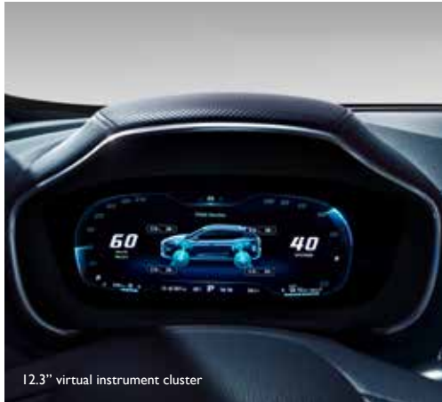
12.3" virtual instrument cluster