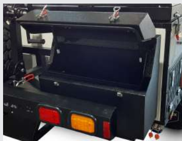
Rear Lockable Toolbox For Easy Tool Access.