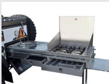
Luxury Cooking Facilities