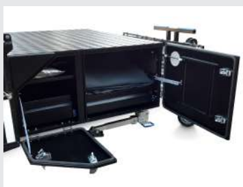
Plenty of Storage Options