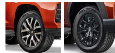
17" Alloys (Pro)