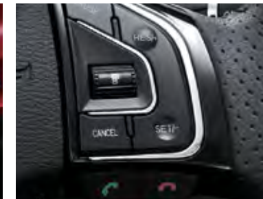
Easy access controls