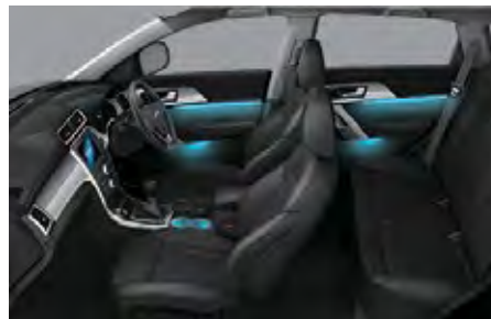
Ice blue mood lighting (standard on LUX model)

With delightful touches such as the subtle mood lighting, soft touch materials and even a curbside camera on the LUX model, the H2 is designed with care.