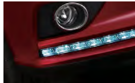
Daytime running lights