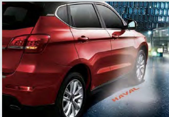
HAVAL laser puddle lights (LUX model)