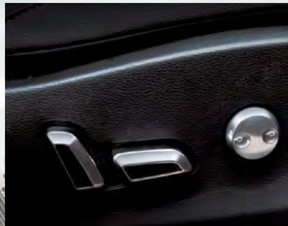
Six-way electric adjustable drivers seat (LUX model)