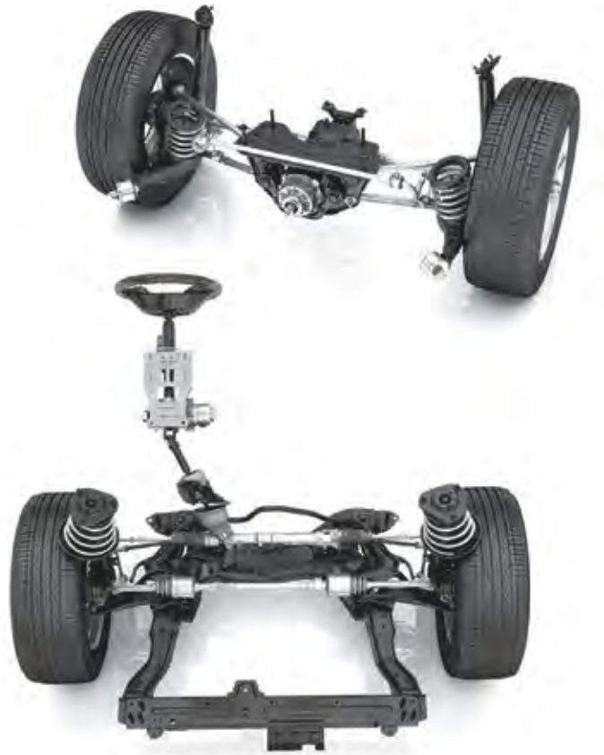
Front MacPherson + Rear Multi-Link Independent Suspension.

The HAVAL H2 offers sophisticated SUV suspension providing outstanding manoeuvrability, handling and comfort in all conditions. It's designed to be just as at home in the urban jungle as it is exploring off the beaten track.