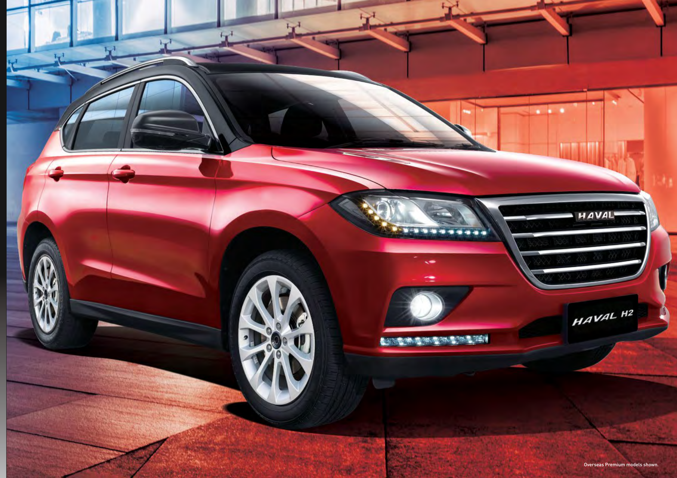
Ultimate 7-seater family adventure 4WD