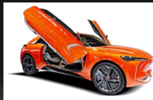
HAVAL concept vehicle