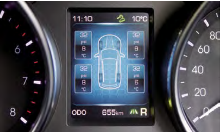
Tyre Pressure Monitoring System (TPMS)