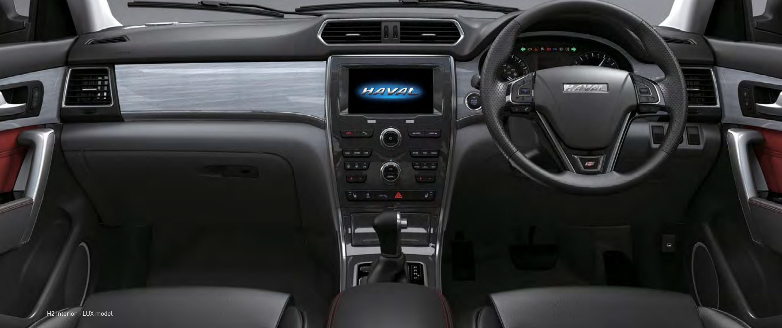
H2 Interior - LUX model