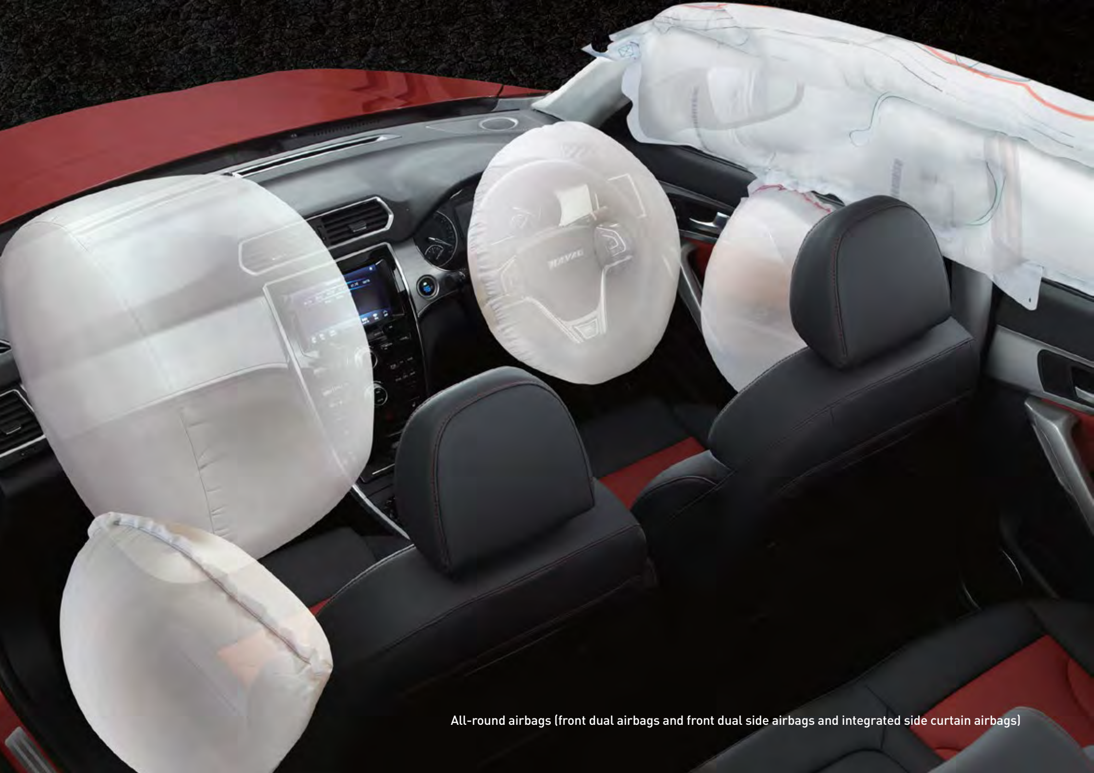
All-round airbags (front dual airbags and front dual side airbags and integrated side curtain airbags)