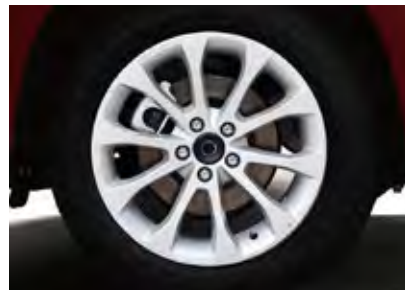
18" 10-spoke alloy wheels