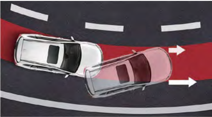
Electronic Stability Program (ESP)