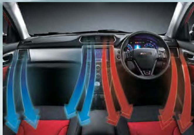
Automatic dual-zone climate control air-conditioning (LUX model)