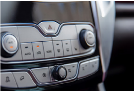
^ Overseas model shown. Specifications may vary.