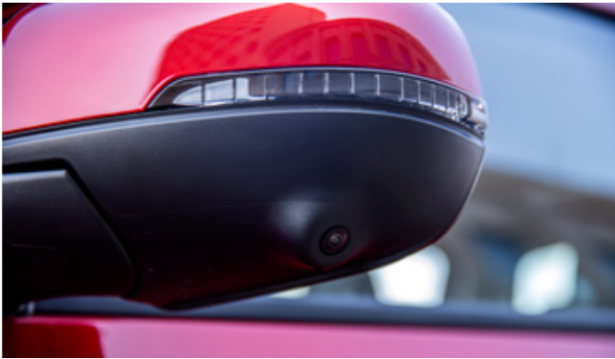
▲ Curbside camera

The GWM Ute was born to tackle the toughest jobs but it was also built smart with a full suite of comprehensive safety systems designed to protect occupants and other road users.