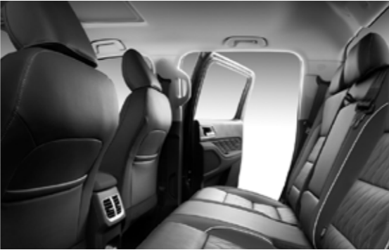
▲ Rear seats^