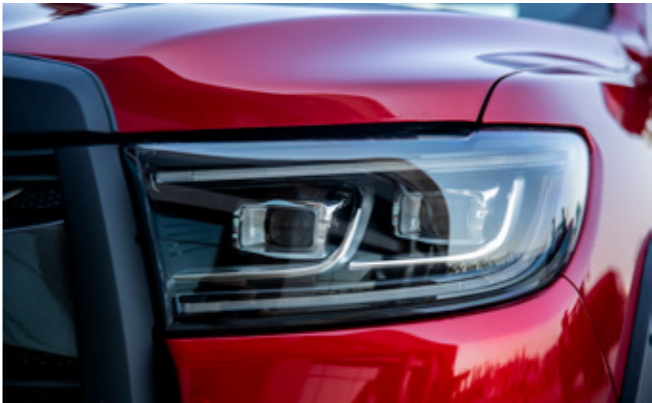
▲ LED headlights with daytime running lights