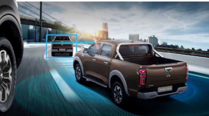
▲ 360 view camera, FCW+AEB, Lane Change Assist & Lane Departure Warning^