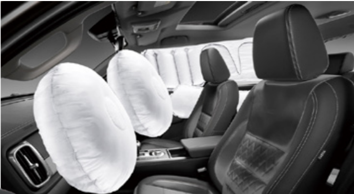
▲ Front, side, centre and curtain airbags ^