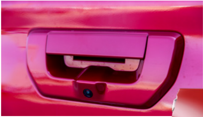
▲ Reversing camera