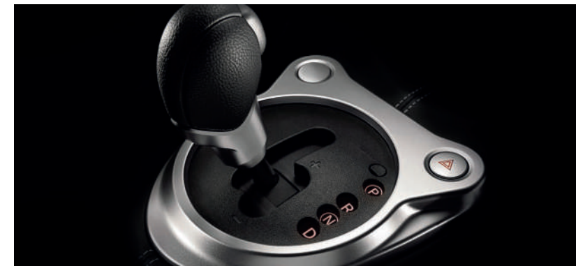
OPTIONAL AUTOMATIC TRANSMISSION