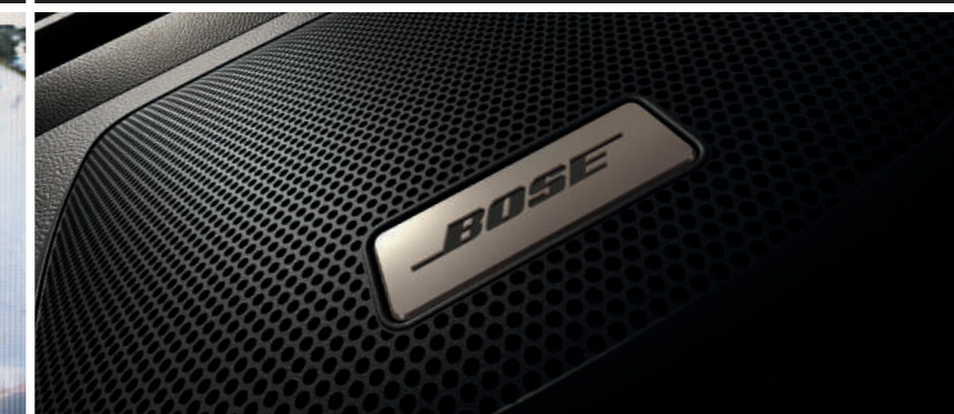
8 SPEAKER BOSE® AUDIO SYSTEM INCLUDING 2 SUBWOOFERS