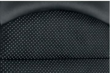
Coupe seat trim: Sports black leather accented^ trim with non-slip cloth insert.

Minor trim variations may occur from time to time. ^Leather accented features and upholstery may contain synthetic material.