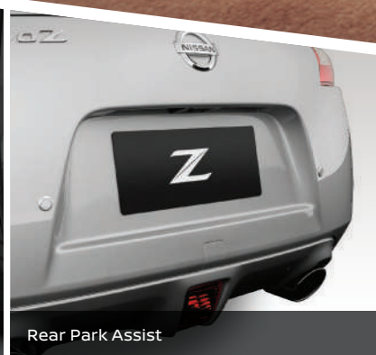
Rear Park Assist