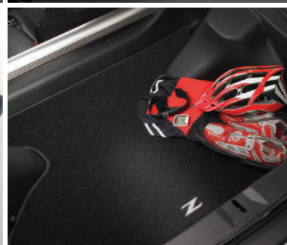
Rear Protection Carpet Mat