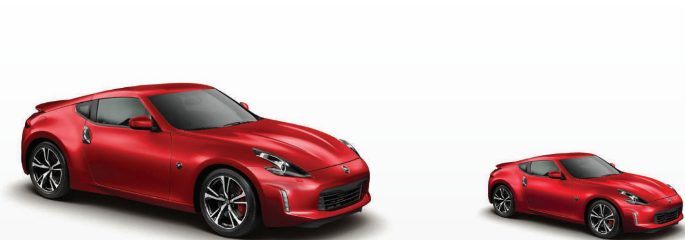
Eau Rouge Red