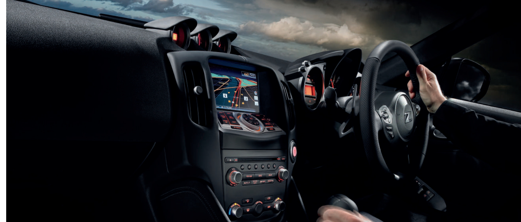
NISSAN 370Z INTERIOR

^ Leather accented features and upholstery may contain synthetic material. *iPod is a registered trademark of Apple Inc.