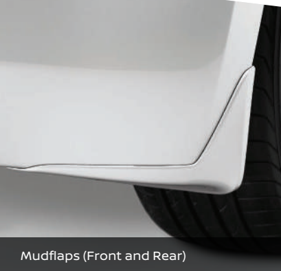
Mudflaps (Front and Rear)