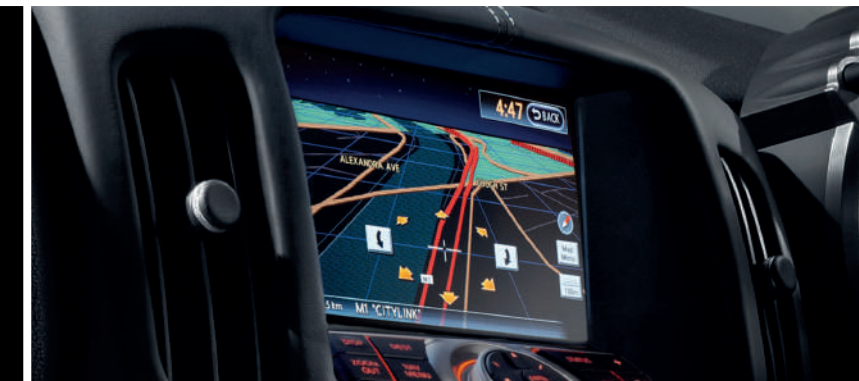
HDD SATELLITE NAVIGATION WITH 3D MAPPING