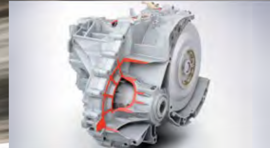
Getrag 6DCT (Dual clutch transmission)