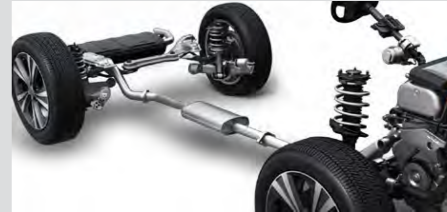
Independent front and rear suspension

With European engineering inspiration it's no surprise the Haval H6 drives and handles so well. Independent MacPherson strut suspension at the front combined with a double wishbone independent rear, sports steering and tuned exhaust makes the H6 a true driver's SUV.