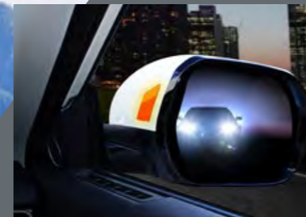
Blind Spot Monitoring