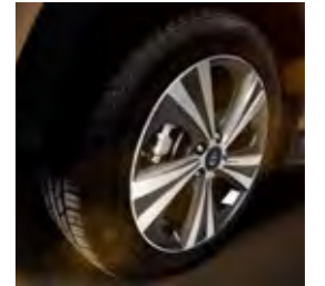
19" Alloy wheels (LUX)