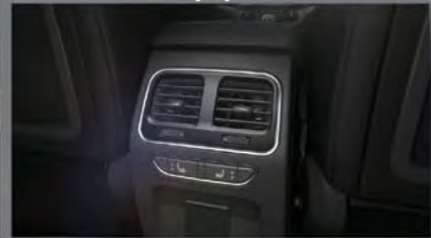
Rear air conditioning ducts and in the LUX heated rear seats