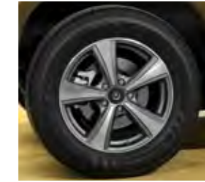
17" Alloy wheels (Premium)