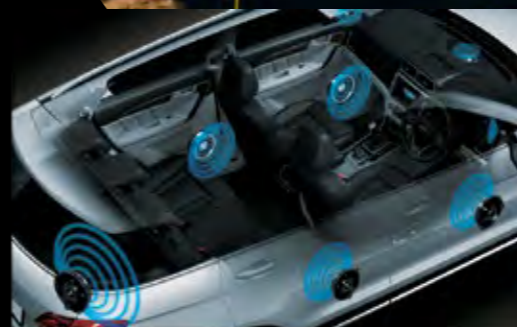
Hi-fi surround sound LUX model