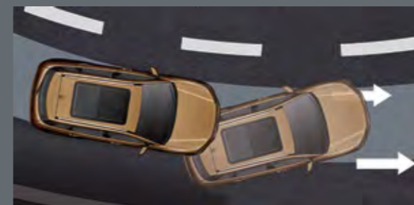
ESP (Electronic Stability Program)