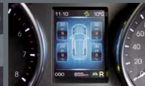
TPMS (Tyre Pressure Monitoring System)