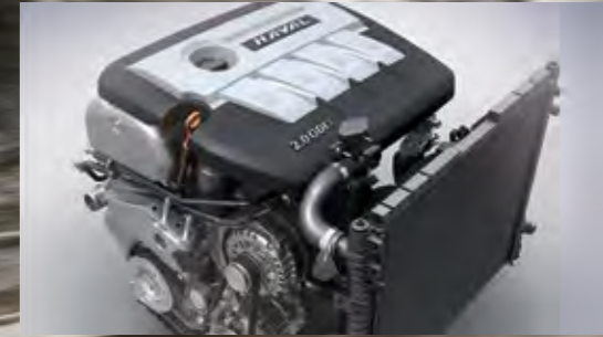
Powerful 145kW turbo-charged 2.0-litre direct injection engine

The Haval H6 matches the performance of a powerful turbo-charged 2.0-litre direct injection engine with a Getrag six-speed dual clutch transmission (DCT). The DCT combines all the advantages of manual and automatic transmissions to deliver fast, smooth gear changes with maximum efficiency. When the mood takes you, select sport mode and use the paddle shifters to give you even more control and fun.