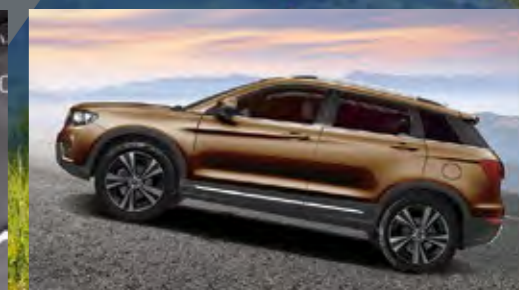
HAC (Hill-Start Assist Control)