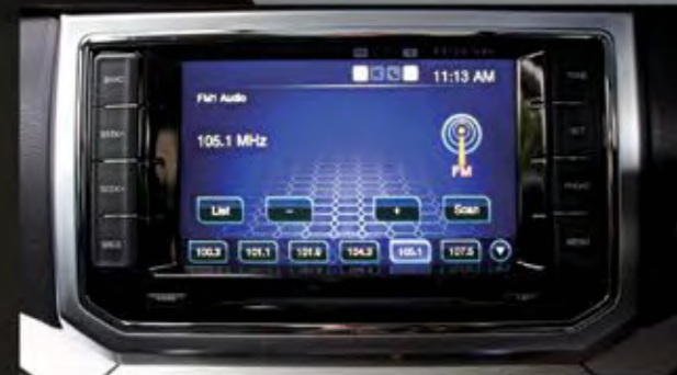
8-inch touch screen

Every drive in the Haval H6 is special. Soft-touch textures, seating that provides comfort and support for all occupants, and a multimedia system are all designed to make every drive a special event. The LUX model features a stunning opening panoramic moon-roof and an electric sunshade that keeps you in touch with nature, while protecting you from any harmful elements. Colour selectable mood lighting (red, green, orange, blue, yellow and pink) allows you to change the environment to suit your individual taste.