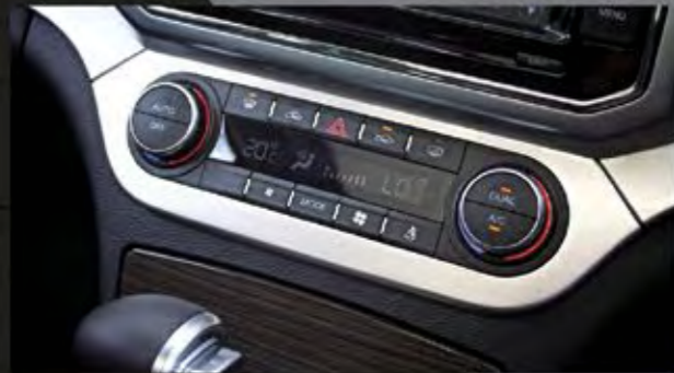
Dual-zone climate control (LUX Model)