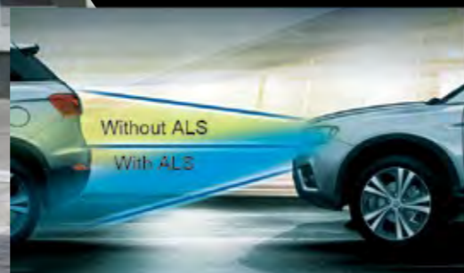
Automatic self-leveling headlight system (ALS) LUX model