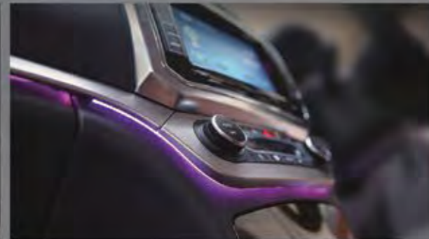
Selectable mood lighting