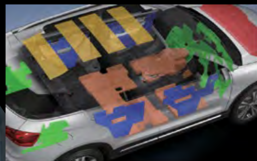
Extensive acoustic insulation