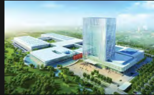
HAVAL research and development centre