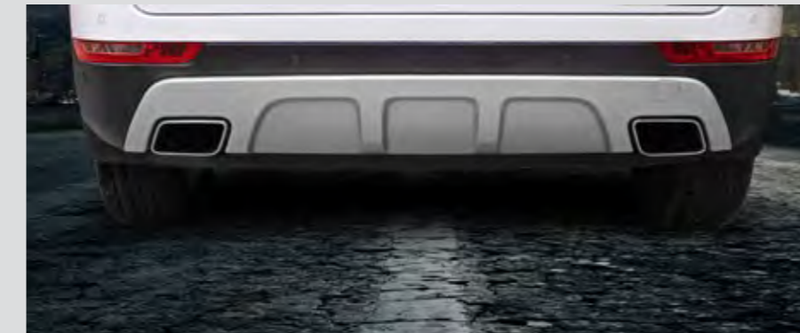
Exhaust tuned acoustics