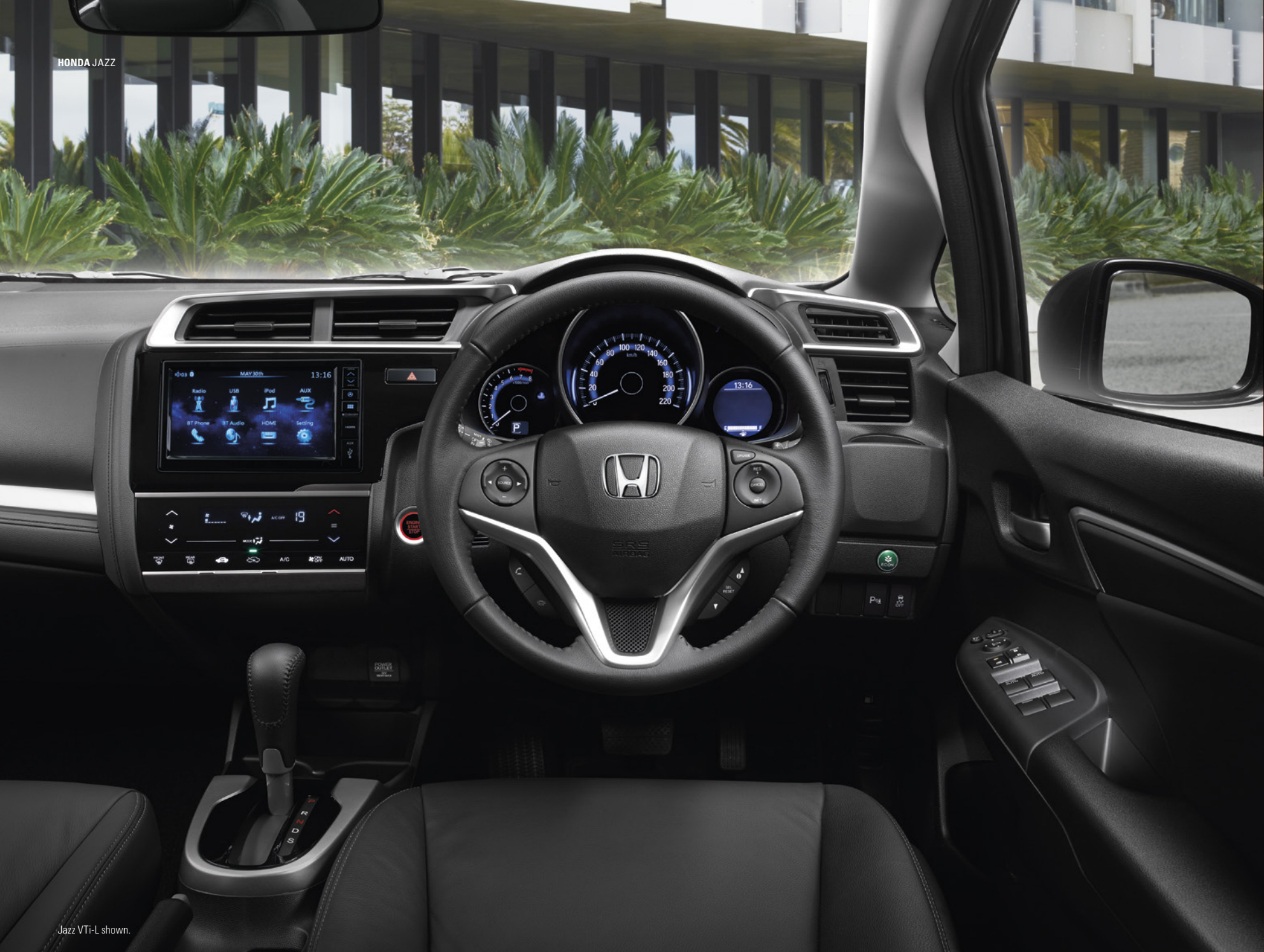
Jazz VTi-L shown.