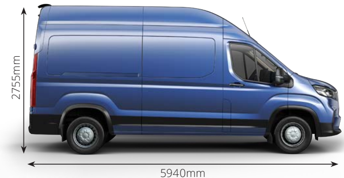
LONG WHEEL BASE / HIGH ROOF (LWB / HR)

12.33 m 3 of Cargo / Payload (kg)*: Man 1640/Auto 1620