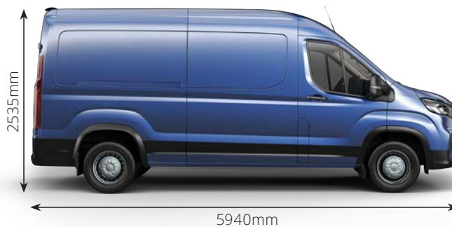
LONG WHEEL BASE / MID ROOF (LWB/MR)

10.97 m 3 of Cargo / Payload (kg)*: Man 1670/Auto 1640