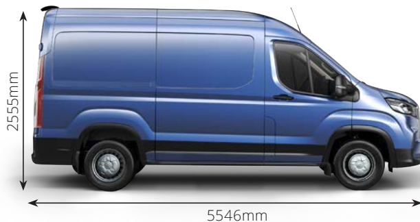
MID WHEEL BASE (MWB)

9.66 m 3 of Cargo / Payload (kg)*: Auto 1500