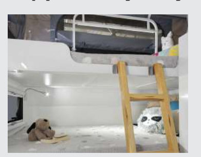
Twin bunks up the front make sleeping the little ones easy