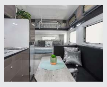
Neat layout which makes use of every space for seating or storage