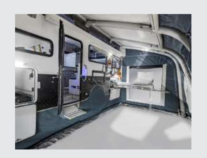
Add on an inflatable annex to create an extra living space

SOFT TOP HYBRID CARAVAN WITH SLIDE OUT BED 8 DUAL BUNK BEDS