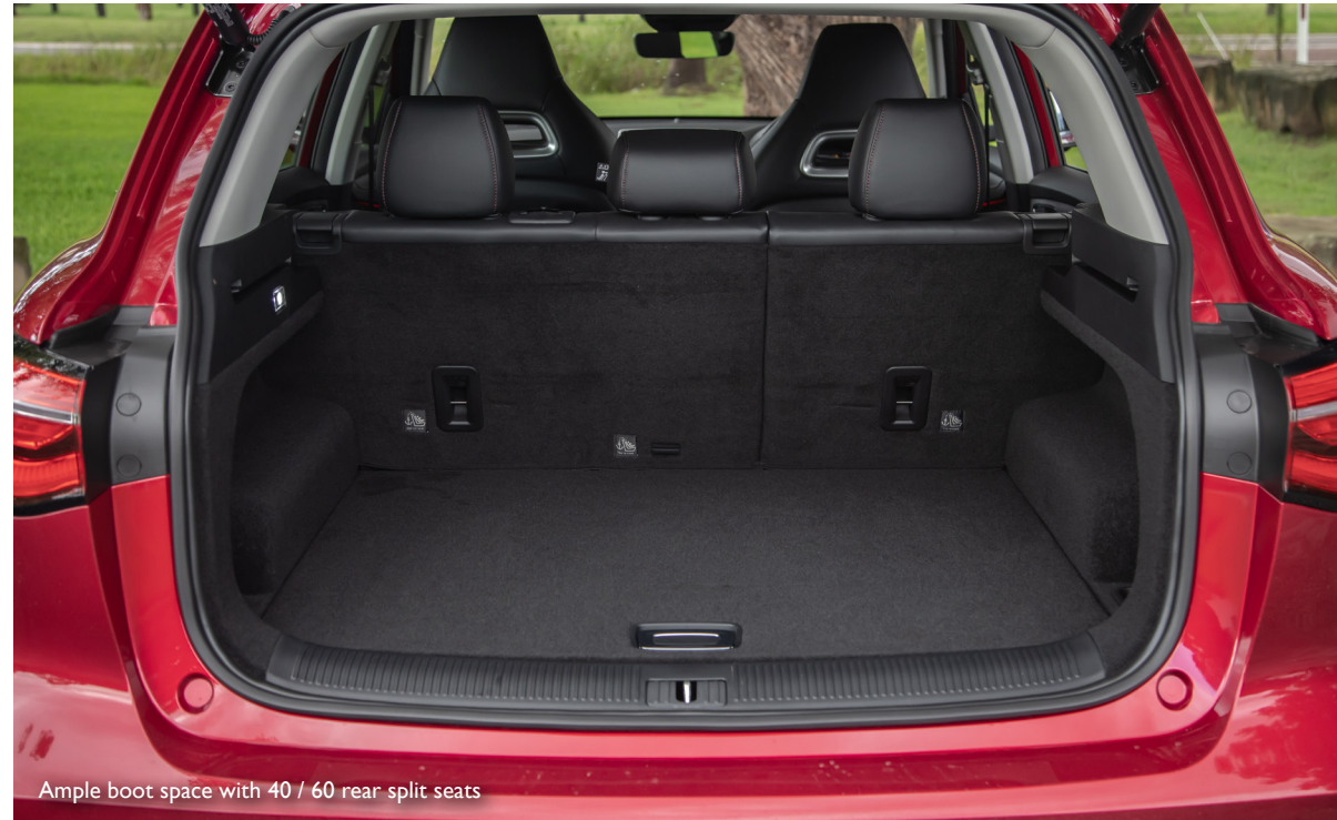
Ample boot space with 40 / 60 rear split seats

The powerful 2.0L Turbo engine is ideal for reactive driving in urban environments as well as navigating those longer rural road trips. In addition, the premium Michelin tyres are also adaptive to both city and country terrain, ensuring uncompromised performance on and off the beaten track.