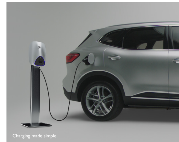
Charging made simple