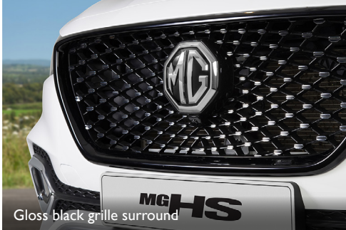
Gloss black grille surround