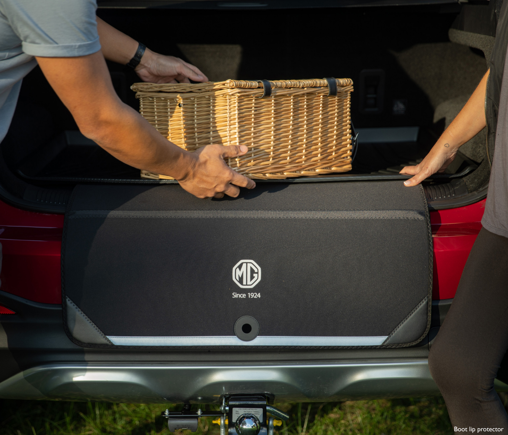
Boot lip protector