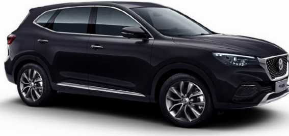
BLACK PEARL ‡ METALLIC