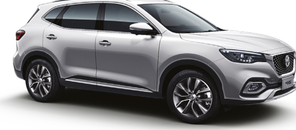
STERLING SILVER METALLIC