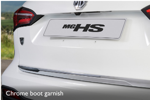
Chrome boot garnish