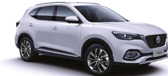
NEW PEARL WHITE METALLIC

Brighten your drive with our range of expressive MG HS colours. Choose from our considered selection of bespoke shades in both metallic and non-metallic options