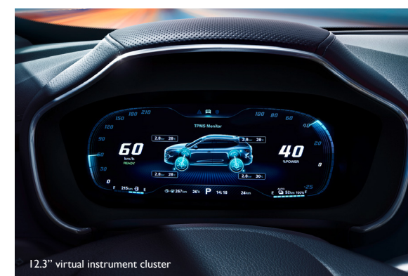
12.3" virtual instrument cluster