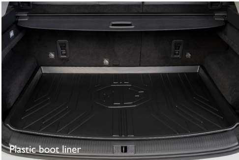
Plastic boot liner