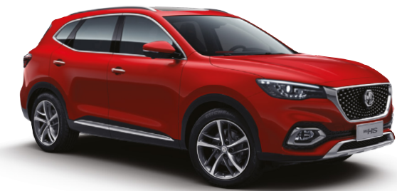
PHANTOM RED METALLIC