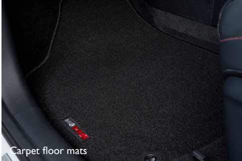
Carpet floor mats