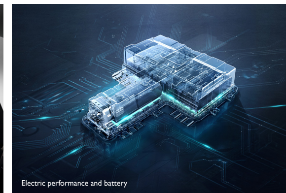
Electric performance and battery