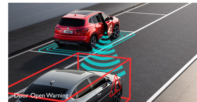
Door Open Warning