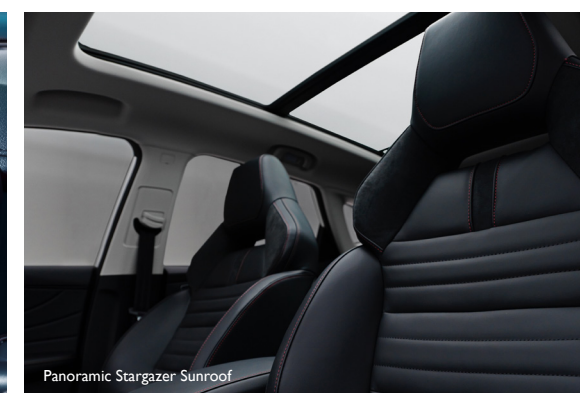
Panoramic Stargazer Sunroof

*Range figures are determined by testing under standardised laboratory conditions to comply with ADR 81 / 02. These figures should only be used for the purpose of comparison amongst vehicles. Actual figures will generally differ under real world driving conditions and will vary depending on factors including (but not limited to) driving style, vehicle's equipment and road, traffic and weather conditions. Provisional data at time of going to print. ^ Charging times can vary depending on many factors including but not limited to environmental conditions, auxiliary consumables (e.g. seat heating and air-conditioning) and capabilities of charging infrastructure capacity and/or supply ~Figures according to ADR 81/02 derived from laboratory testing. Factors including but not limited to driving style, road and traffic conditions, environmental influences, vehicle condition and accessories fitted, will in practice in the real world lead to figures which generally differ from those advertised. Advertised figures are meant for comparison amongst vehicles only. Actual Australian specification may vary from vehicle shown.