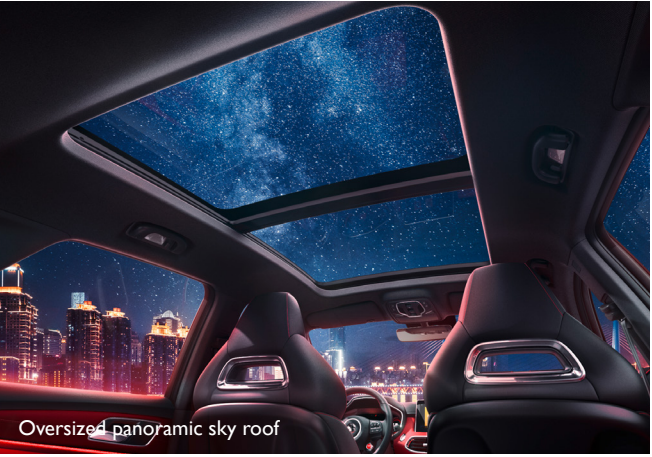
Oversized panoramic sky roof