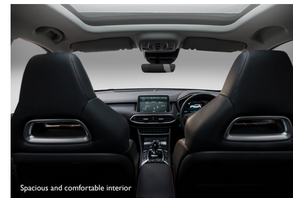
Spacious and comfortable interior