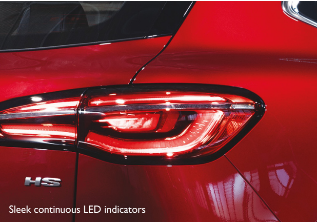
Sleek continuous LED indicators