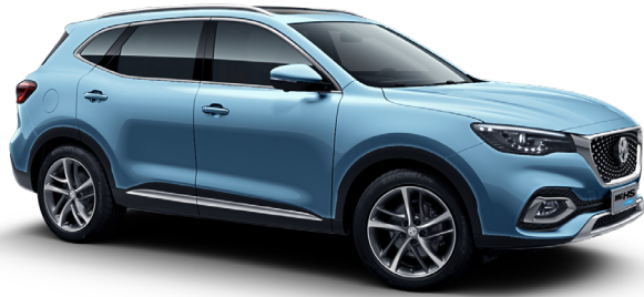
CLIPPER BLUE † METALLIC