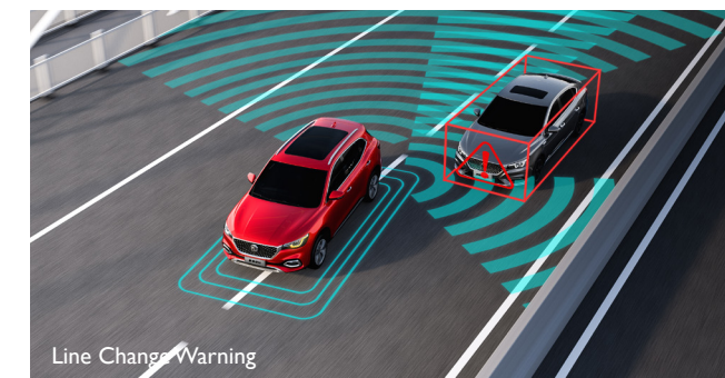
Line Change Warning