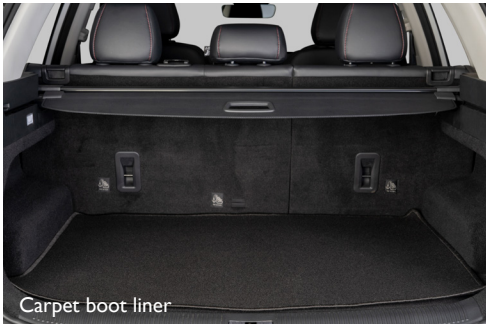
Carpet boot liner