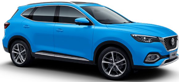
BRIXTON BLUE METALLIC