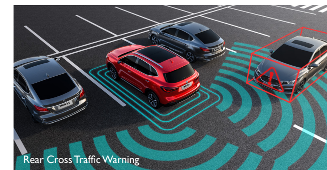
Rear Cross Traffic Warning