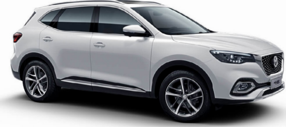
YORK WHITE NON METALLIC