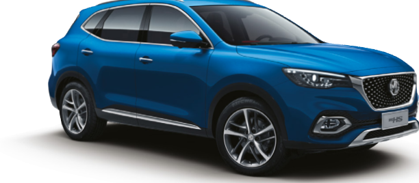
SURFING BLUE METALLIC