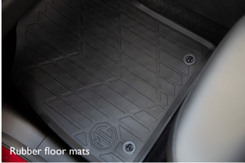
Rubber floor mats