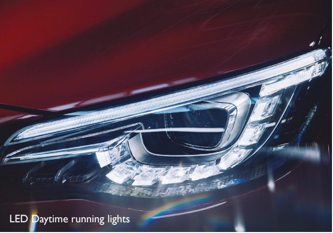
LED Daytime running lights