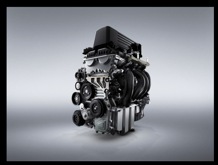
82kW 1.5L NSE Major