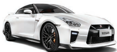
Ivory Pearl (QAB)*