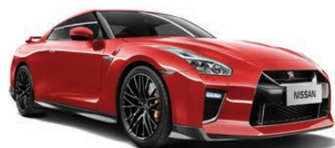
Vibrant Red (A54)