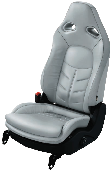
Urban Grey Semi-aniline leather accented#~