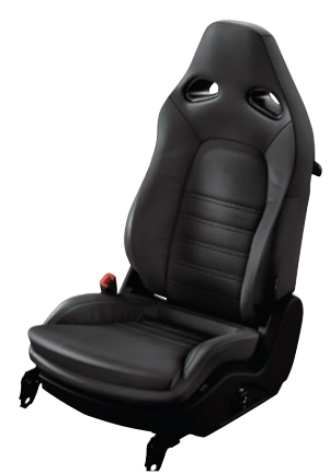
Black leather accented# / Suede inserts