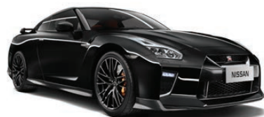
Jet Black (GAG)*