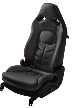
Samurai Black Semi-aniline leather accented#~