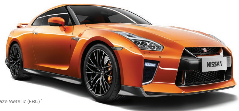
Blaze Metallic (EBG) *