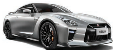
Super Silver (KAB)**