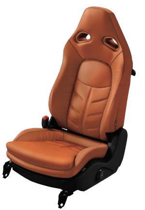
Tan Semi-aniline leather accented#~