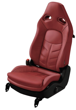
Amber Red Semi-aniline leather accented#~