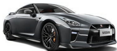
Gun Metallic (KAD)*