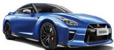
Bayside Blue (RCB)*