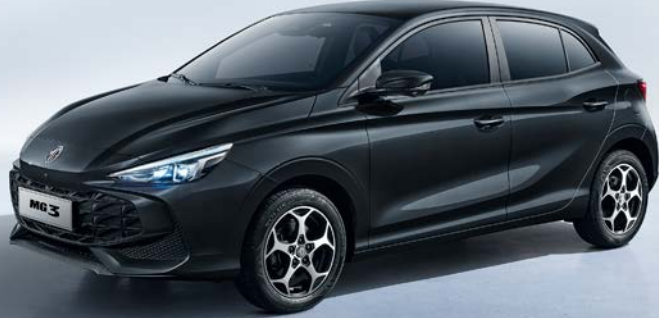
BLACK PEARL METALLIC