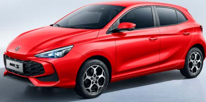
DIAMOND RED METALLIC