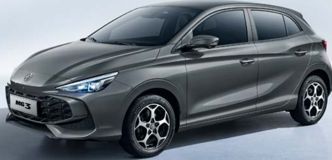
HAMPSTEAD GREY METALLIC