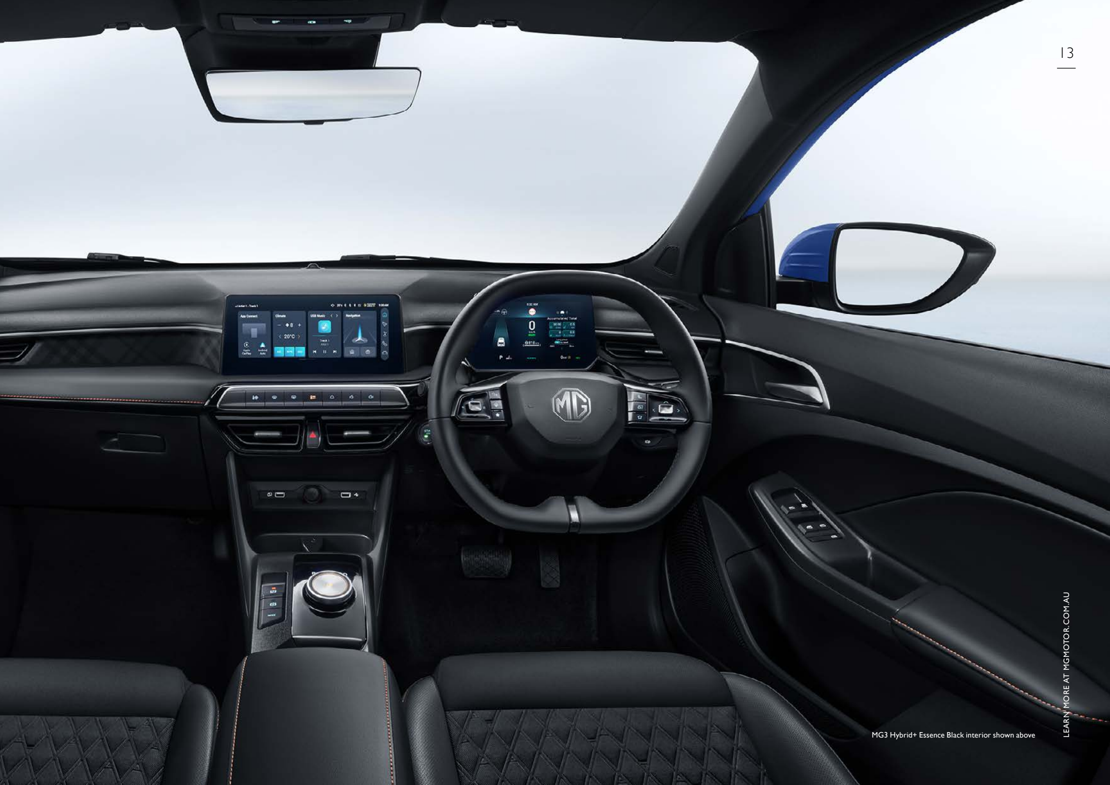
MG3 Hybrid+ Essence Black interior shown above