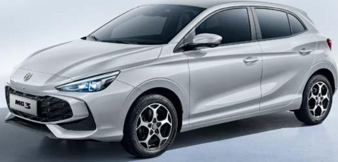
SLOANE SILVER METALLIC