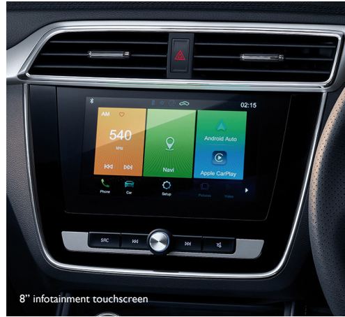
8" infotainment touchscreen