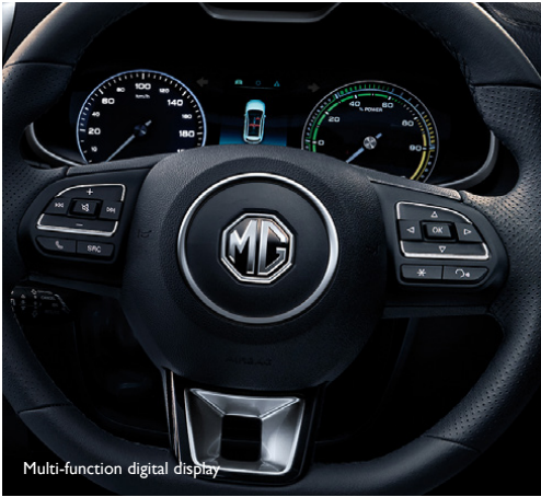
Multi-function digital display