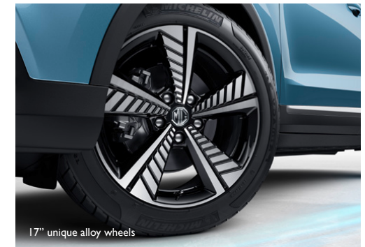
17" unique alloy wheels