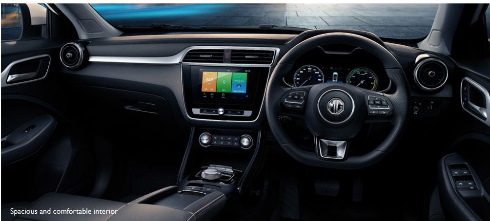
Spacious and comfortable interior