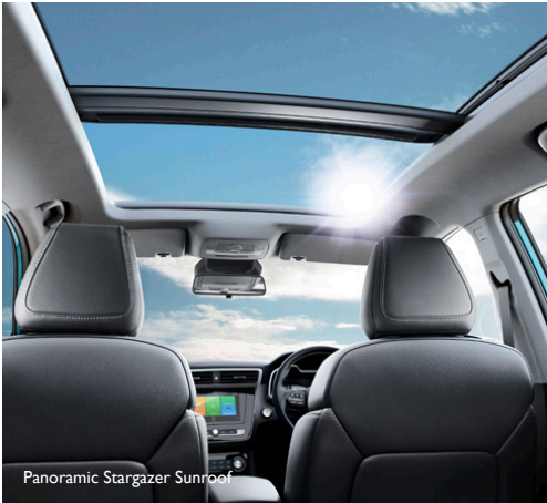
Panoramic Stargazer Sunroof