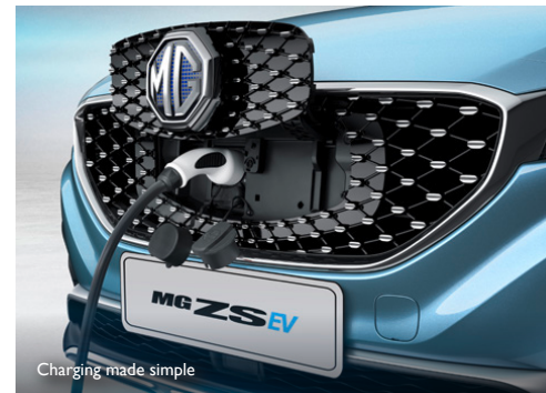
Charging made simple