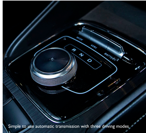
Simple to use automatic transmission with three driving modes