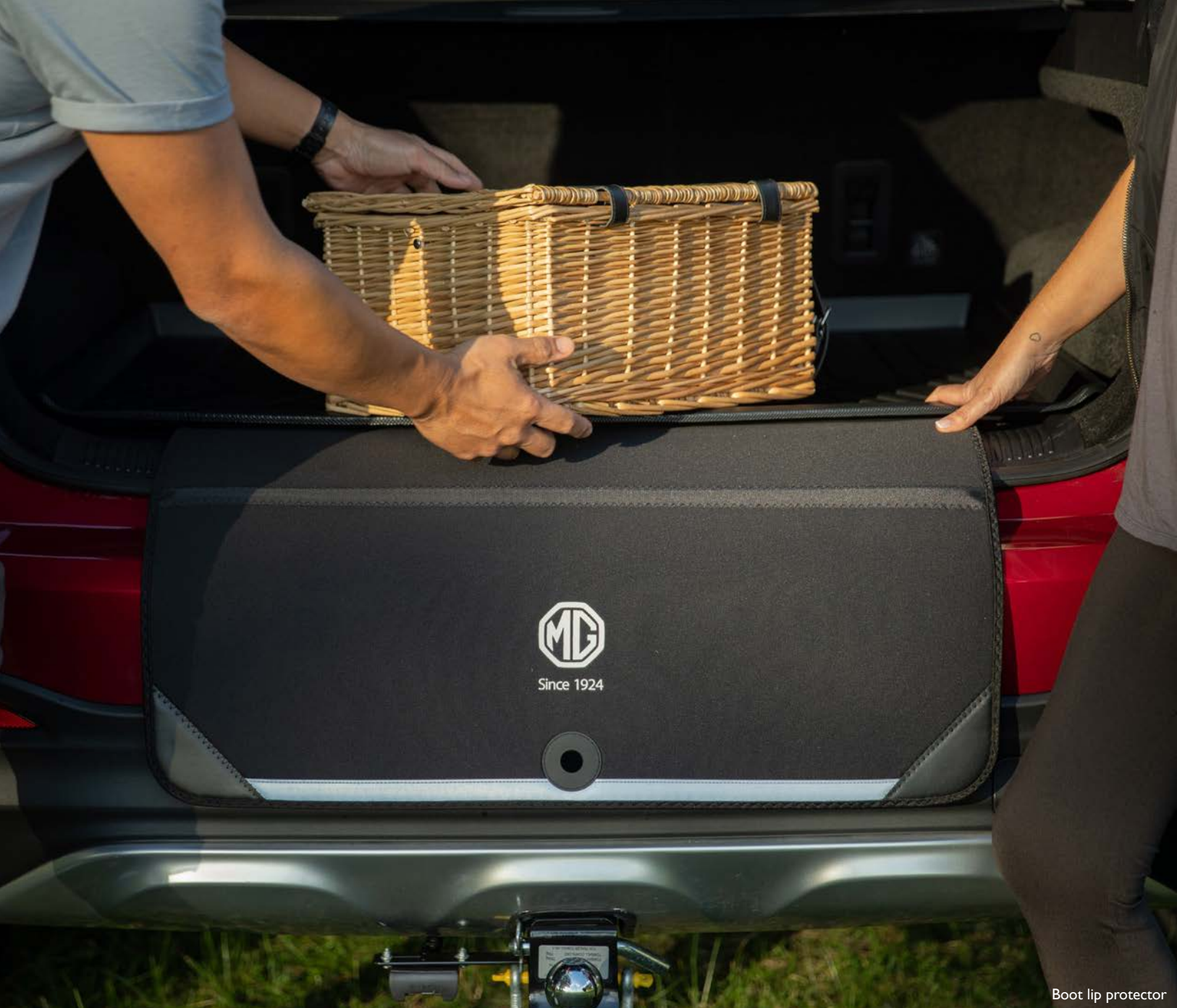
Boot lip protector