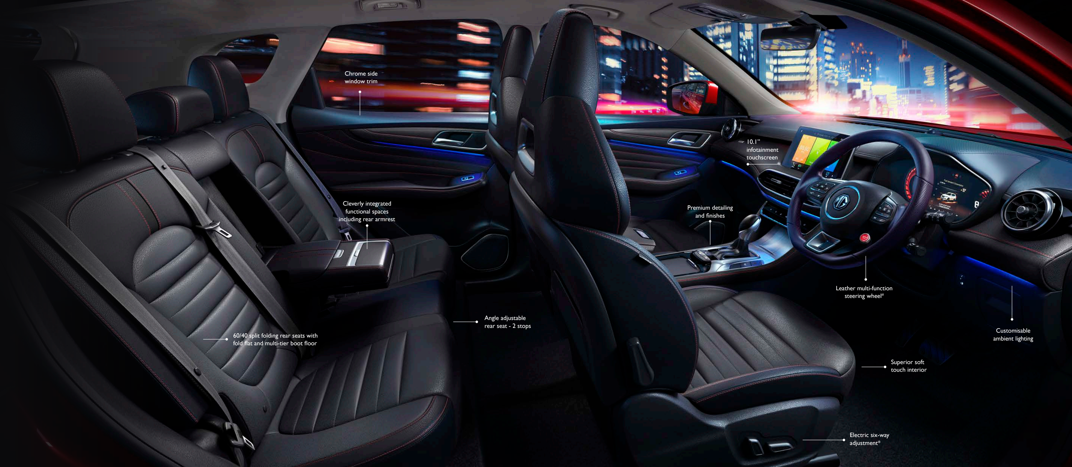
Chrome side window trim