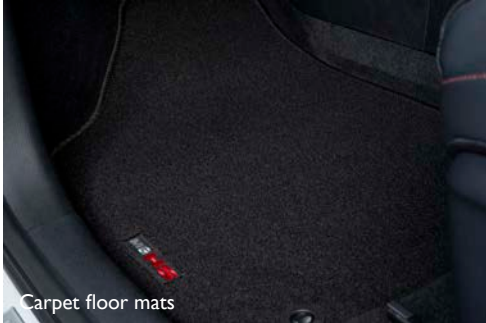
Carpet floor mats