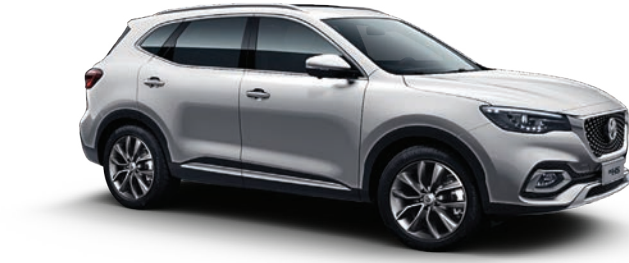
STERLING SILVER METALLIC