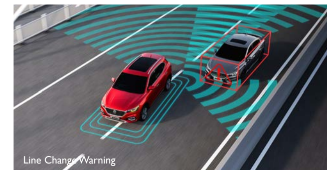
Line Change Warning