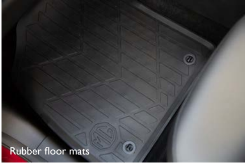
Rubber floor mats