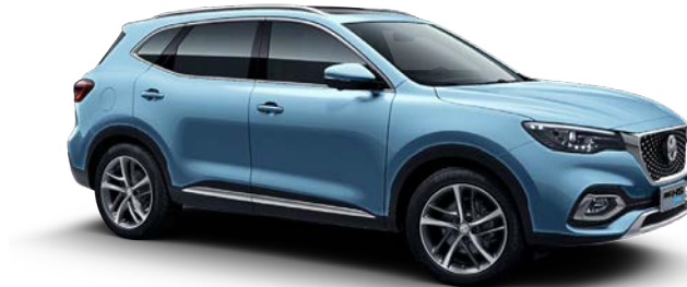
CLIPPER BLUE ‡ METALLIC