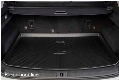
Plastic boot liner