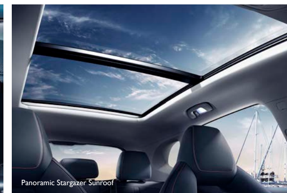
Panoramic Stargazer Sunroof

*Range figures are determined by testing under standardised laboratory conditions to comply with ADR 81 / 02. These figures should only be used for the purpose of comparison amongst vehicles. Actual figures will generally differ under real world driving conditions and will vary depending on factors including (but not limited to) driving style, vehicle's equipment and road, traffic and weather conditions. Provisional data at time of going to print. ^ Charging times can vary depending on many factors including but not limited to environmental conditions, auxiliary consumables (e.g. seat heating and air-conditioning) and capabilities of charging infrastructure capacity and/or supply ~Figures according to ADR 81/02 derived from laboratory testing. Factors including but not limited to driving style, road and traffic conditions, environmental influences, vehicle condition and accessories fitted, will in practice in the real world lead to figures which generally differ from those advertised. Advertised figures are meant for comparison amongst vehicles only. Actual Australian specification may vary from vehicle shown.