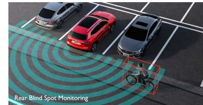
Rear Blind Spot Monitoring

The above safety features are driver assist technologies that are not a substitute for safe and attentive driving or for the drivers control over the vehicle.