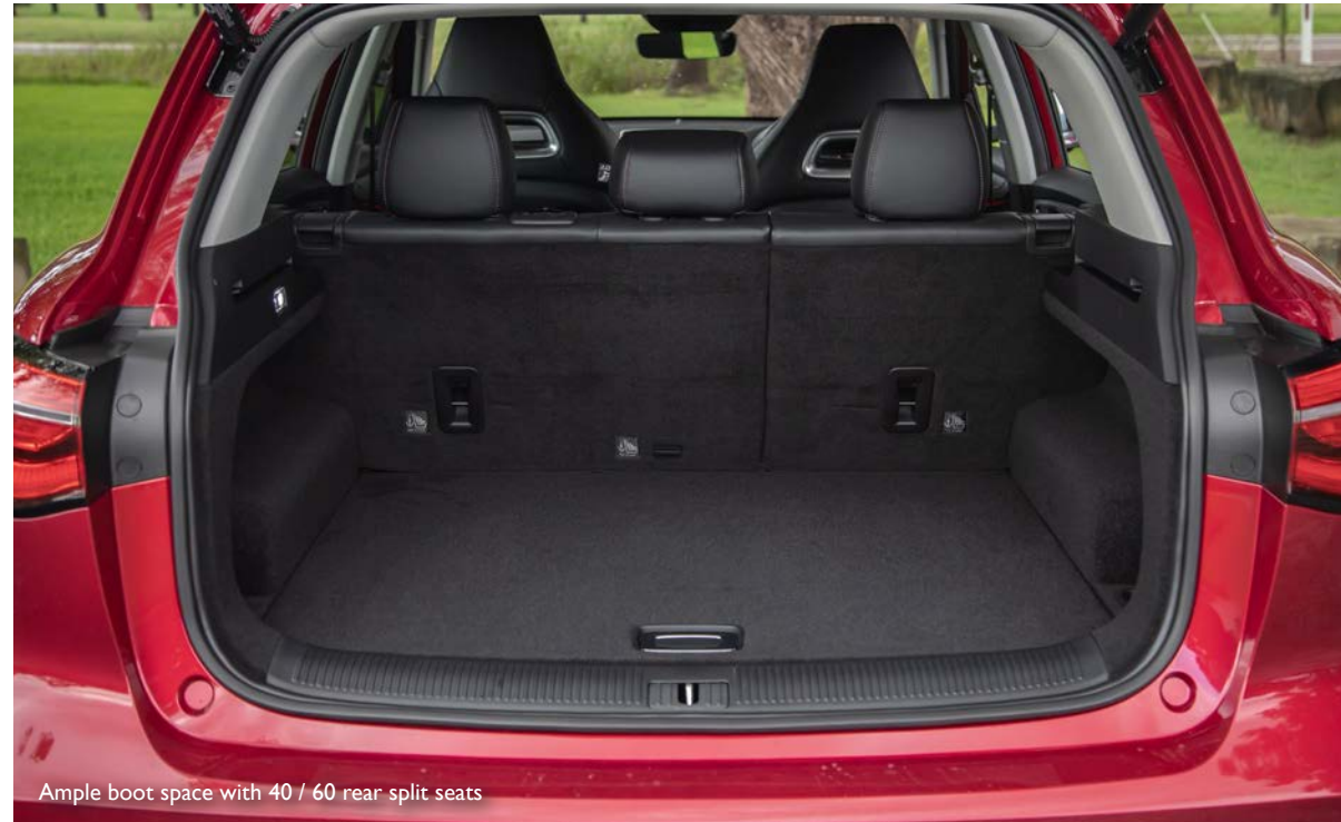
Ample boot space with 40 / 60 rear split seats

The powerful 2.0L Turbo engine is ideal for reactive driving in urban environments as well as navigating those longer rural road trips. In addition, the premium Michelin tyres are also adaptive to both city and country terrain, ensuring uncompromised performance on and off the beaten track.