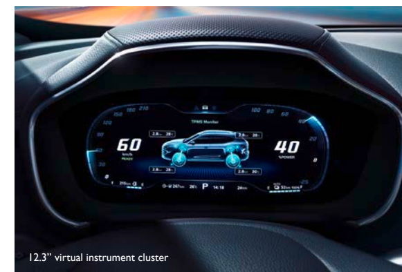
12.3" virtual instrument cluster