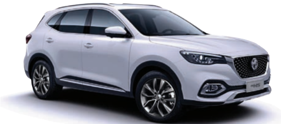
NEW PEARL WHITE METALLIC

Brighten your drive with our range of expressive MG HS colours. Choose from our considered selection of bespoke shades in both metallic and non-metallic options