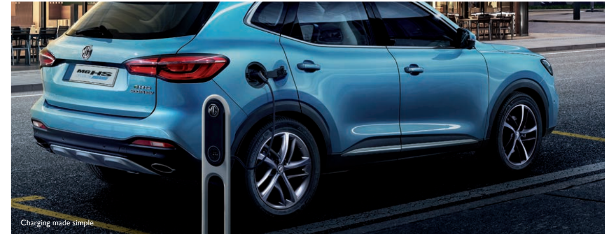
Charging made simple