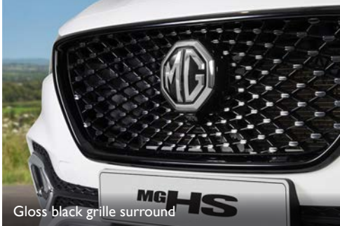
Gloss black grille surround