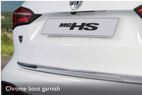
Chrome boot garnish