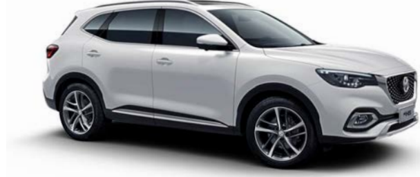
YORK WHITE NON METALLIC