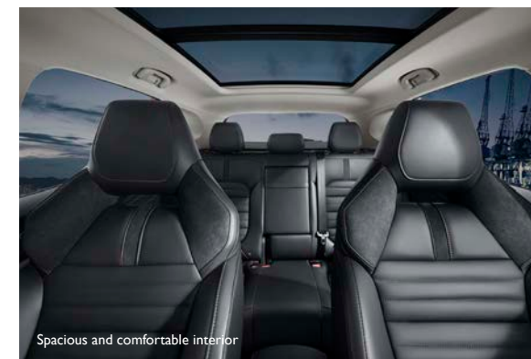
Spacious and comfortable interior