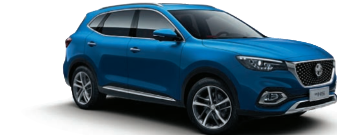
SURFING BLUE METALLIC