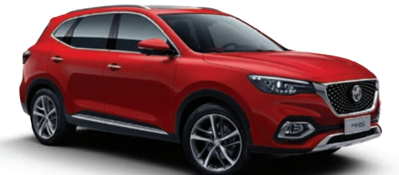
PHANTOM RED METALLIC