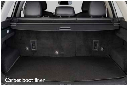
Carpet boot liner