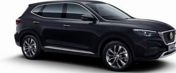
BLACK PEARL † METALLIC