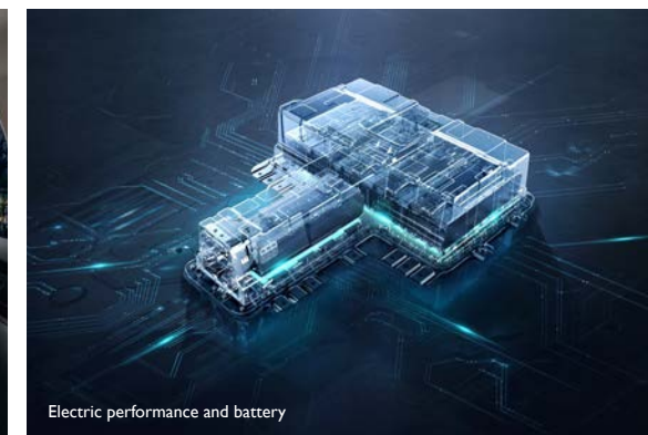
Electric performance and battery