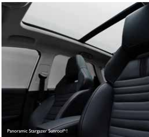
Panoramic Stargazer Sunroof^!