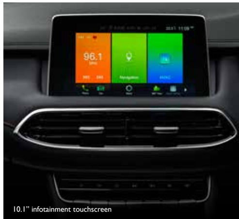
10.1" infotainment touchscreen