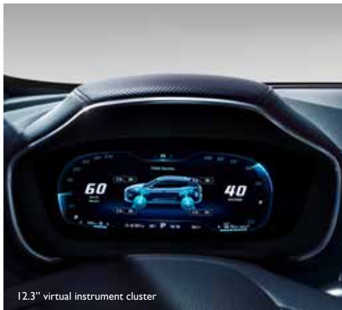
12.3" virtual instrument cluster