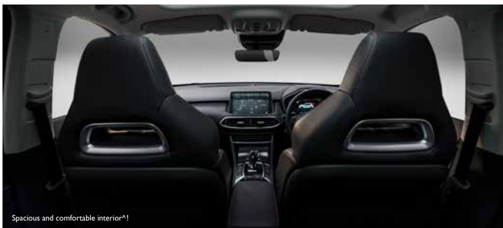
Spacious and comfortable interior^!