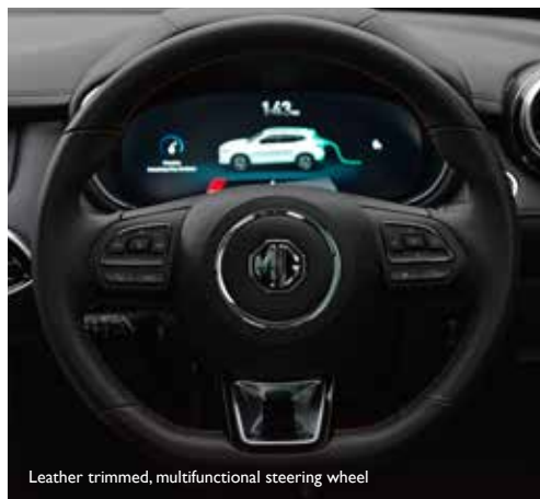
Leather trimmed, multifunctional steering wheel