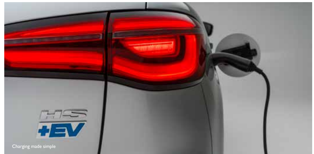
Charging made simple