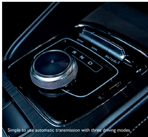
Simple to use automatic transmission with three driving modes