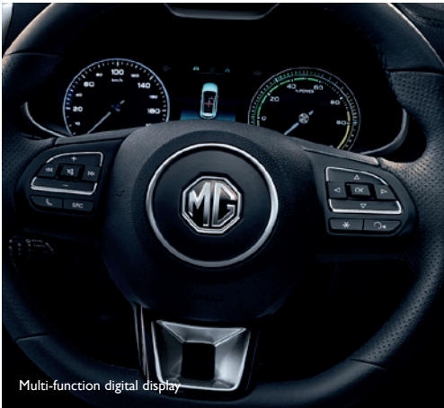
Multi-function digital display