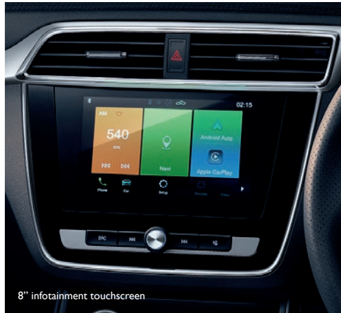
8" infotainment touchscreen