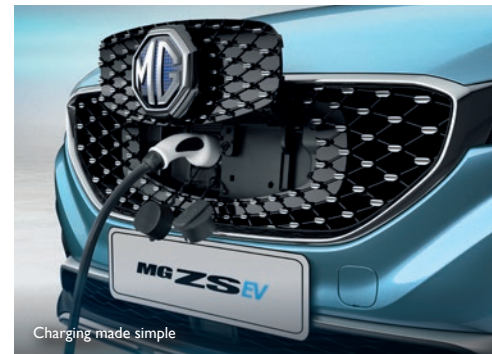
Charging made simple