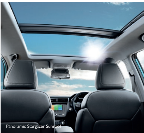
Panoramic Stargazer Sunroof