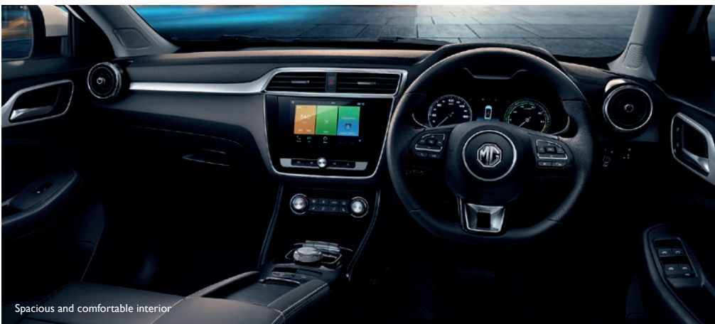
Spacious and comfortable interior