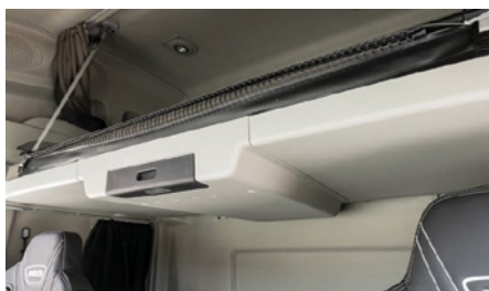
Stralis X-Way Sleeper Cab interior