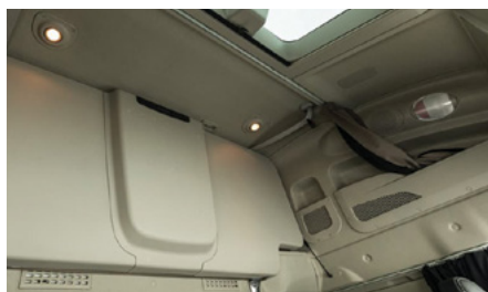
Stralis X-Way Sleeper Cab interior