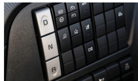
Stralis X-Way instrument panel