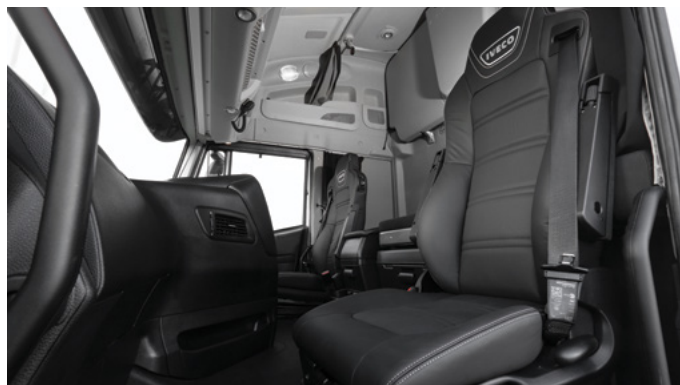
Stralis X-Way Rigid interior