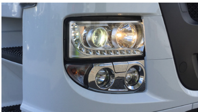
Xenon headlight + Headlamp washers