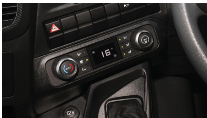
Auto a/c system