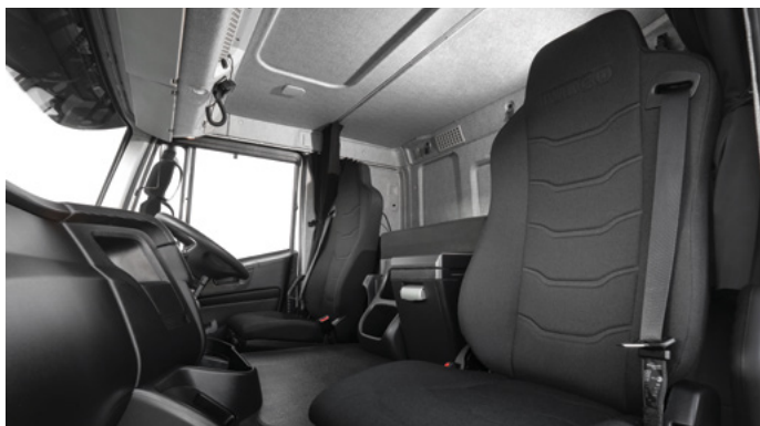
Stralis X-Way AT Rigid interior