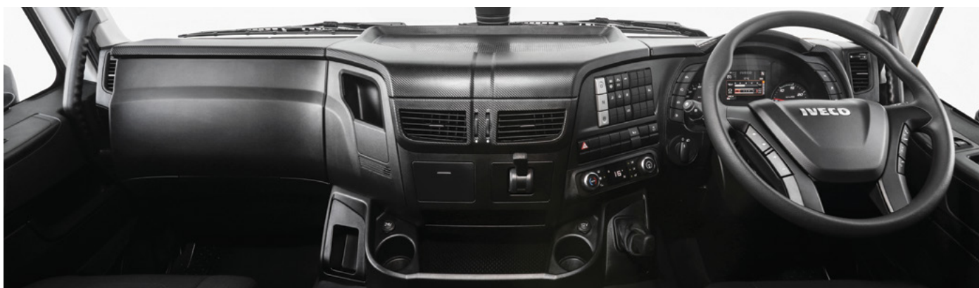
Stralis X-Way AT Rigid interior