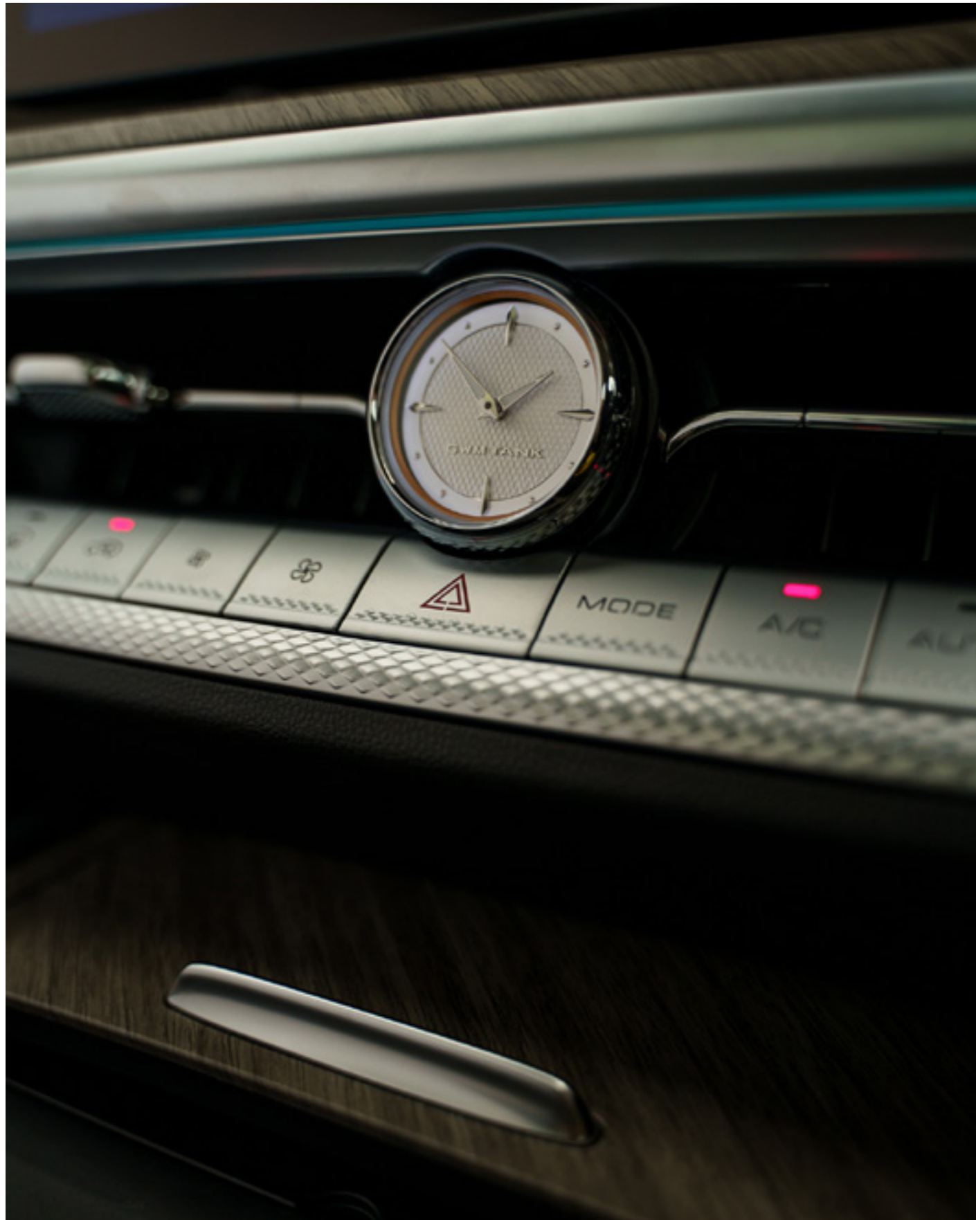
Purposefully designed centre console