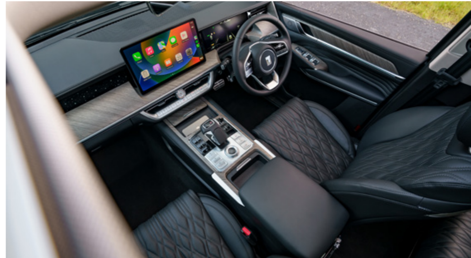
8-way power driver seat adjustment + 4-way lumbar support*