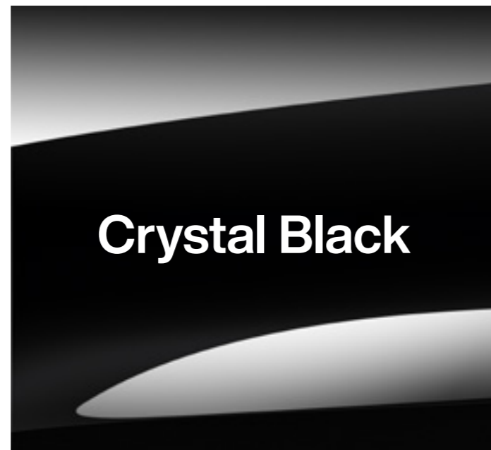
Premium Colour (+$595)