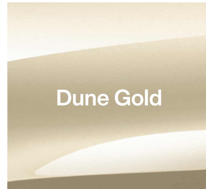
Premium Colour (+$595)