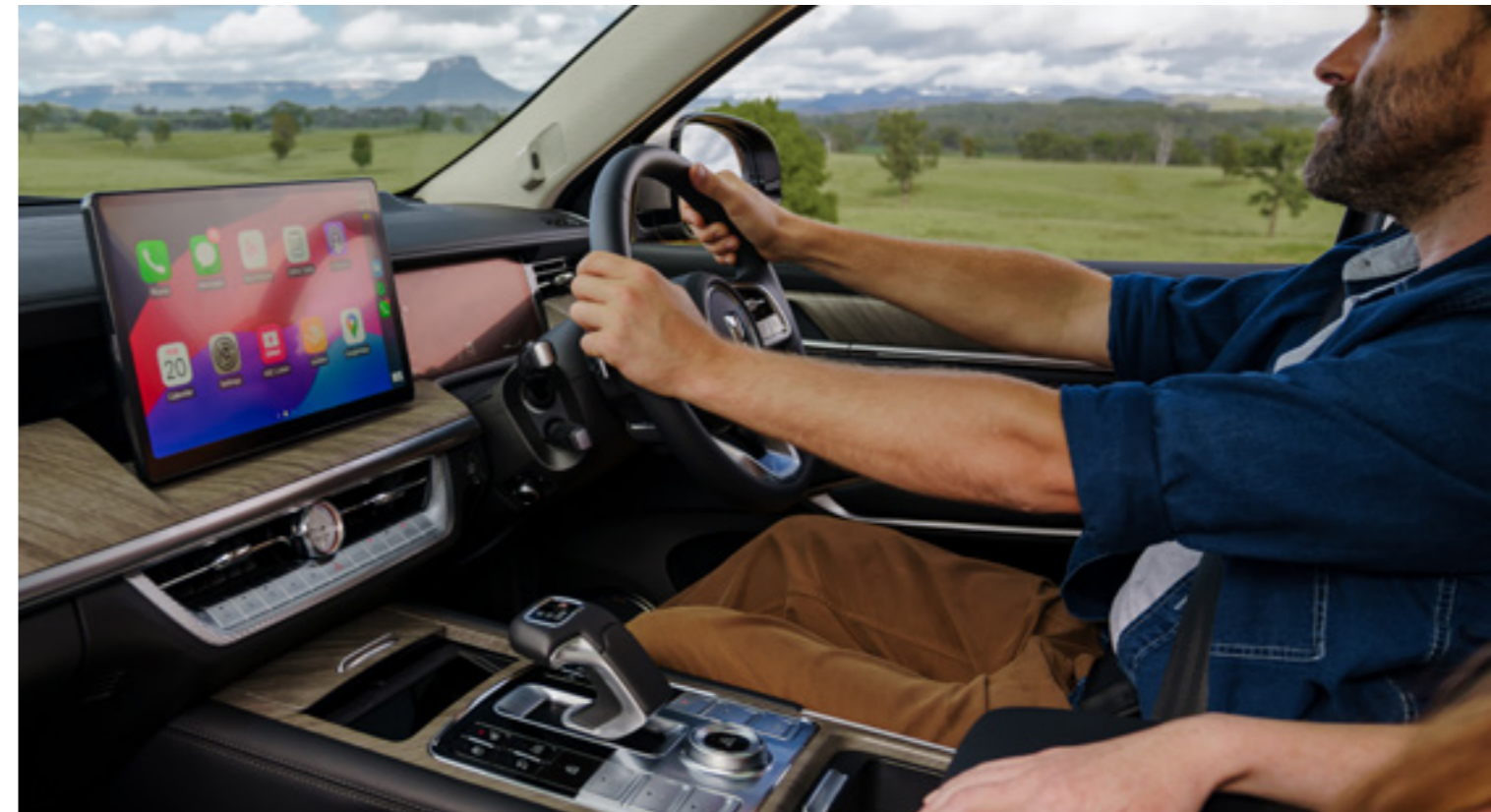
Multi function faux leather steering wheel