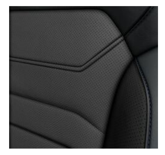
R R Soul Black Puglia leather appointed seat upholstery*

Please note: Metallic (M) and Premium Metallic (PM) paint are optional at additional cost.