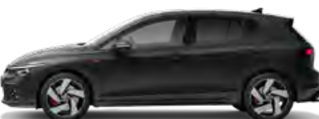
Dolphin Grey M