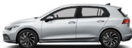
Reflex Silver M (Excluding R-Line)