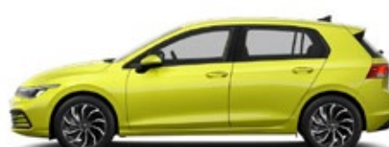
Pomelo Yellow PM