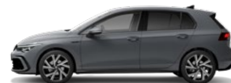
Moonstone Grey P (R-Line)