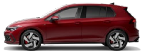
Kings Red PM