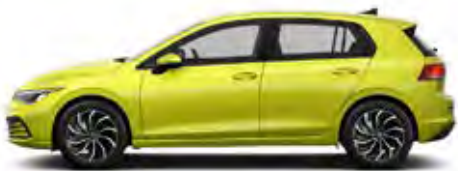
Pomelo Yellow PM