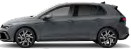
Moonstone Grey P (R-Line)