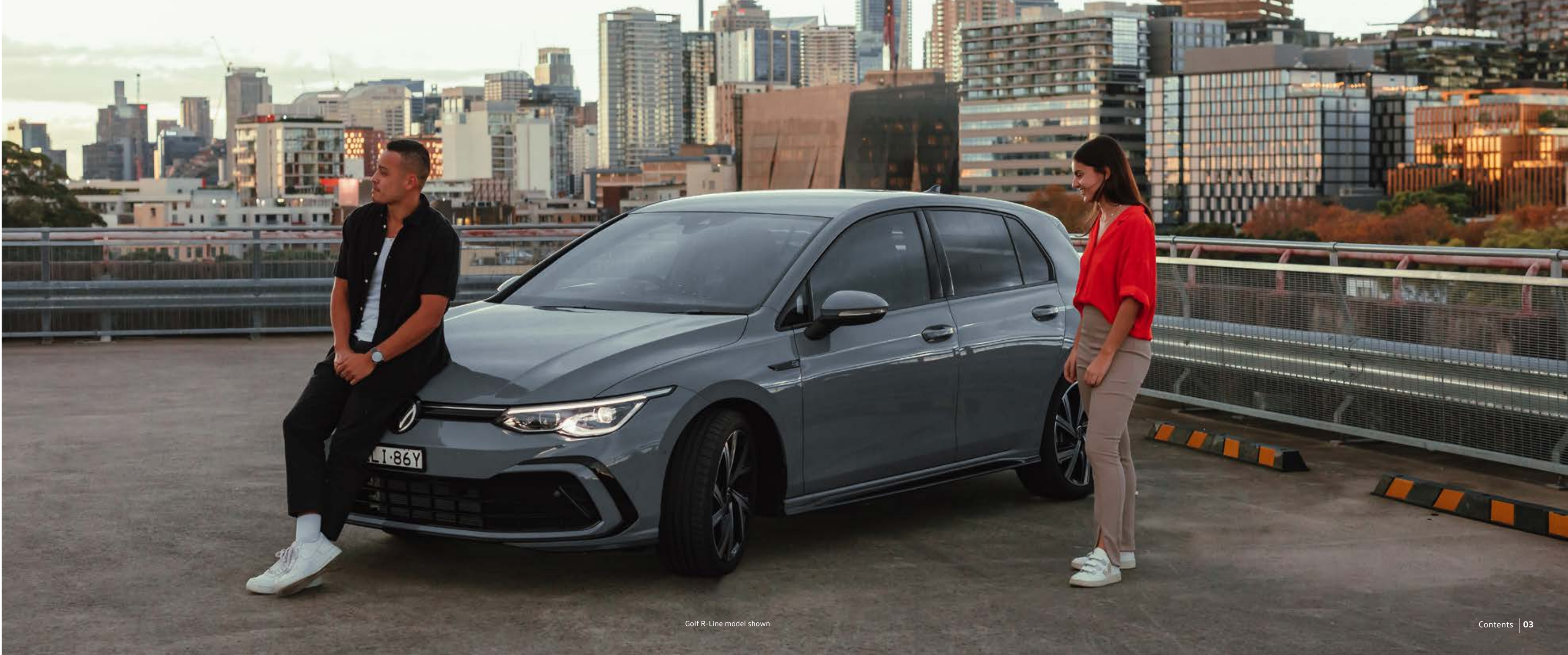
Golf R-Line model shown