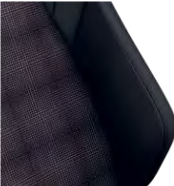
'Scale Paper' Black/Red Sports cloth seat upholstery