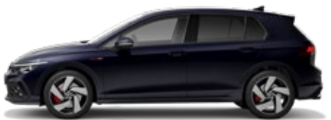
Atlantic Blue M