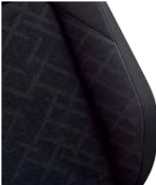
Golf Life - Comfort Seats Comfort cloth