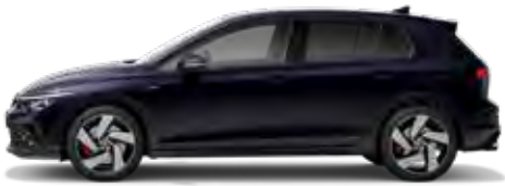
Atlantic Blue M