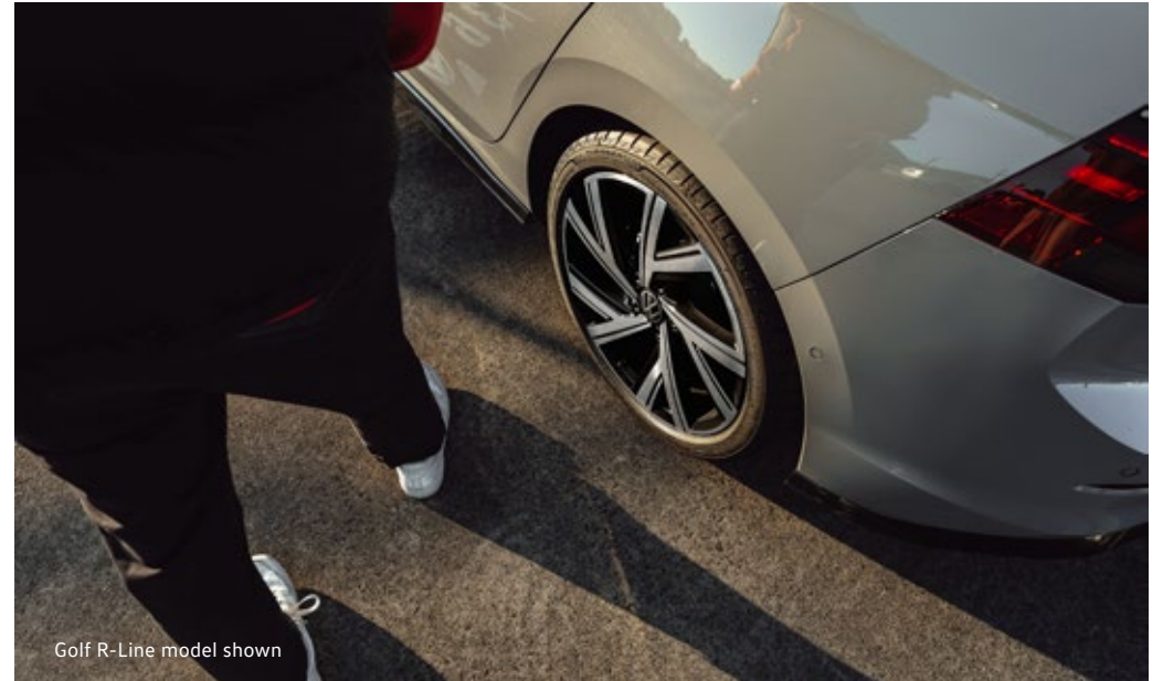
Golf R-Line model shown