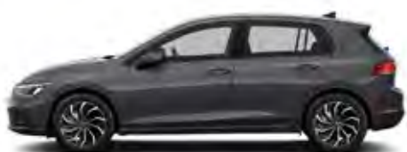
Dolphin Grey M