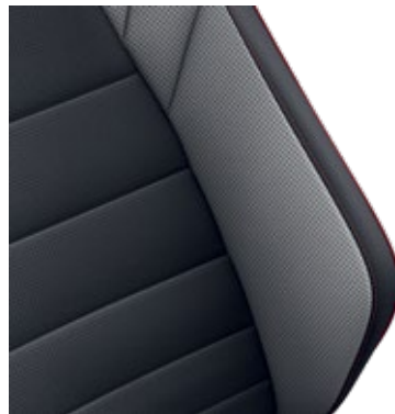
Black Vienna Leather appointed seat upholstery#

#Leather appointed seats have a combination of genuine and artificial leather, but are not wholly leather.