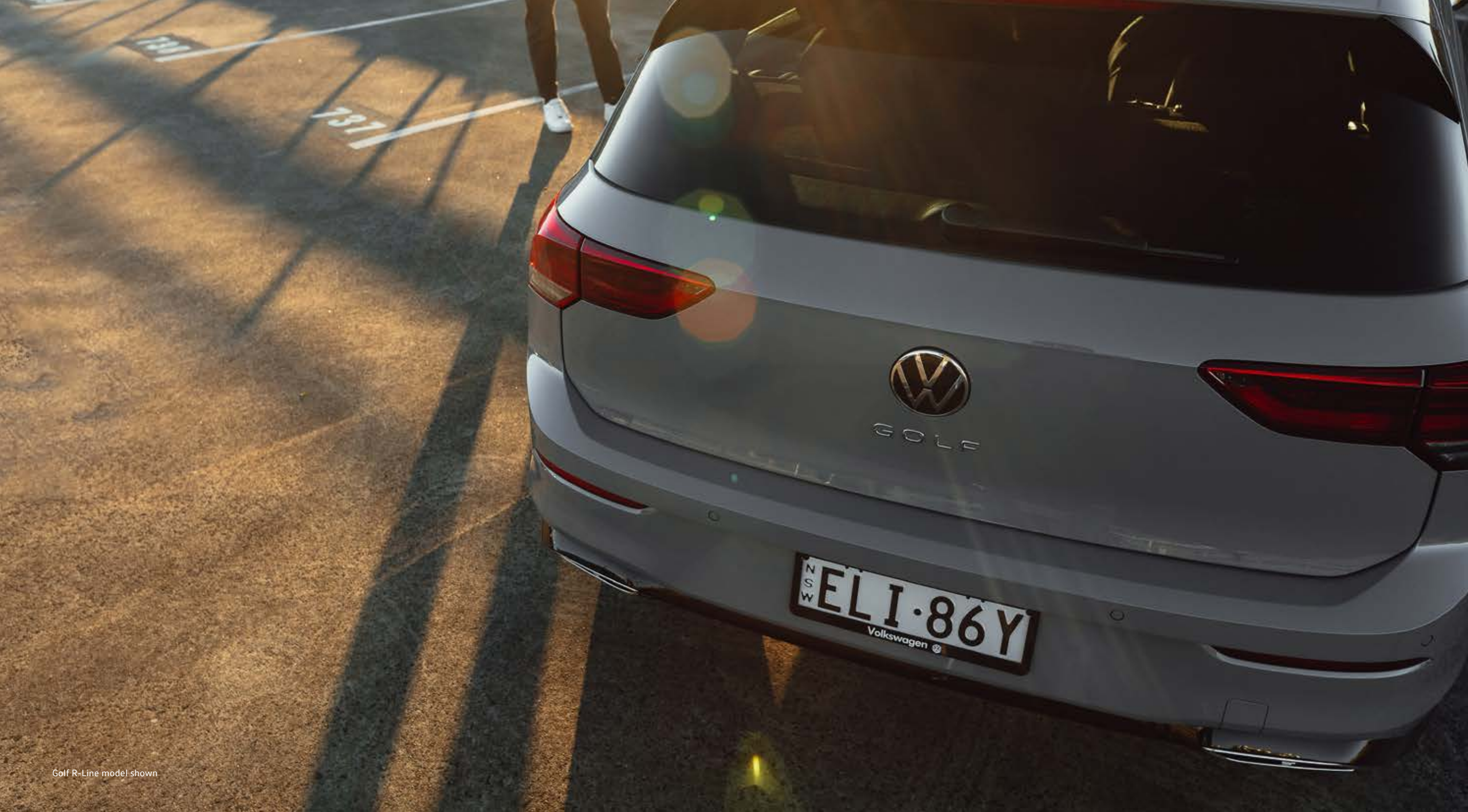
Golf R-Line model shown