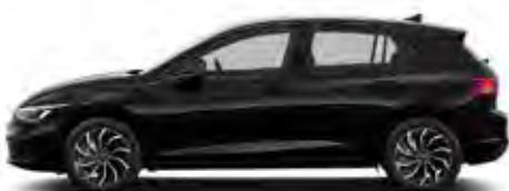
Deep Black PE