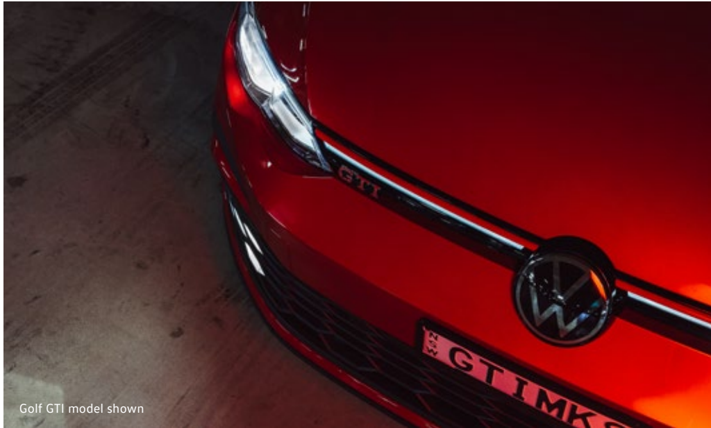
Golf GTI model shown