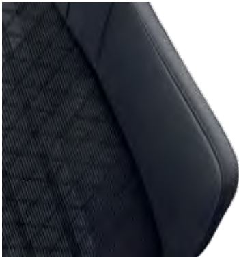
Golf R-Line Sports cloth-Microfleece

Please note: Premium (P), Metallic (M), Premium Metallic (PM) and Pearl Effect (PE) paint are optional at additional cost, except GTI. Premium Metallic (PM) paint is optional at additional cost GTI. The print process does not allow for exact reproduction of the exterior or the upholstery colours. Please contact your Volkswagen Dealer for further information on colours and upholstery combinations.