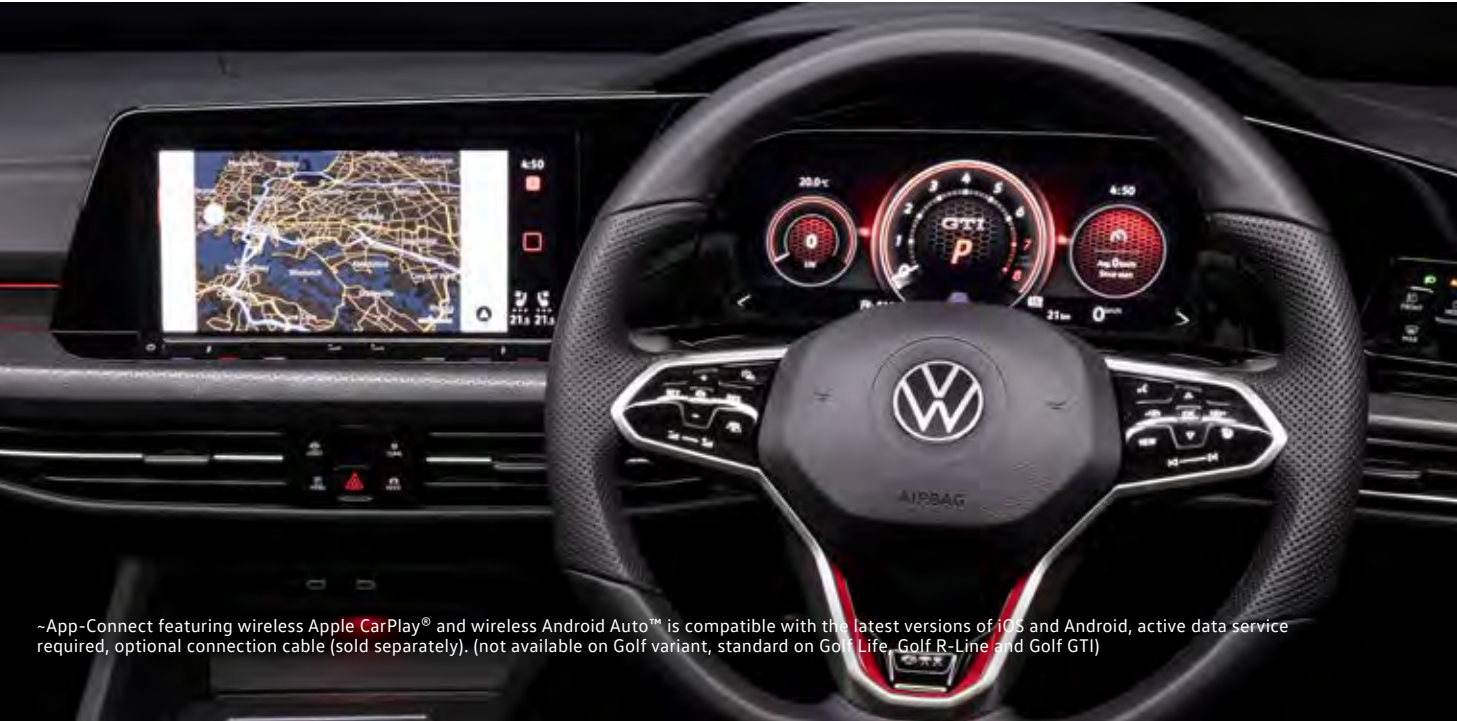
~App-Connect featuring wireless Apple CarPlay® and wireless Android Auto™ is compatible with the latest versions of iOS and Android, active data service required, optional connection cable (sold separately). (not available on Golf variant, standard on Golf Life, Golf R-Line and Golf GTI)

In the Golf, Wireless App-Connect~ for Apple CarPlay® and Android Auto™ and four USB-C ports mean you're only a touch away from all your favourite apps and media files. DAB+ digital radio ensures you're receiving superior audio quality and have more station to choose from. And Keyless access and start makes it a cinch to jump in your Golf and just drive away. As is befitting its sporty styling, the Golf R-Line incorporates a multi-function sports steering wheel and stainless steel pedals, dark tinted rear and side windows and progressive steering (features also found in the Golf GTI).