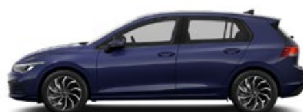
Atlantic Blue M