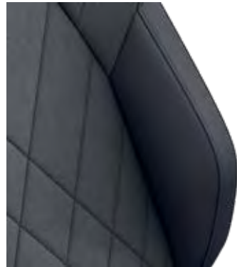
Golf Life - Comfort sport seats (Optional) Microfleece-cloth