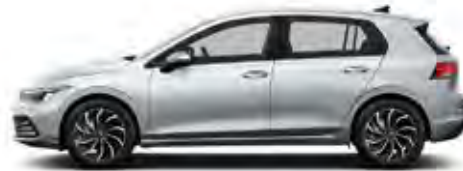
Reflex Silver M (Excluding R-Line)