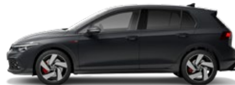
Dolphin Grey M