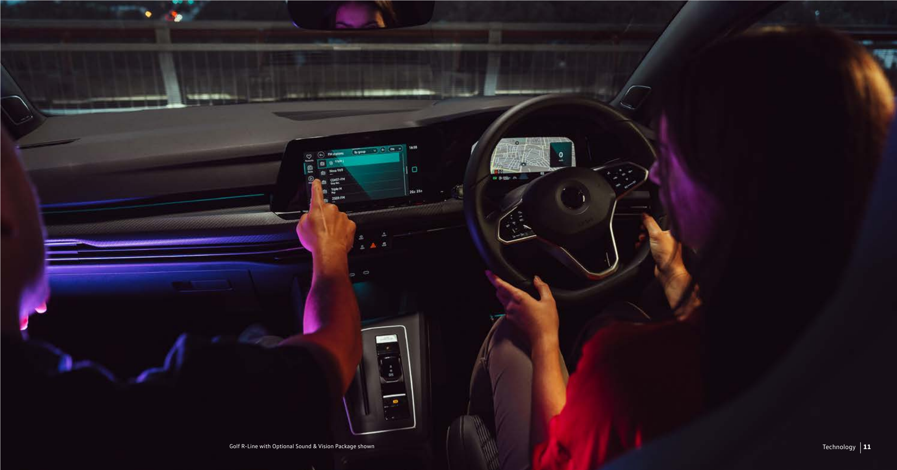
Golf R-Line with Optional Sound & Vision Package shown