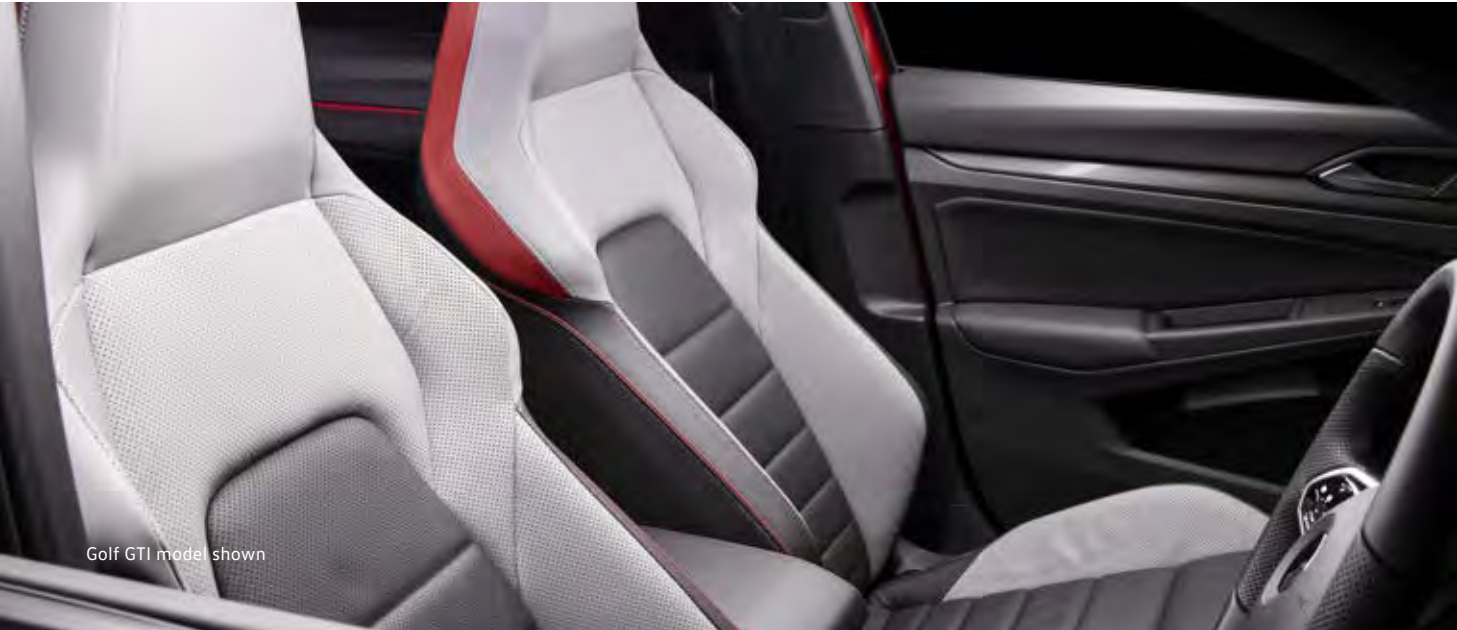
Golf GTI model shown

Nowhere does form and function intersect more completely than in the range-topping Golf GTI. With its honeycomb-patterned dash panel and door trims, sports seats with integrated head restraints, GTI-style tartan fabric, stainless steel pedals, the Golf GTI’s interior is as distinctive – and impressive – as they come.