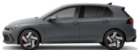
Moonstone Grey P