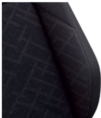
Golf Life Comfort Seats Comfort cloth