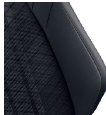
Golf R-Line Sports cloth-Microfleece

Please note: Premium (P), Metallic (M), Premium Metallic (PM) and Pearl Effect (PE) paint are optional at additional cost, except GTI. Premium Metallic (PM) paint is optional at additional cost GTI. The print process does not allow for exact reproduction of the exterior or the upholstery colours. Please contact your Volkswagen Dealer for further information on colours and upholstery combinations.