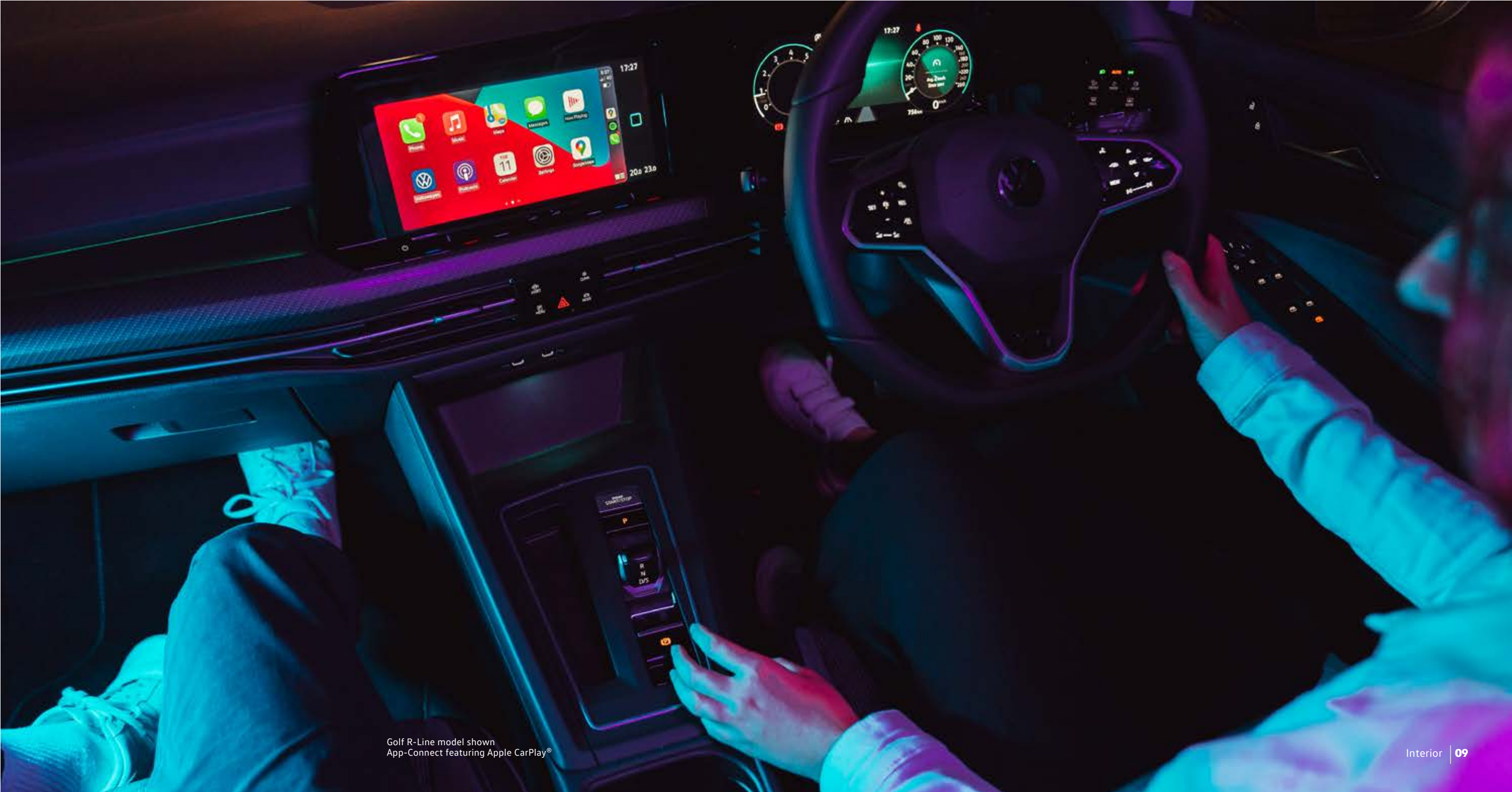
Golf R-Line model shown App-Connect featuring Apple CarPlay®