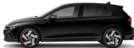
Deep Black PE