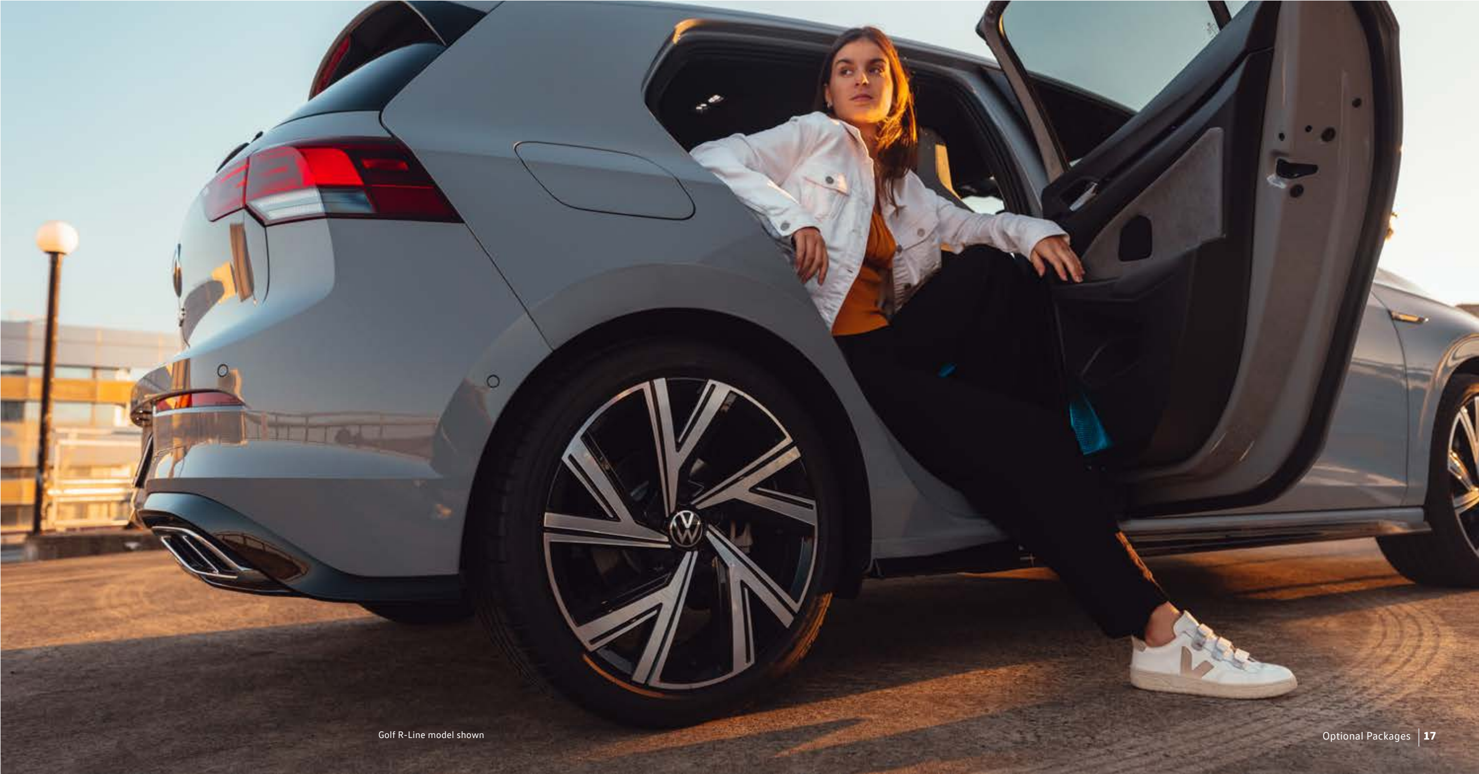
Golf R-Line model shown