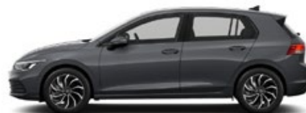
Dolphin Grey M