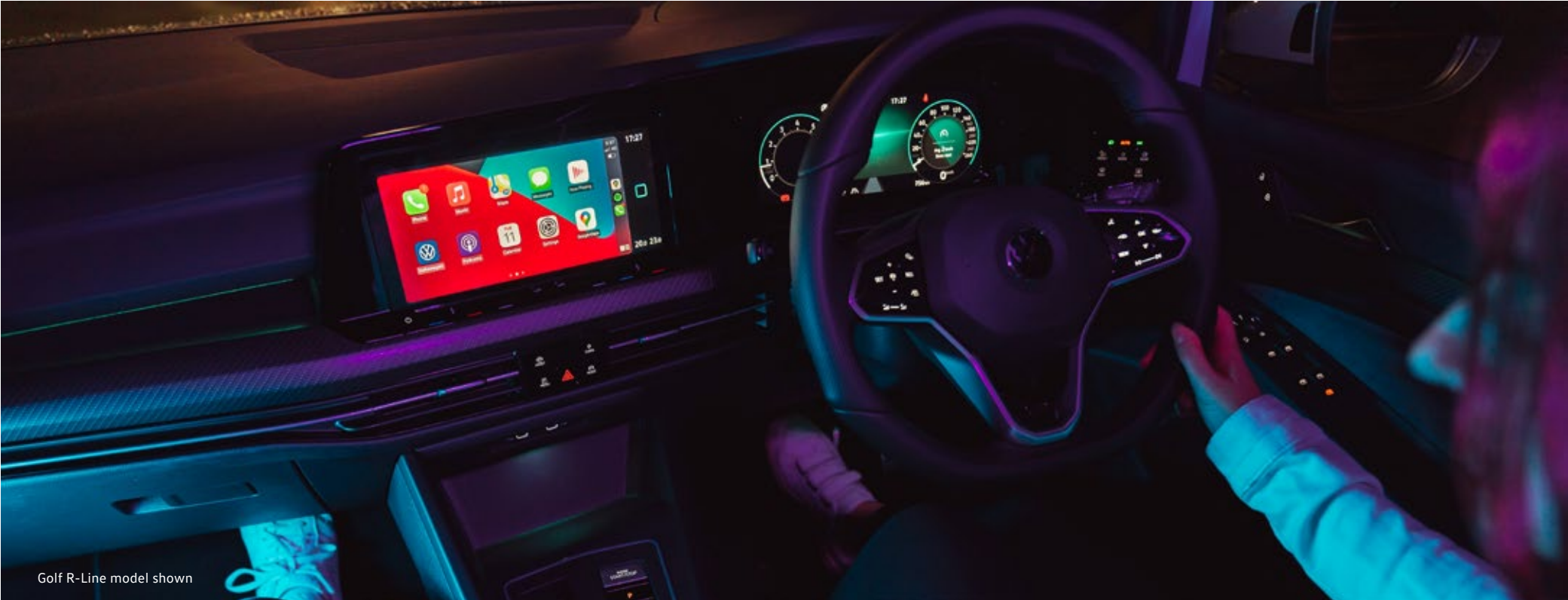
Golf R-Line model shown