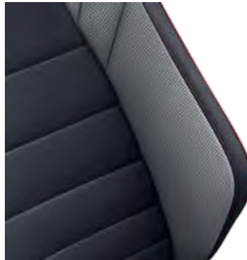
Black Vienna Leather appointed seat upholstery#

#Leather appointed seats have a combination of genuine and artificial leather, but are not wholly leather. Please note: Premium (P), Metallic (M), Premium Metallic (PM) and Pearl Effect (PE) paint are optional at additional cost, except GTI. Premium Metallic (PM) paint is optional at additional cost GTI. The print process does not allow for exact reproduction of the exterior or the upholstery colours. Please contact your Volkswagen Dealer for further information on colours and upholstery combinations.