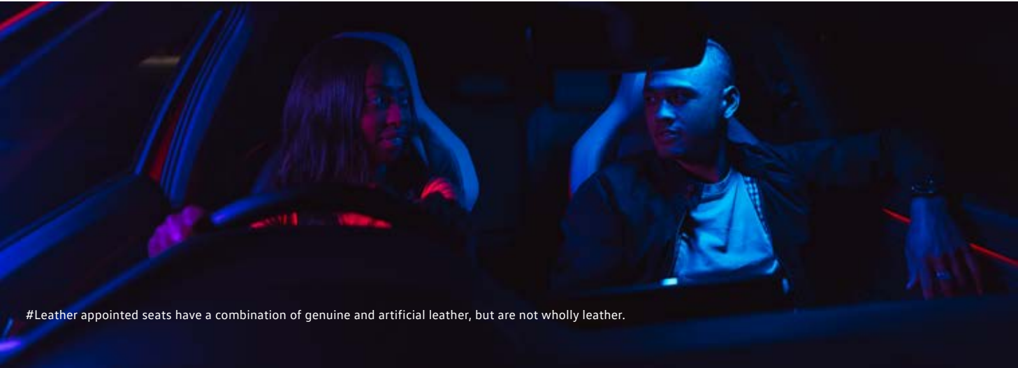
#Leather appointed seats have a combination of genuine and artificial leather, but are not wholly leather.

The Luxury package, available only in the Golf GTI, offers additions that are the pinnacle of sophistication. You’ll be sitting in the lap of luxury with the package’s Vienna leather appointed upholstery#, electrically operated driver seat with memory, heated and ventilated front seats, heated steering wheel and panoramic electric glass sunroof.