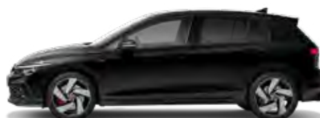
Deep Black PE