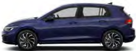
Atlantic Blue M