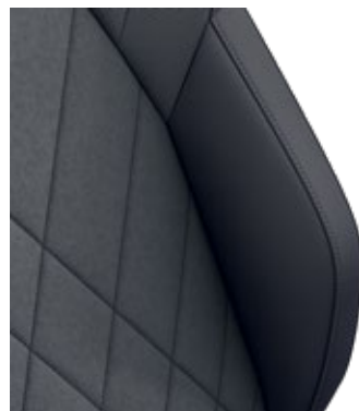
Golf Life Comfort sport seats (Optional) Microfleece-cloth