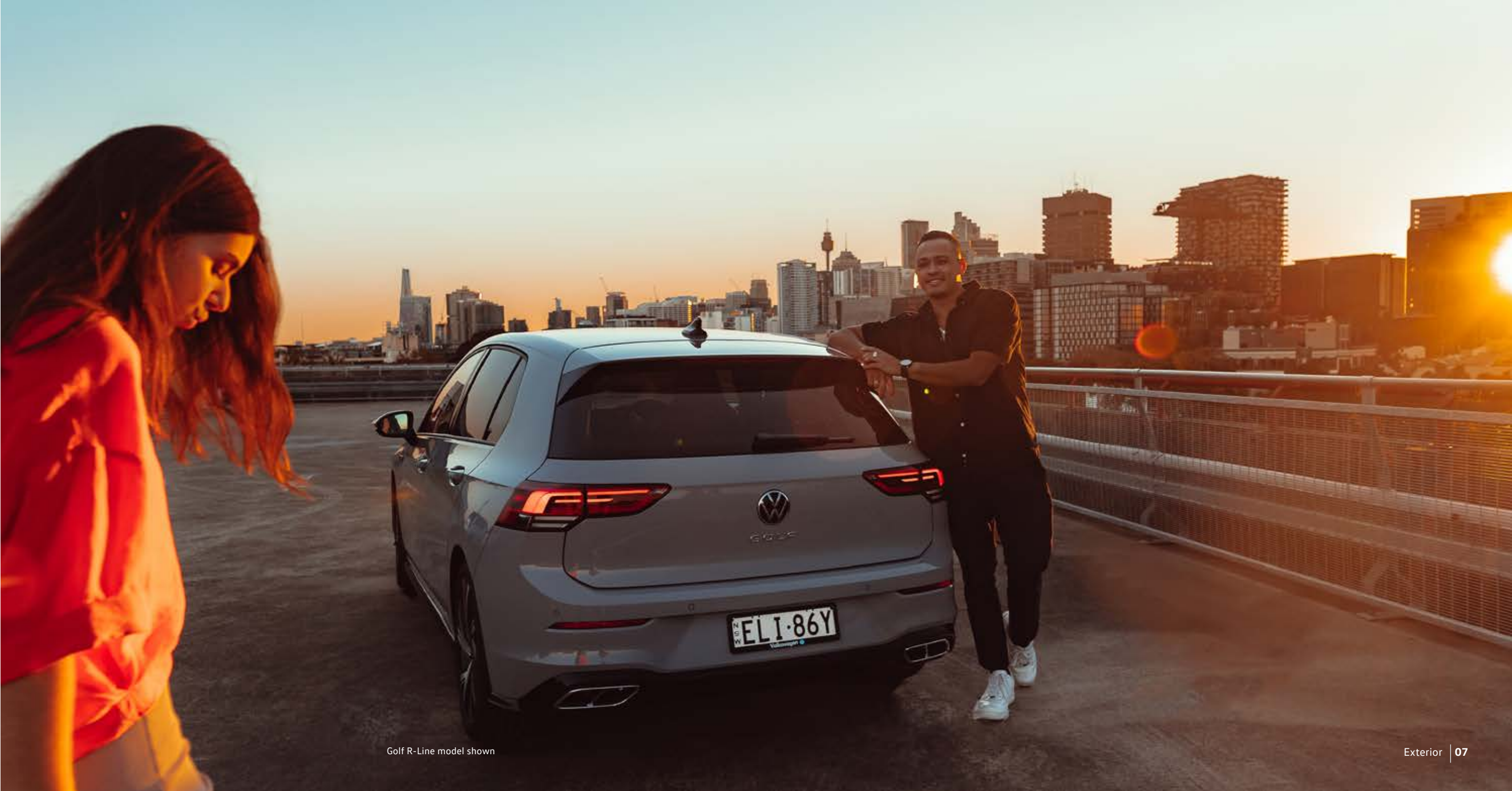
Golf R-Line model shown