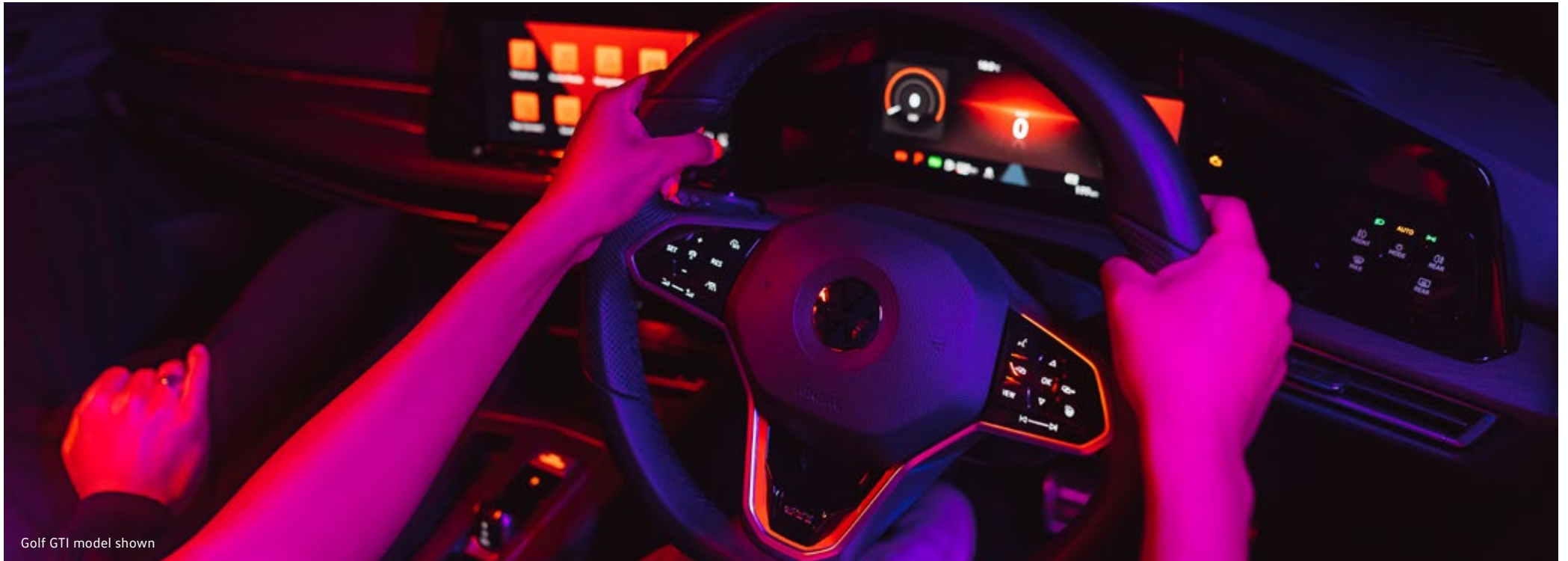
Golf GTI model shown