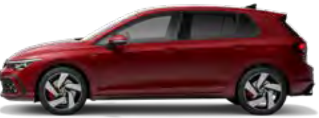
Kings Red PM