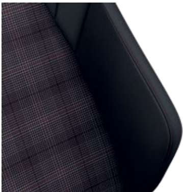
'Scale Paper' Black/Red Sports cloth seat upholstery