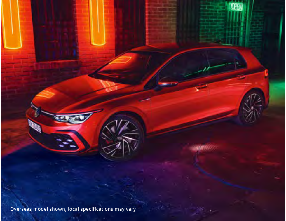
Overseas model shown, local specifications may vary