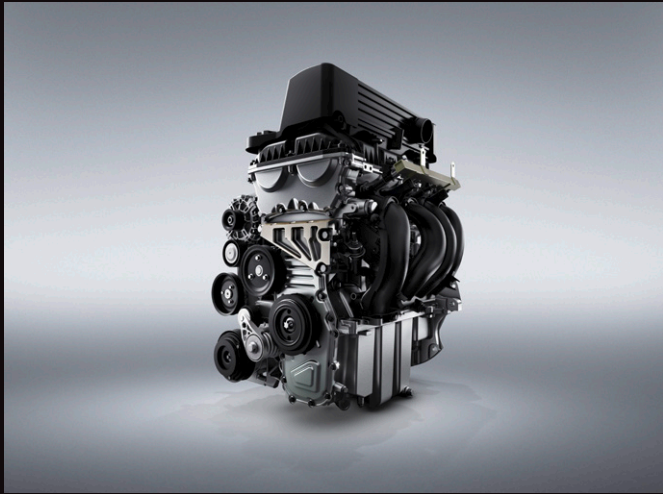
82kW 1.5L NSE Major