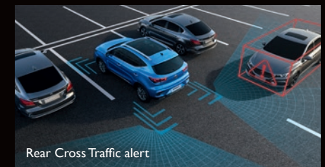
Rear Cross Traffic alert