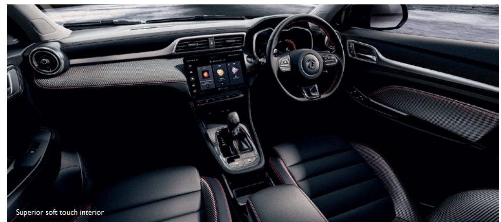
Superior soft touch interior