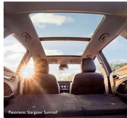
Panoramic Stargazer Sunroof