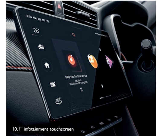
10.1" infotainment touchscreen