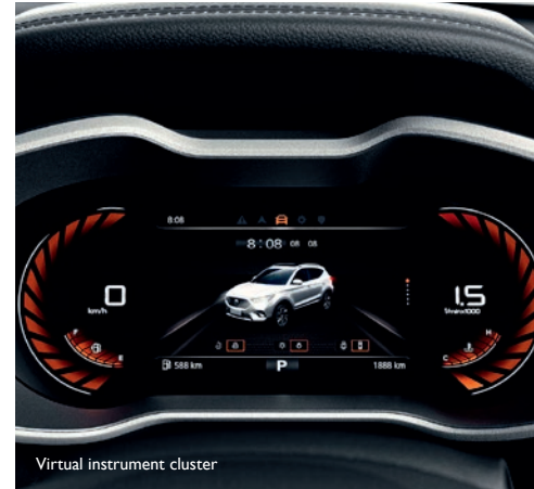
Virtual instrument cluster

Includes Apple CarPlay™ and Android Auto™ functionality.