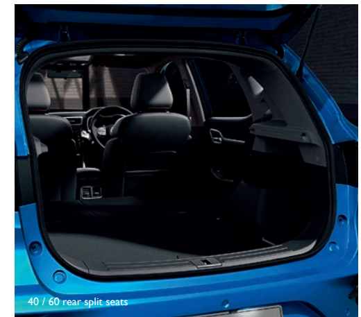
40 / 60 rear split seats