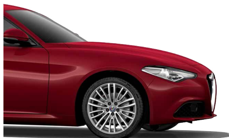
4AY 18-Inch Luxury Design Alloy Wheel (Standard - Super)