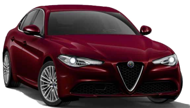
093 Monza Red (Metallic) Option