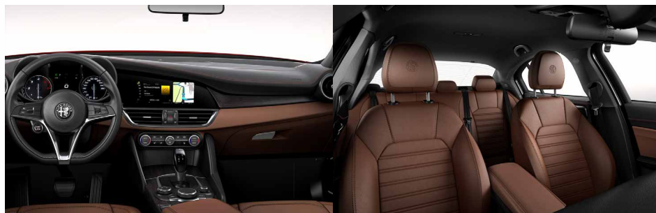
Tan Pieno Fiore Leather with Oak Inserts Option - Super