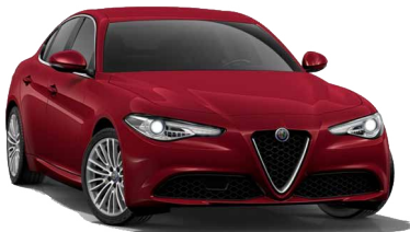
414 Alfa Red (Solid) Standard