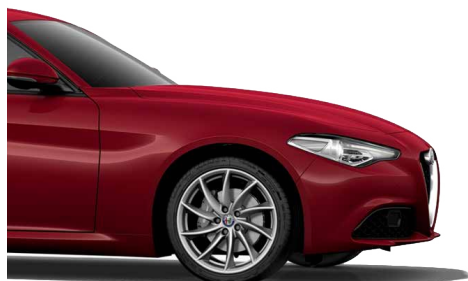
4WQ 18-Inch Turbine Alloy Wheel (Standard - Giulia)