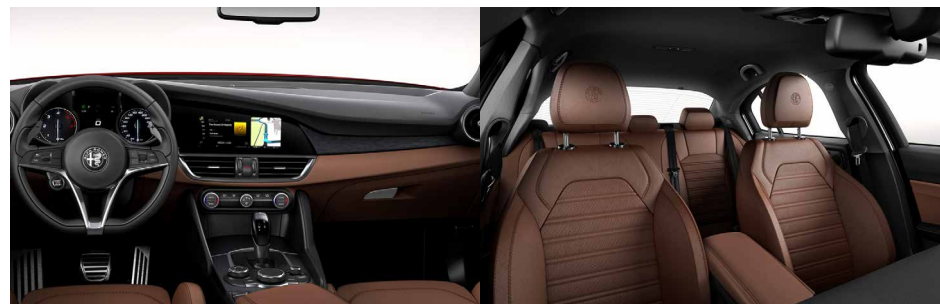
Tan Sports Leather Option - Veloce