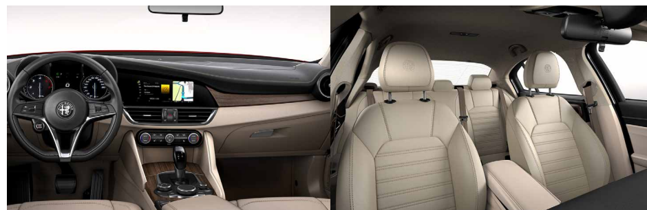
Beige Pieno Fiore Leather with Walnut Inserts Option - Super