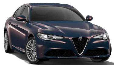
409 Lipari Grey (Metallic) Option