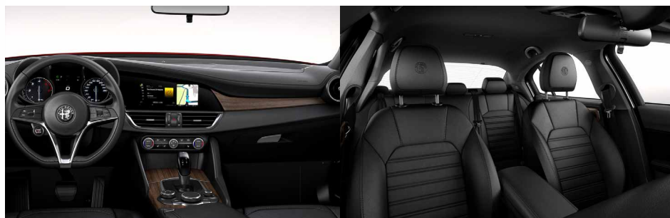
Black Pieno Fiore Leather with Walnut Inserts Option - Super