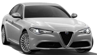
620 Silverstone Grey (Metallic) Option