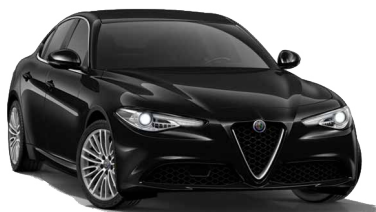
408 Vulcano Black (Metallic) Option