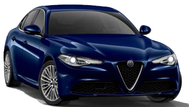
092 Montecarlo Blue (Metallic) Option