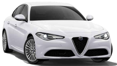
217 Alfa White (Solid) Standard