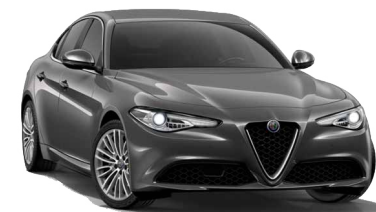
035 Vesuvio Grey (Metallic) Option