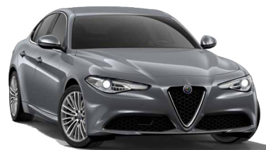
318 Stromboli Grey (Metallic) Option