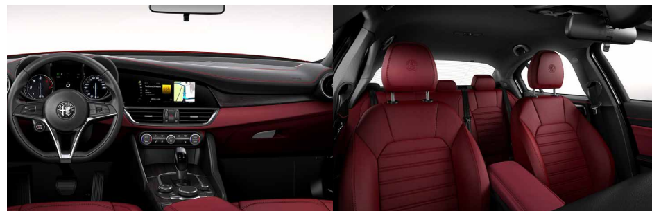
Red Pieno Fiore Leather with Oak Inserts Option - Super