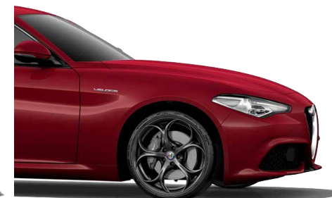
5EQ 19-Inch 5-Hole Dark Finish Alloy Wheel (Standard - Veloce / Linked to Veloce Pack)