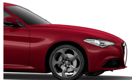
68P 18-Inch Sports Alloy Wheel (Option - Giulia & Super)