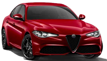
361 Competizione Red (Tri-Coat) Option