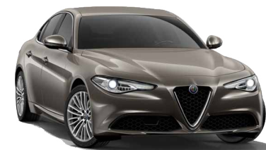
082 Imola Titanium (Metallic) Option