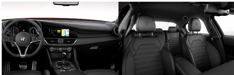
Black Sports Leather Standard - Veloce