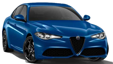
756 Misano Blue (Metallic) Option