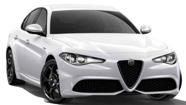
248 Trofeo White (Tri-Coat) Option