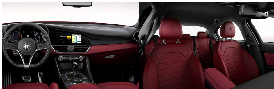
Red Sports Leather Option - Veloce