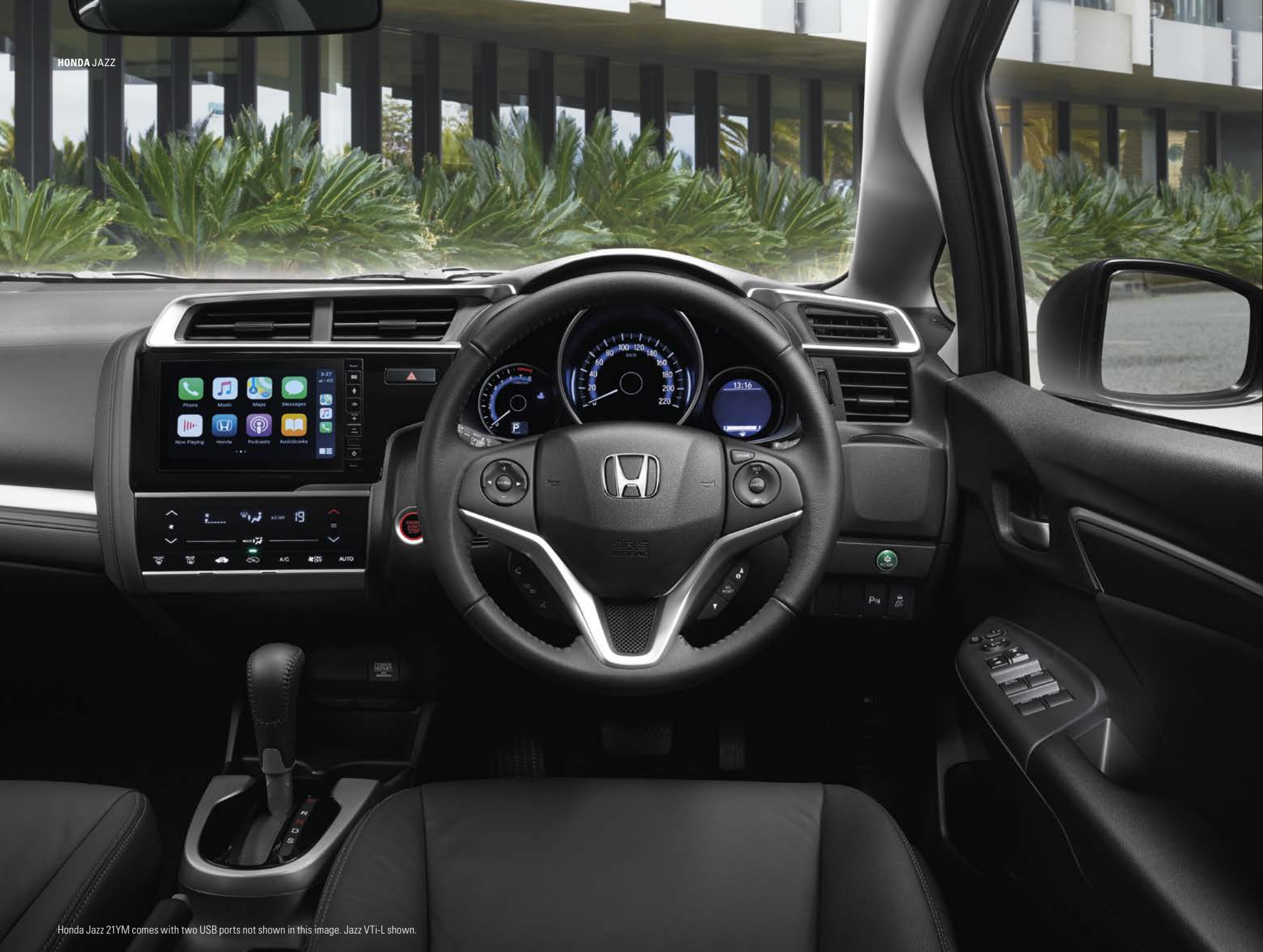
Honda Jazz 21YM comes with two USB ports not shown in this image. Jazz VTi-L shown.