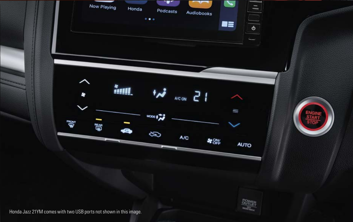
Honda Jazz 21YM comes with two USB ports not shown in this image.