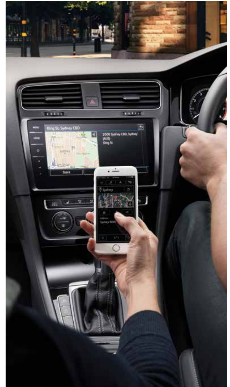
Media Control shown

With its evolutionary styling, impressive level of driver safety equipment as standard, and exceptional performance and comfort, the Golf once again sets the benchmark high.