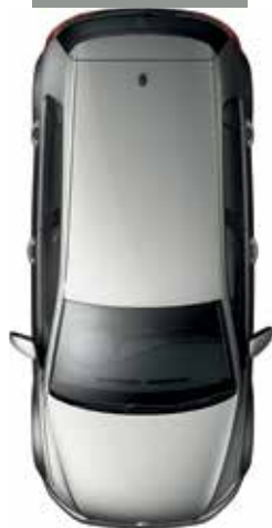
05 Tungsten Silver Metallic*