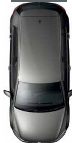
07 Indium Grey Metallic