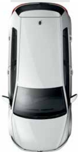
04 Pure White