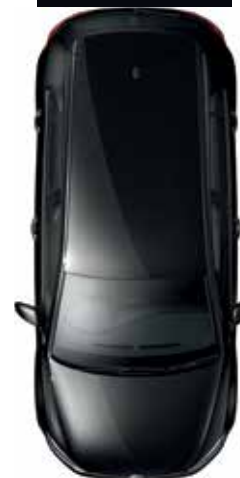
08 Deep Black Pearl Effect