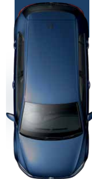
09 Atlantic Blue Metallic

Please note that Metallic and Pearl Effect paint are optional at extra cost. The print process does not allow for exact reproduction of the exterior or the upholstery colours. Please contact your Volkswagen Dealer for further information on colours and upholstery combinations.