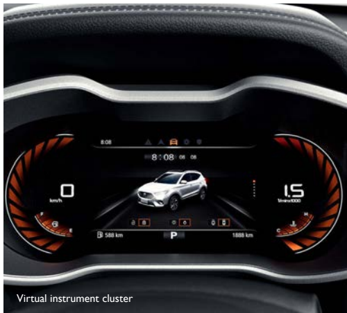
Virtual instrument cluster