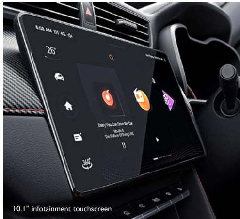
10.1" infotainment touchscreen