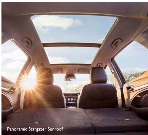
Panoramic Stargazer Sunroof