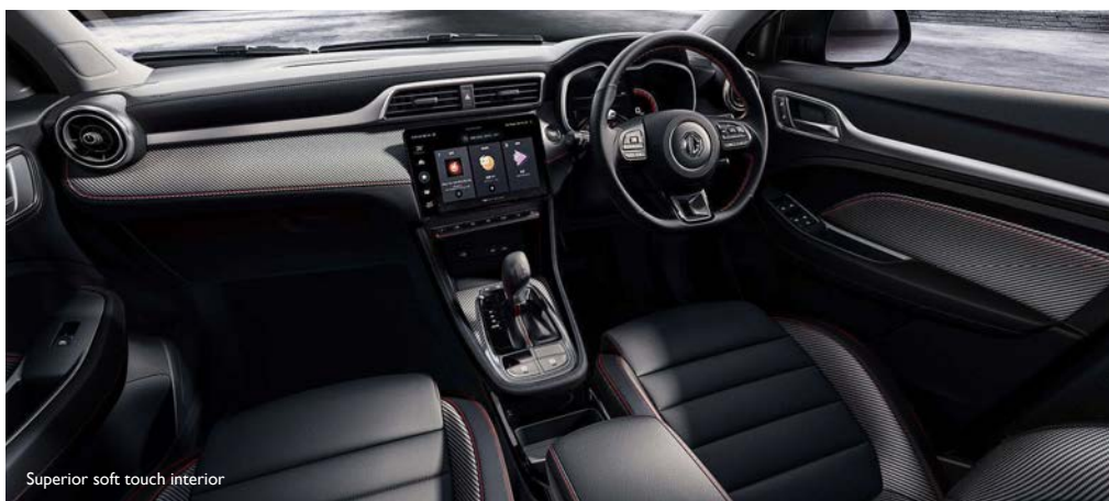
Superior soft touch interior