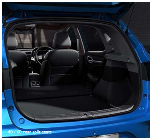
40 / 60 rear split seats