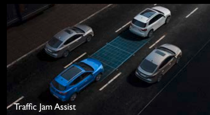
Traffic Jam Assist