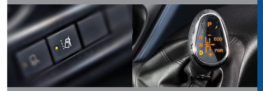
Optional Lane Departure Warning System