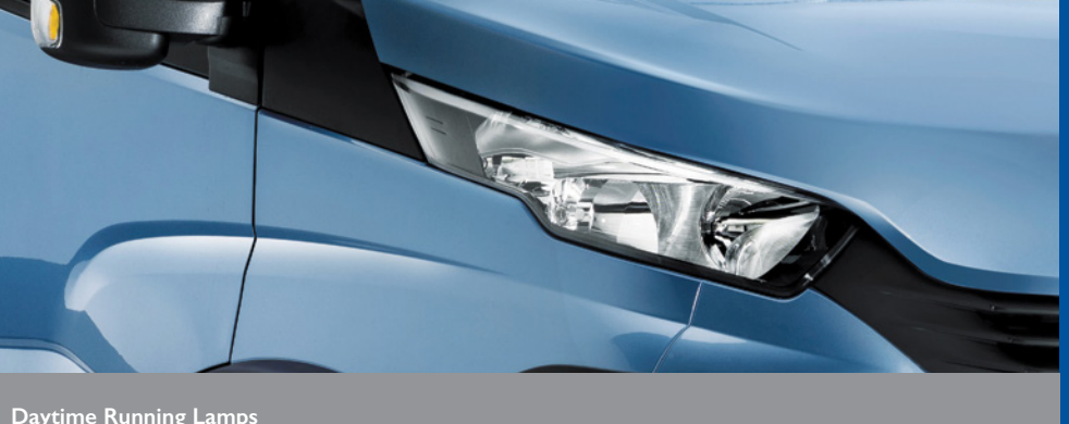
Daytime Running Lamps