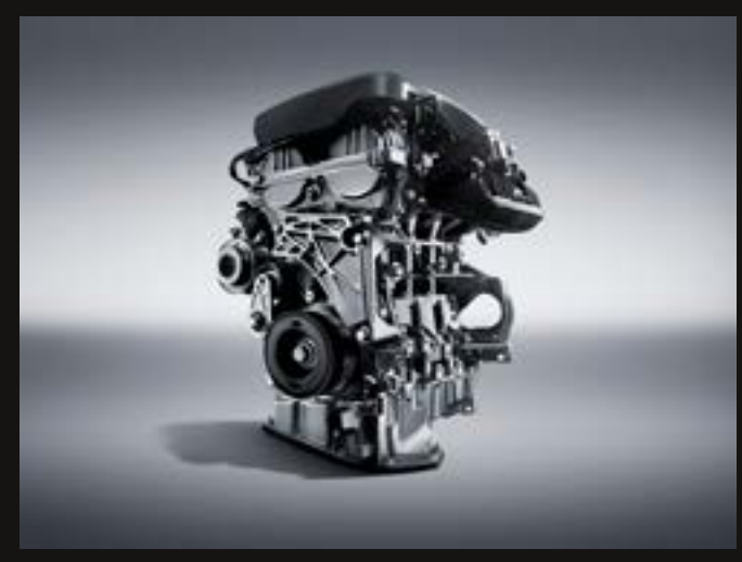
82kW I.0T Netblue