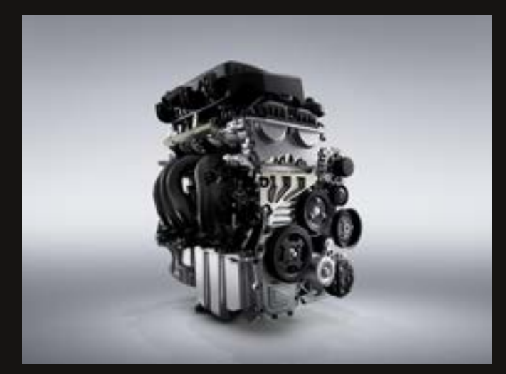
84kW 1.5L NSE Major