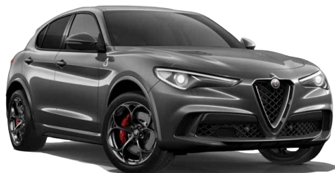
035 Vesuvio Grey (Metallic) Option