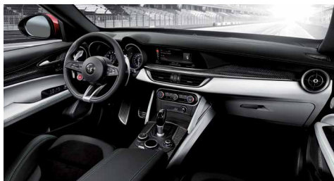
537 Black Leather and Alcantara Seats with White/Green Stitching and Ice Lower Dash Option