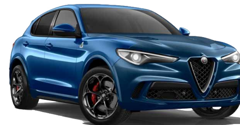
756 Misano Blue (Metallic) Option