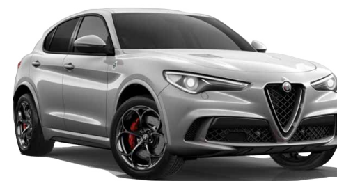
620 Silverstone Grey (Metallic) Option