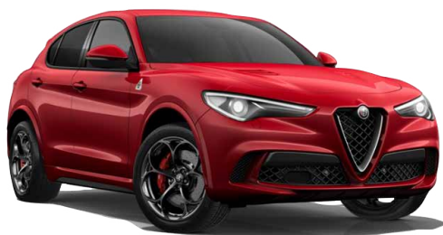
414 Alfa Red (Solid) Standard