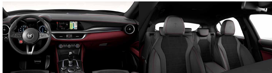
544 Black Leather and Alcantara Seats with Red Stitching and Red Lower Dash Option