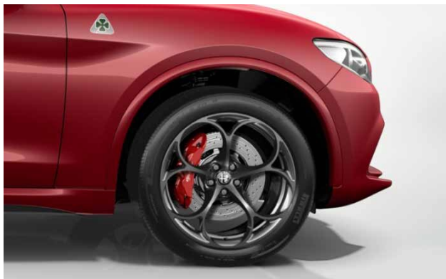
5YN 20-Inch Alloy Wheel (Standard)