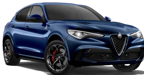
092 Montecarlo Blue (Metallic) Option