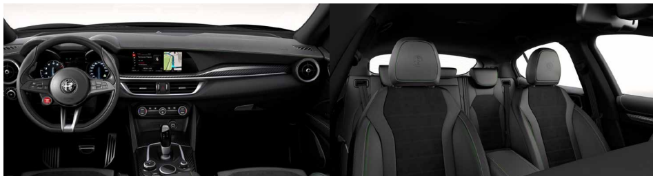
542 Black Leather and Alcantara Seats with White/Green Stitching and Black Lower Dash Option