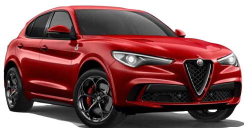
361 Competizione Red (Tri-Coat) Option