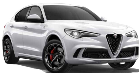
248 Trofeo White (Tri-Coat) Option