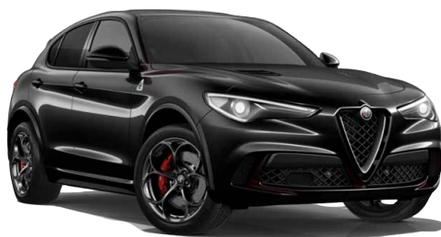
408 Vulcano Black (Metallic) Option