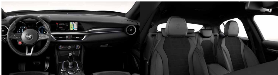
529 Black Leather and Alcantara Seats with Dark Grey Stitching and Black Lower Dash Standard