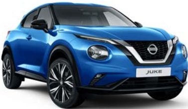
Vivid Blue (M) - RCA**