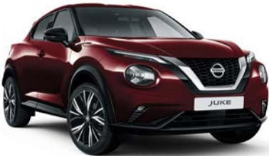
Burgundy (M) - NBQ**