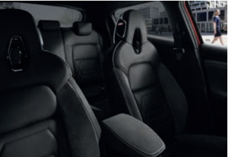
TI STANDARD Black quilted leather-accented* and black Alcantara®