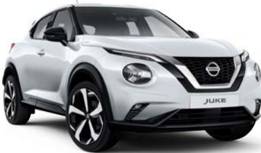
Arctic White (S) - 326**