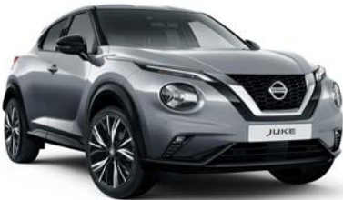
Platinum (M) - KYO*