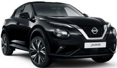
Pearl Black (M) - Z11*