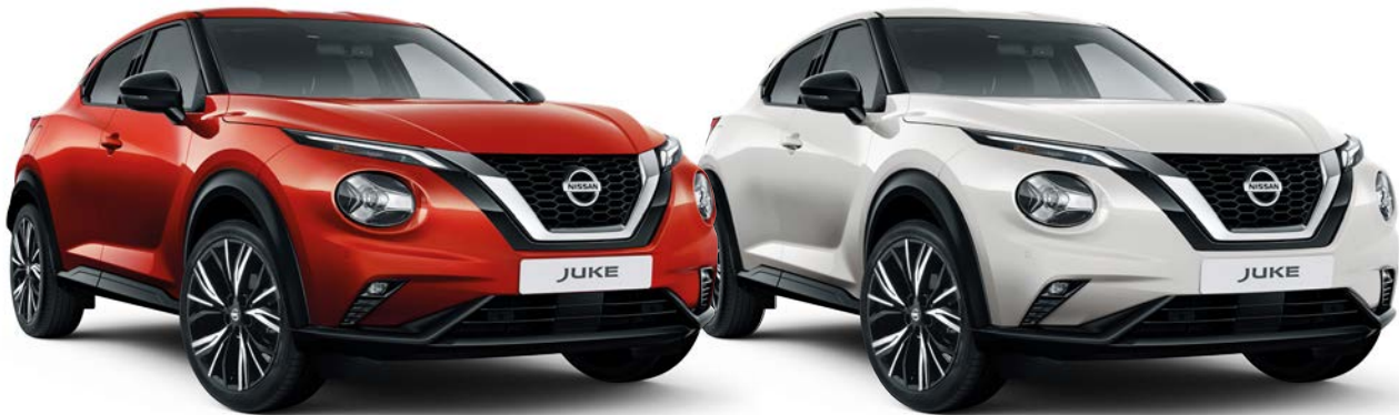
Fuji Sunset Red (M) - NBV