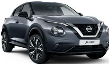
Gun Metallic (M) - KAD*