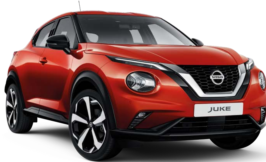
ST-L model shown