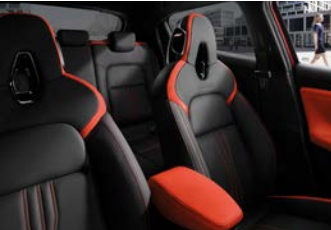
TI OPTIONAL (Energy Orange) Black and orange leather-accented*

A complete ownership experience to help you get the most out of your Nissan. It includes the following: