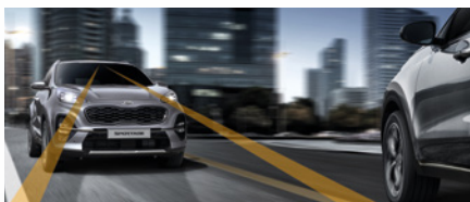
Lane Keeping Assist 1