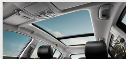
Panoramic Sunroof (GT-Line)