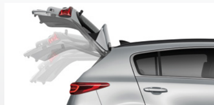
Smart Power Tailgate (SX+ & GT-Line)