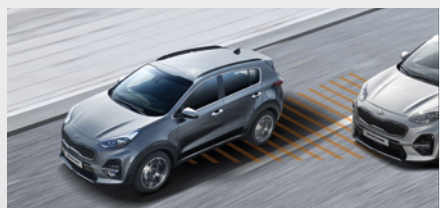
Blind Spot Detection 1 (GT-Line)