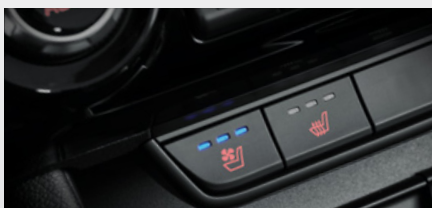
Heated and Ventilated Front Seats (GT-Line)