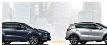
AEB Safety 1