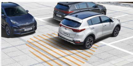
Rear Cross Traffic Alert 1 (GT-Line)