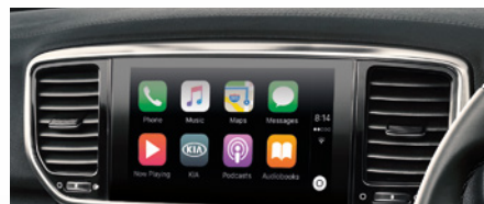
Smartphone Connectivity 2