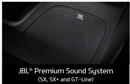
JBL® Premium Sound System (SX, SX+ and GT-Line)