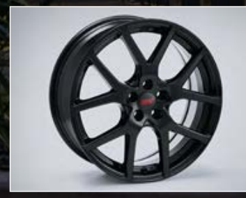
STI ALLOY WHEEL SET (4) – 18" (BLACK)

So whether you want to protect your investment, or be inspired to go further, check out the full range - including popular accessory bundle packs offering great value at www.subaru.com.au/impreza/accessories