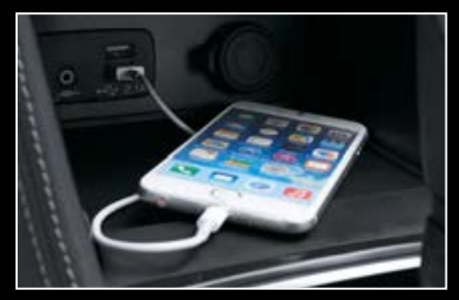
Subaru Impreza 2.0i-S AWD shown.

Tablet-like, infotainment screen with quick response touch and crystal clear graphics. With Apple CarPlay<sup>®</sup> and Android Auto<sup>™</sup> smartphone connectivity<sup>1</sup> as standard.