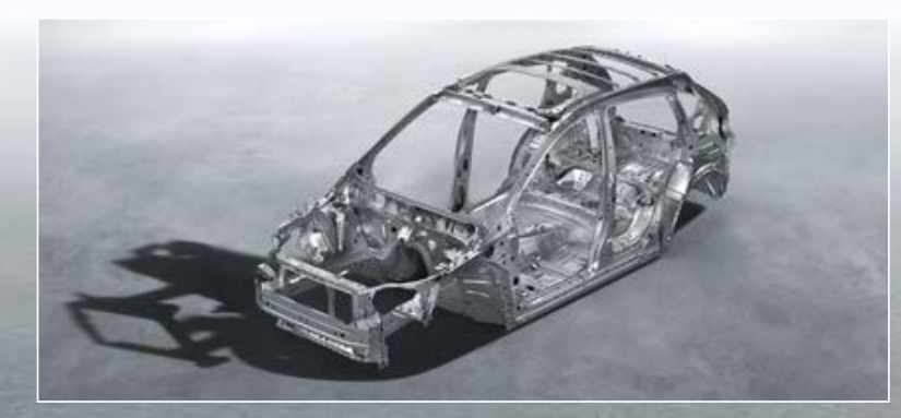
The SGP and ring-shaped passenger safety cell absorb and direct impact force around the cabin, rather than through it.

It has always been Subaru's purpose to design vehicles with a crucial advantage in road safety and occupant protection. While Towards Zero fatal road accidents in a Subaru vehicle by the year 2030<sup>1</sup> represents Subaru's ambitious future target, decades of astute observation, structural development and design research has informed the remarkable safety advances built into the 5 star ANCAP<sup>2</sup> safety rated Subaru Impreza.