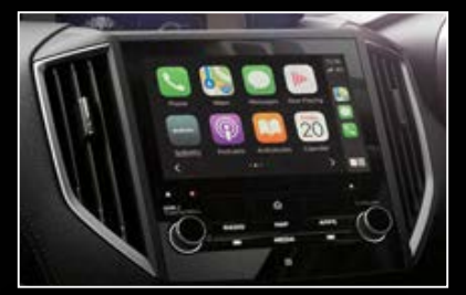
Subaru Impreza 2.0i-S AWD shown.

Apple CarPlay<sup>®</sup> and Android Auto<sup>™</sup> connectivity<sup>1</sup> allows you to use voice commands<sup>2</sup> and hands-free smartphone functionality. Tap the large touchscreen to access an array of information and entertainment. Look up contacts, bring up maps and access favourite apps, news, music, podcasts and more. Revel in seamless driving with infotainment steering wheel controls intuitively placed for drivers negotiating city traffic. While quick-response, fingertip operated paddle gear shifters, mean your hands never need to leave the steering wheel.