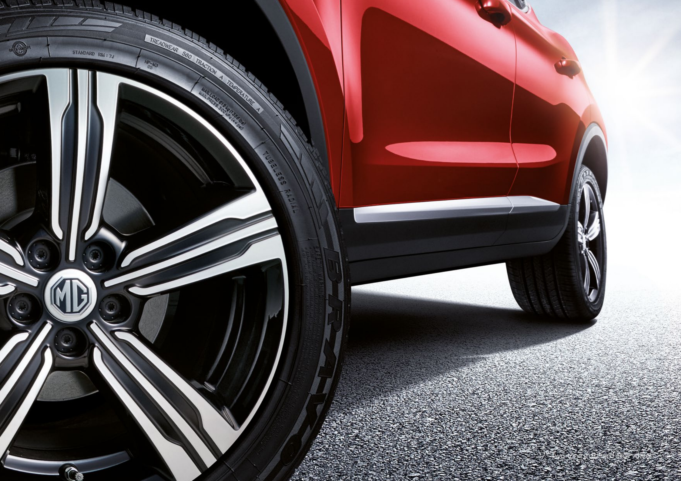
17" Two-tone machined alloy wheels