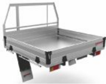
GENERAL PURPOSE ALUMINIUM TRAY Internal Length 1650mm x 1777mm Width