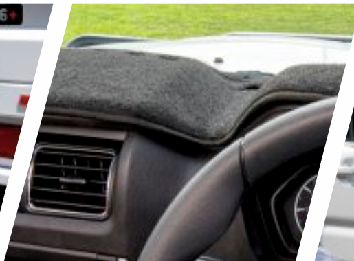
• DASH MAT