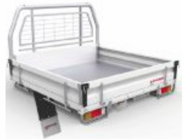
STEEL TRAY Internal Length 1650mm x 1780mm Width