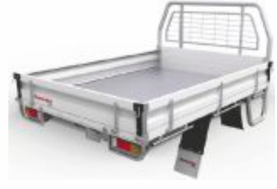
STEEL TRAY Internal Length 2550mm x 1780mm Width