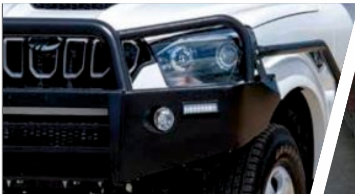
• WINCH COMPATIBLE STEEL BULL BAR AND OPTIONAL BRUSH RAILS