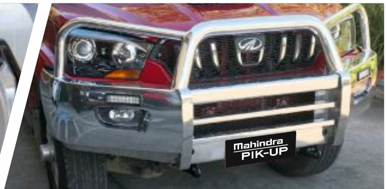
• Alloy Bull Bar (Not Winch Compatible)