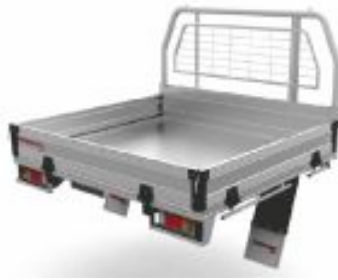
HEAVY DUTY ALUMINIUM TRAY Internal Length 1650mm x 1777mm Width