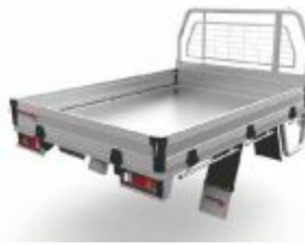
HEAVY DUTY ALUMINIUM TRAY Internal Length 2550mm x 1777mm Width