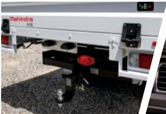
• TOW BAR