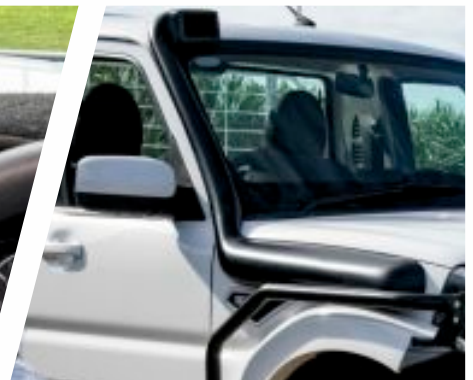
• FIBREGLASS SNORKELS