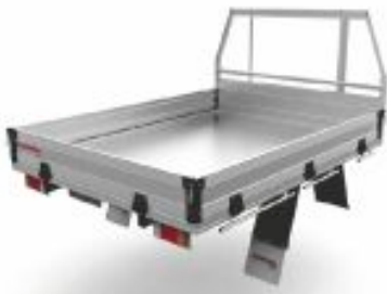
GENERAL PURPOSE ALUMINIUM TRAY Internal Length 2550mm x 1777mm Width