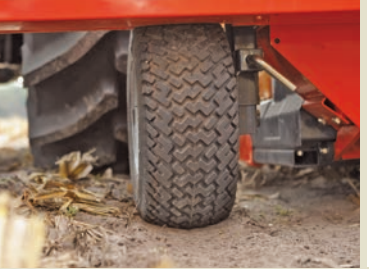
Support wheel 90 S and MC 90 S TWIN) IMĊ