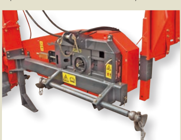
Simple lateral adjustment for lower hitch bar (MC 90 S and MC 90 S TWIN)