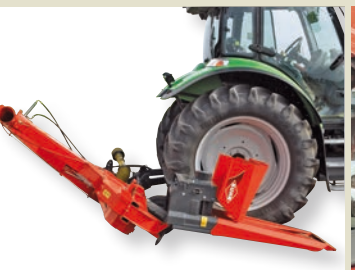
Easy access for inspection, maintenance and cleaning (MC 90 S and MC 90 S TWIN)