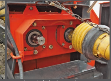
The hydraulic side shift permits the use of wide tractors and simplifies the work along the field boundaries and ditches.

Two drive shafts for front and rear mounting