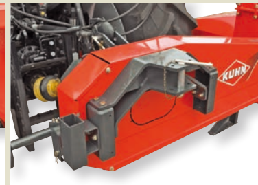
Trailer hitch in top position (MC 90 S and MC 90 S TWIN)