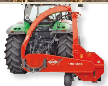
Foldable chute for storage and transport (MC 90 S and MC 90 S TWIN)