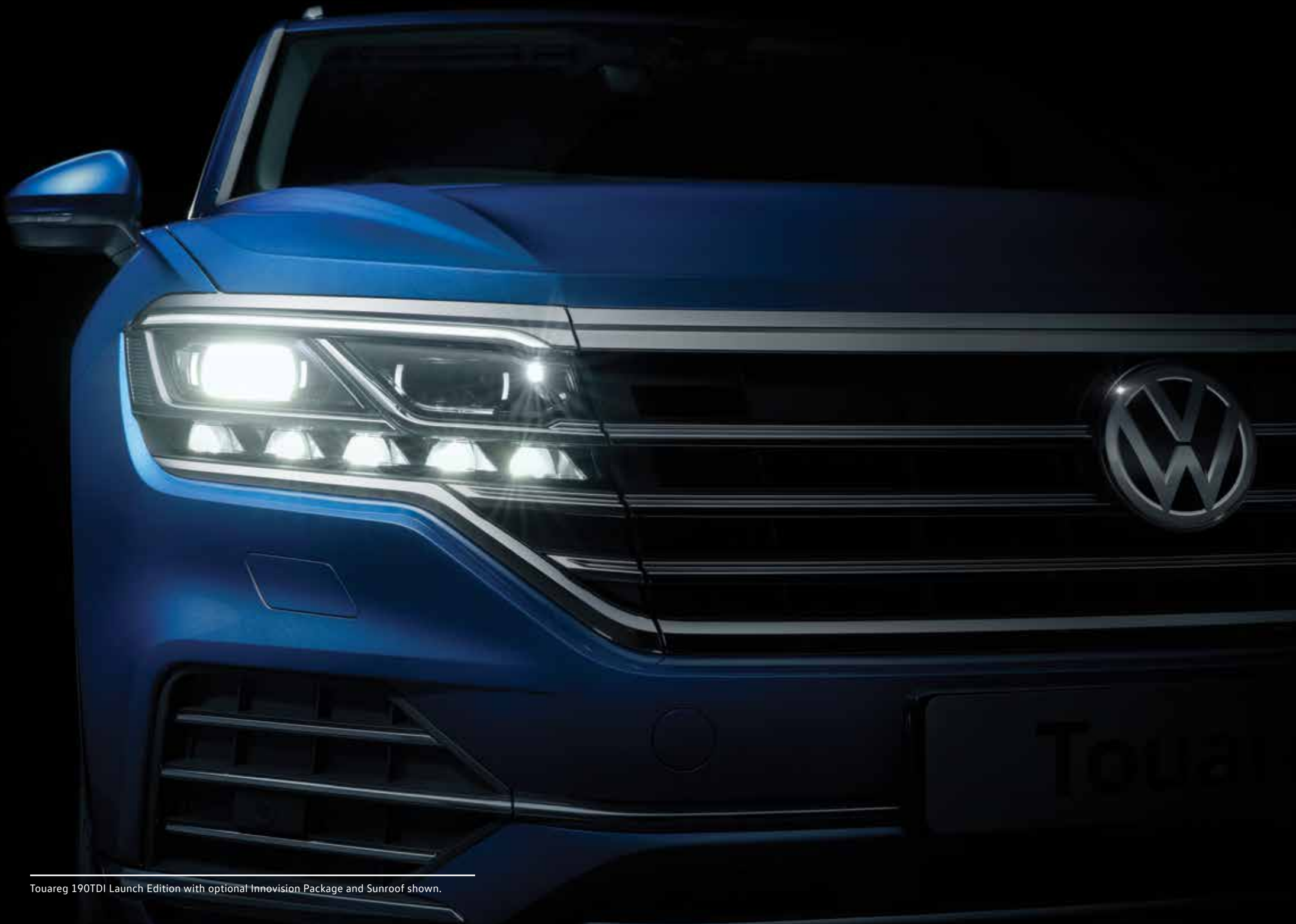
Touareg 190TDI Launch Edition with optional InnoVision Package and Sunroof shown.