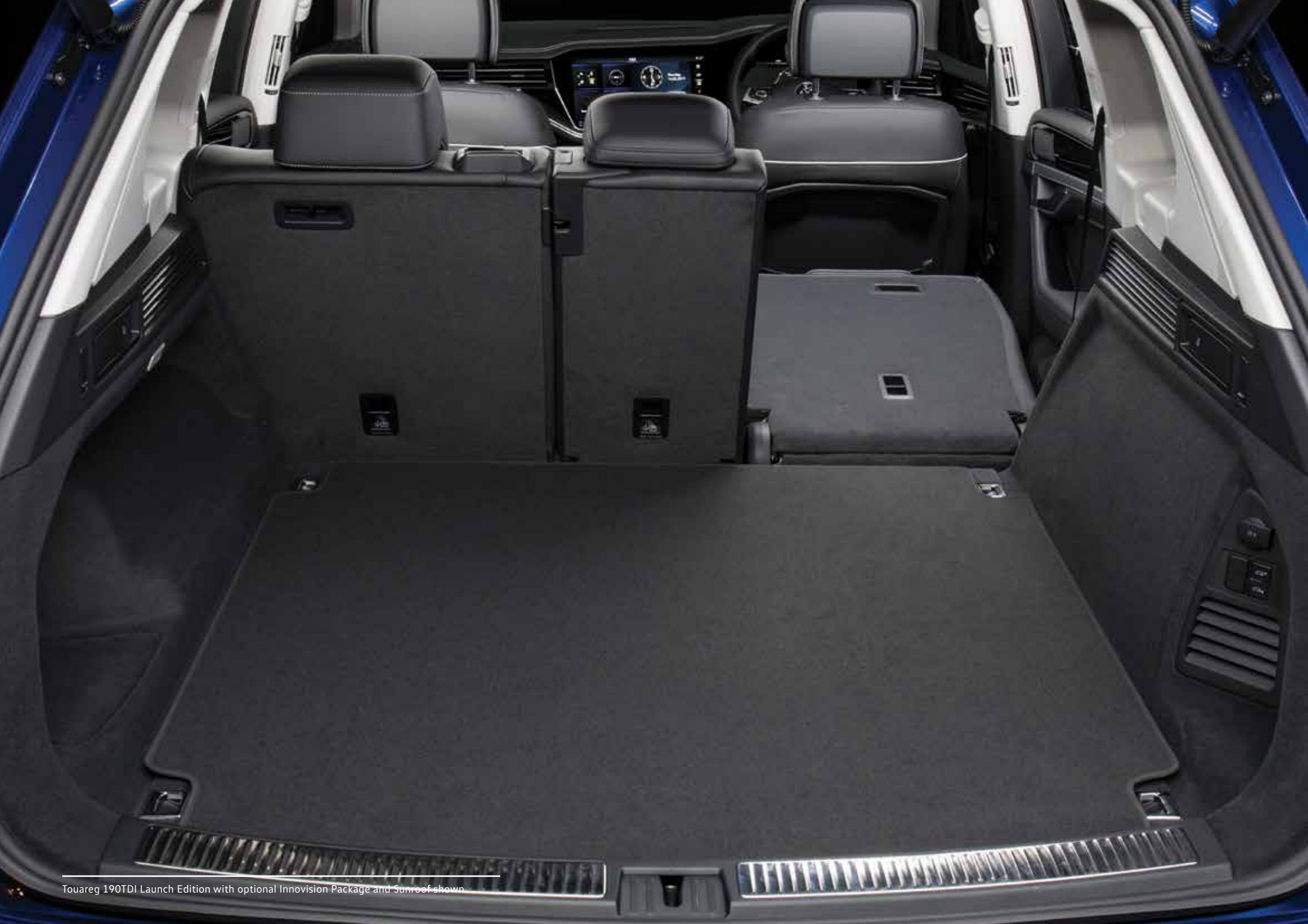
Touareg 190TDI Launch Edition with optional Innvision Package and Sunroof shown