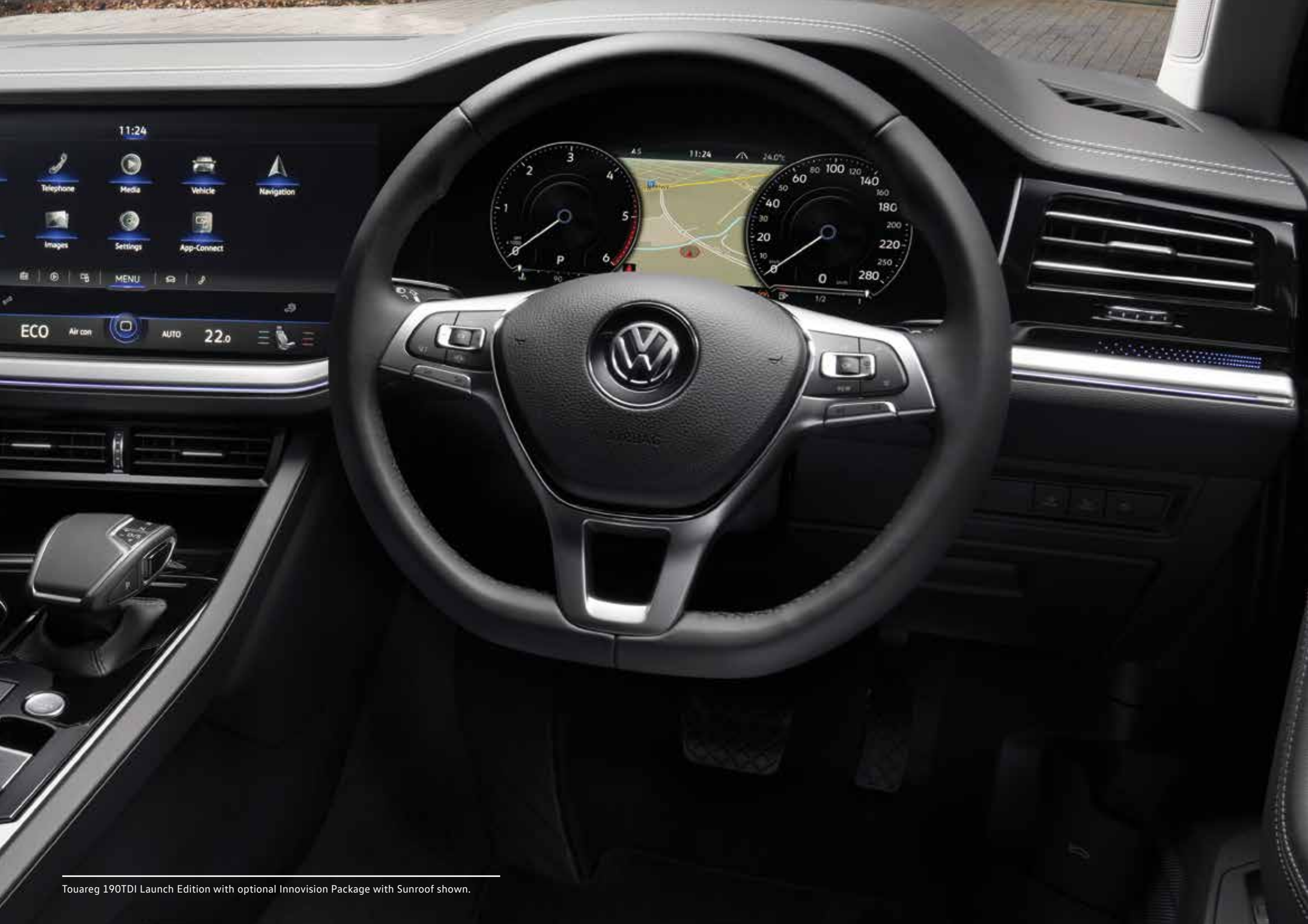
Touareg 190TDI Launch Edition with optional InnoVision Package with Sunroof shown.