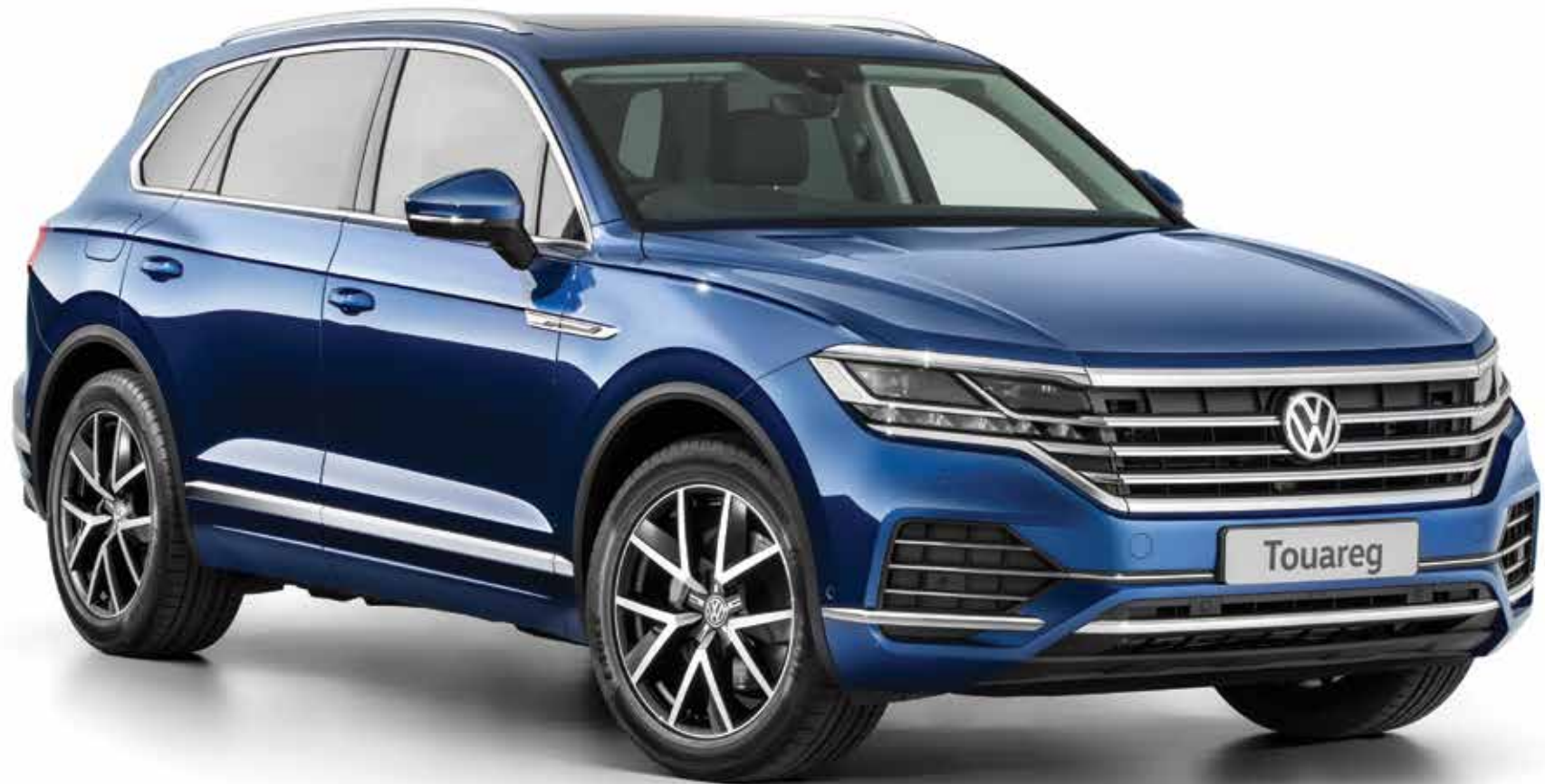
Touareg 190TDI Launch Edition with optional Innovision Package and Sunroof shown.