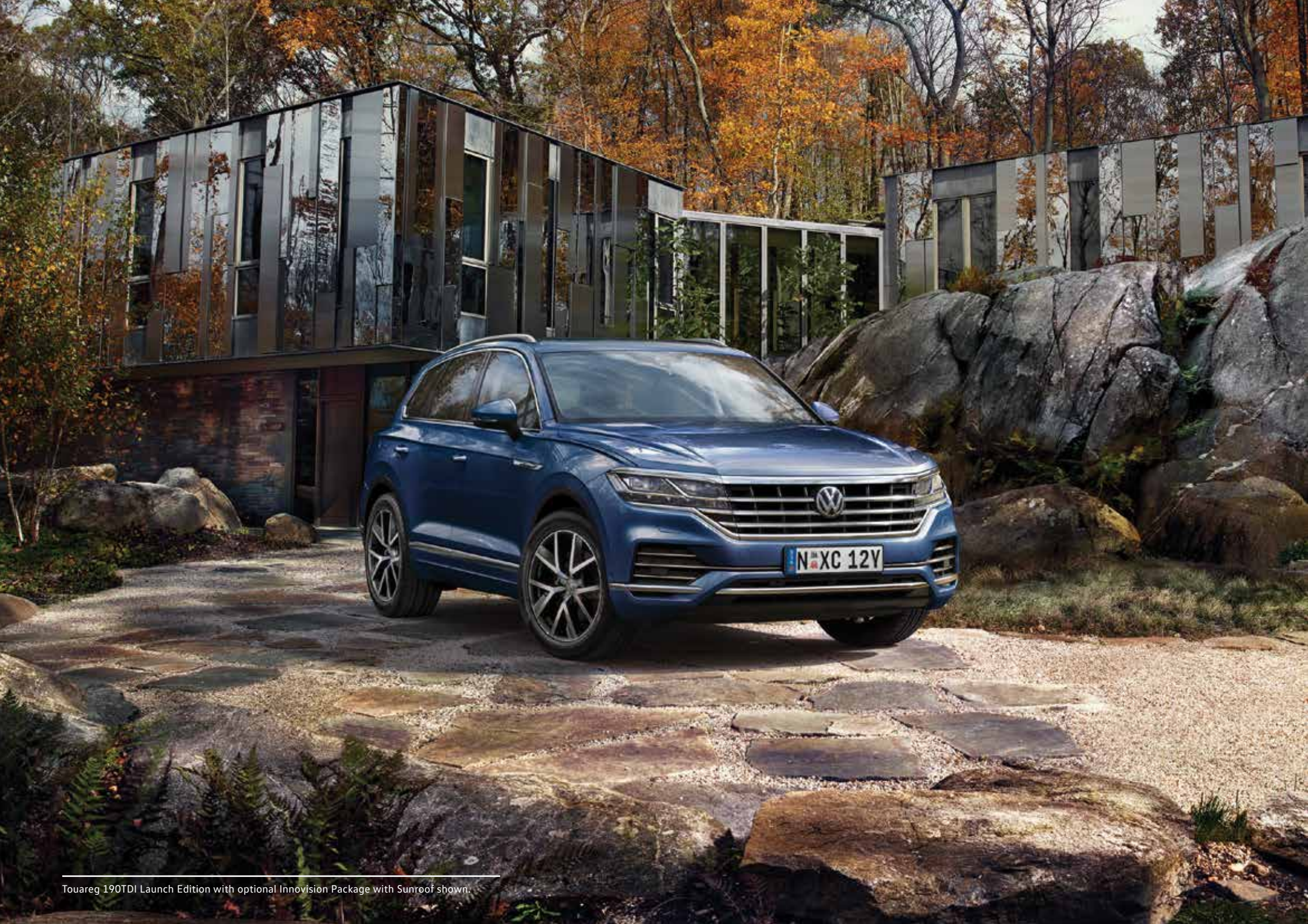
Touareg 190TDI Launch Edition with optional InnoVision Package with Sunroof shown.