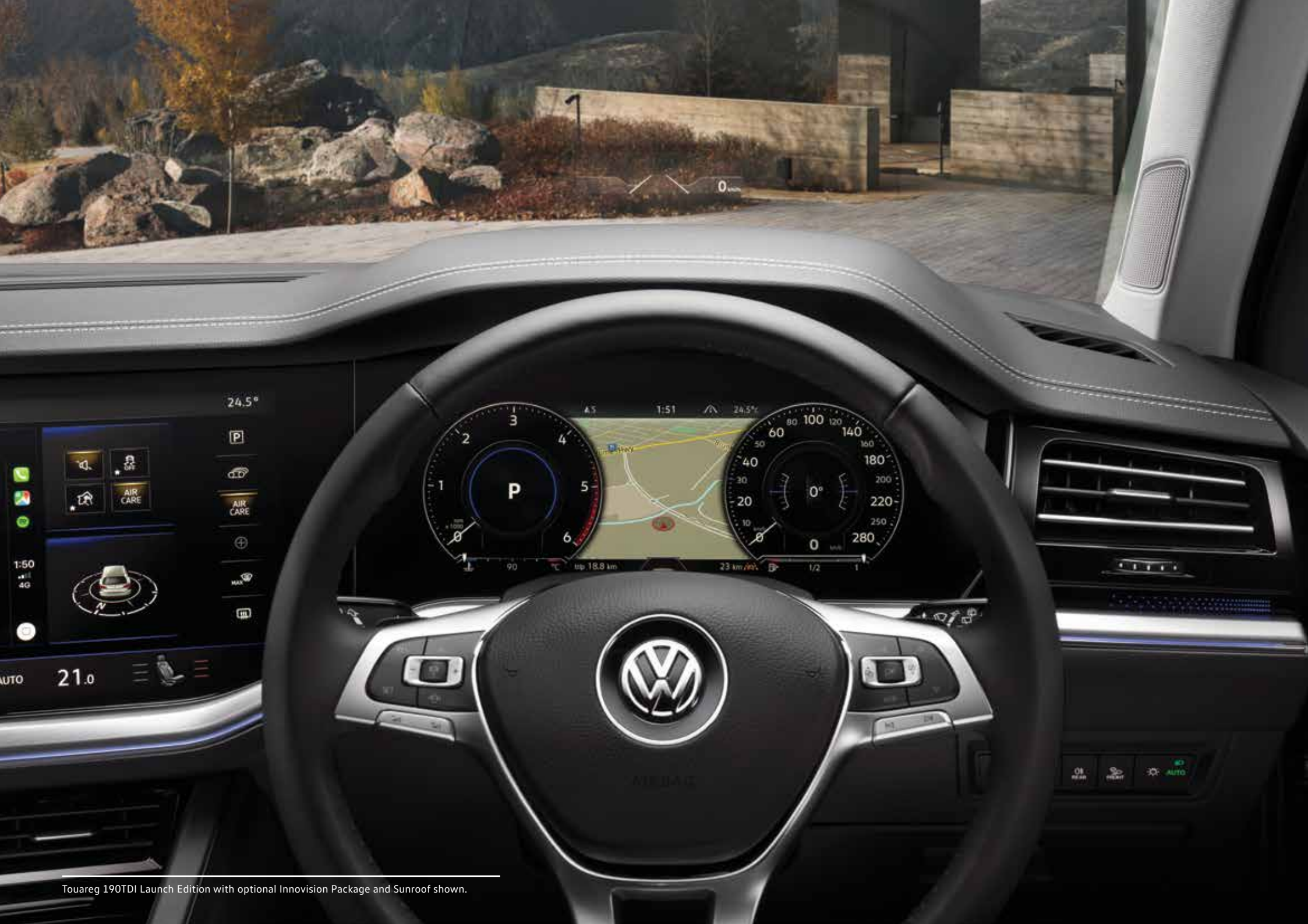
Touareg 190TDI Launch Edition with optional InnoVision Package and Sunroof shown.