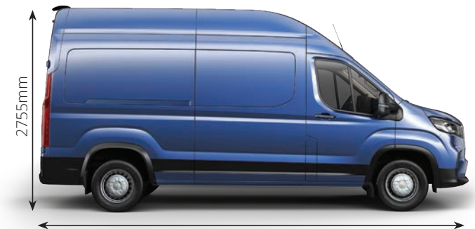
LONG WHEEL BASE / HIGH ROOF (LWB / HR)

5940mm 12.33 m 3 of Cargo / Payload (kg)*: Man 1640/Auto 1620