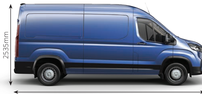
LONG WHEEL BASE / MID ROOF (LWB/MR)

5940mm 10.97 m 3 of Cargo / Payload (kg)*: Man 1670/Auto 1640