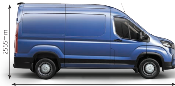
MID WHEEL BASE (MWB)

5546mm 9.66 m 3 of Cargo / Payload (kg)*: Auto 1500