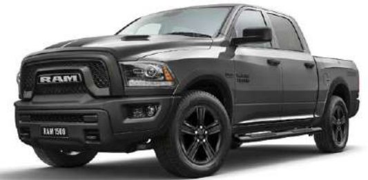
Granite Crystal (M)