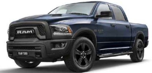
Patriot Blue (P)

M = Metallic, P = Pearlescent. Colours have been reproduced as faithfully as possible, however actual colours may vary due to screen settings.