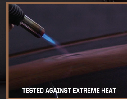
TESTED AGAINST EXTREME HEAT

Ram Premium Protection, assists in protecting your RAM against fading and loss of gloss, clear coat delamination*, water marks, weather induced oxidation, and damage caused by: bird and bat droppings, tree sap, bug splatter, bore water, sunscreen, rail dust and fallen leaves.