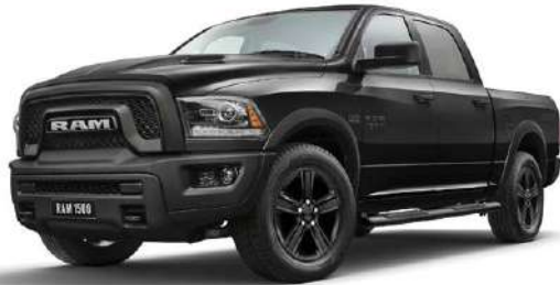
Diamond Black (P)