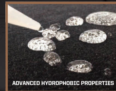
ADVANCED HYDROPHOBIC PROPERTIES

* Warranty terms, conditions and exclusions apply.