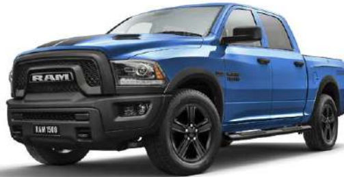
Hydro Blue (P)