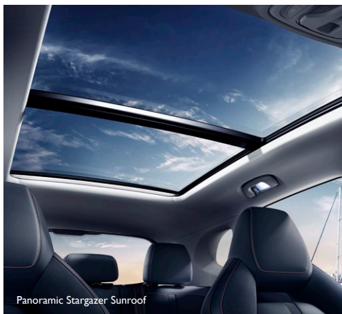
Panoramic Stargazer Sunroof