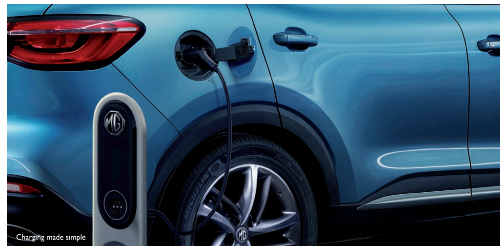
Charging made simple

Actual Australian specification may vary from vehicle shown.