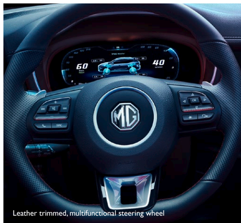
Leather trimmed, multifunctional steering wheel