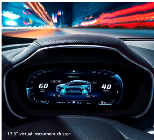
12.3" virtual instrument cluster