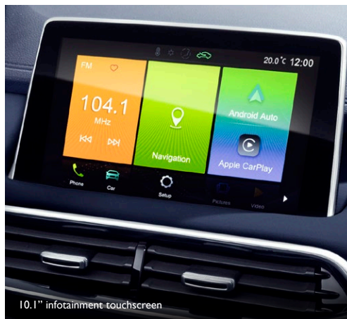
10.1" infotainment touchscreen