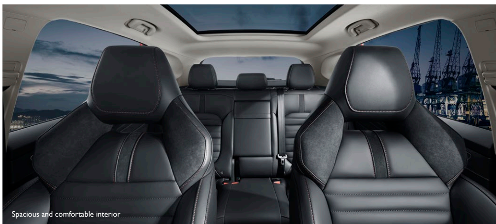
Spacious and comfortable interior