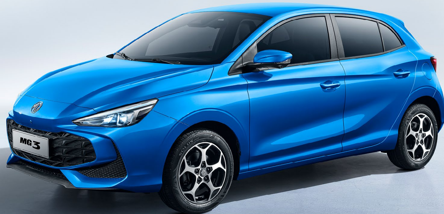
BRIGHTON BLUE METALLIC

Colours in this brochure may vary to those on the vehicle. White interior only available on MG3 Hybrid+ Essence for Brixton Blue Metallic, Black Pearl Metallic, Sloane Silver Metallic and Hampstead Grey Metallic colours.