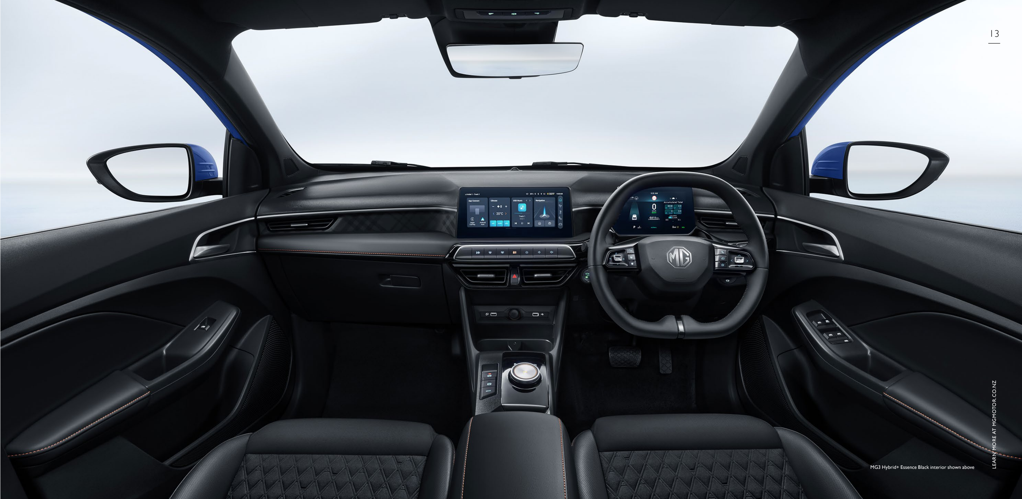
MG3 Hybrid+ Essence Black interior shown above